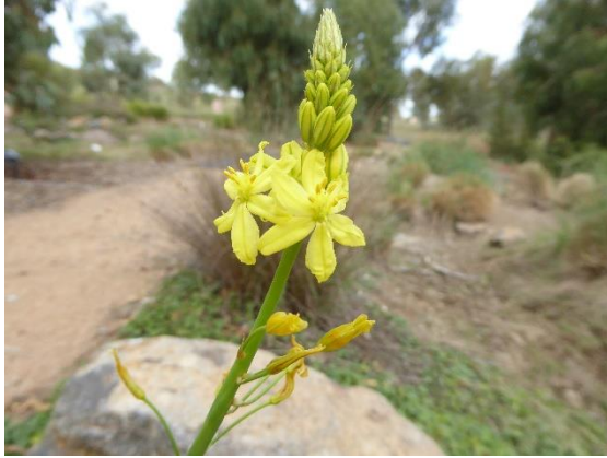
Bulbine glauca , Rock Lily A tufted perennial herb.