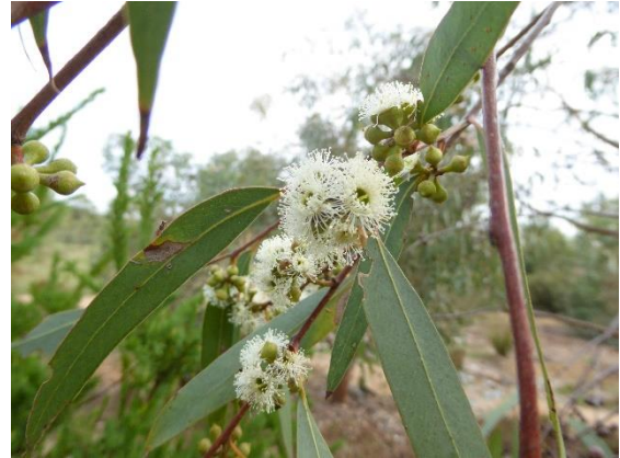
Eucalyptus macrorhyncha , Red Stringybark. This species has been flowering for months