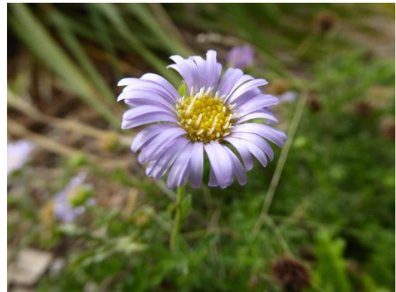
Calotis glandulosa , Mauve Bur-daisy. A perennial daisy with spiny seed heads.