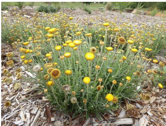
Coronidium gunnianum , Pale Everlasting. A long flowering perennial daisy.