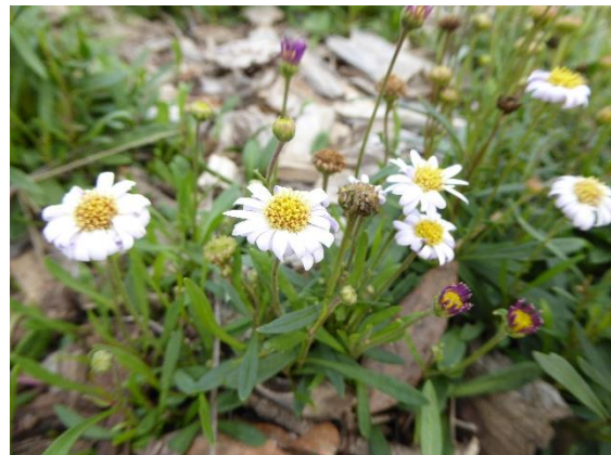
Brachyscome graminea , Grass Daisy. A hardy low growing summer flowering perennial.