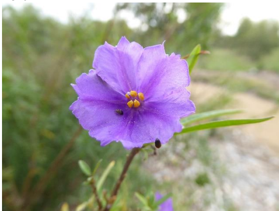
Solanum linearifolium , Mountain Kangaroo Apple. A long flowering tall woody shrub.