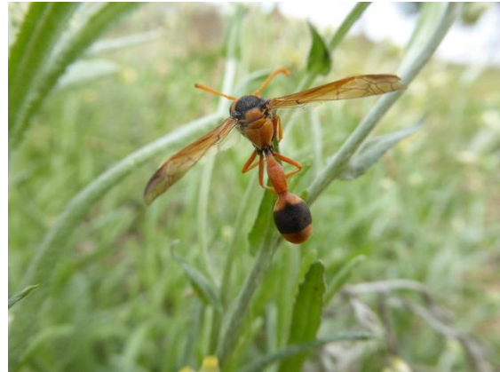
A potter Wasp on Helichrysum luteo-album . A volunteer of the daisy family.