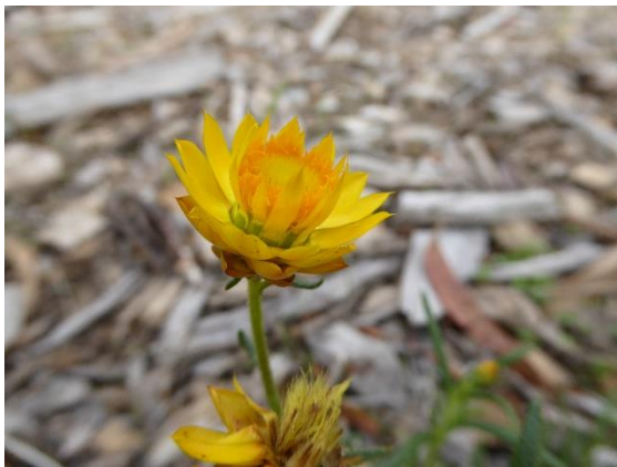
Xerochrysum viscosum , Sticky Everlasting. A hardy perennial daisy.