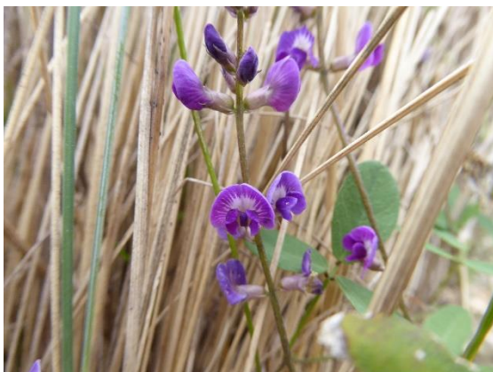
Glycine tabacina , Variable Glycine. A scrambling forb of the pea family(Fabaceae)