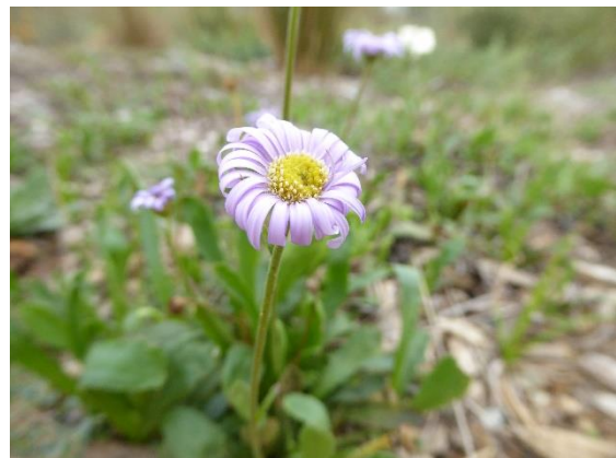
Brachyscome spathulata , Spoon Daisy. Another perennial daisy.

Our working bees are held each Thursday morning from 8am, please feel free to join our friendly group at whatever time you can. We break for morning tea at 10 am at the table near our shed. An excellent (though byo) morning tea is guaranteed.