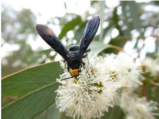
Scolia verticalis , Yellow Headed Hairy Flower Wasp on E macrorhyncha the Red Stringybark