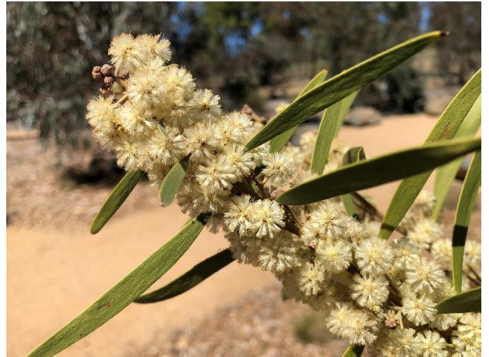
October. Acacia melanoxylon , Blackwood. A tree of the higher rainfall areas from Queensland to SA.