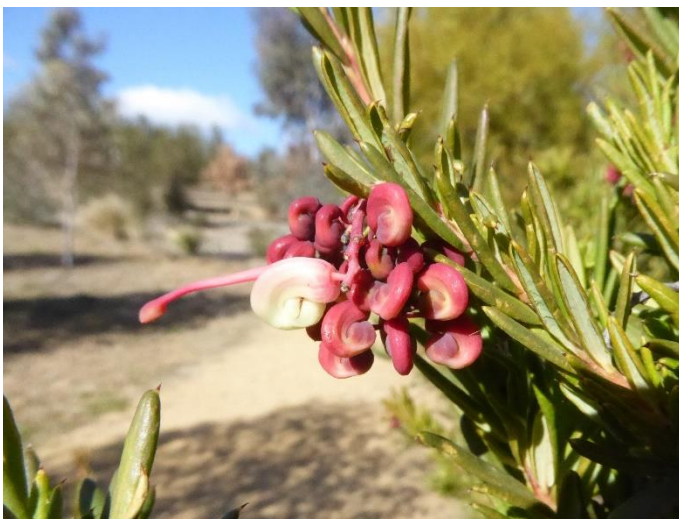
August Grevillea iaspicula , Wee Jasper Grevillea. A tall shrub that is endangered in its natural setting.