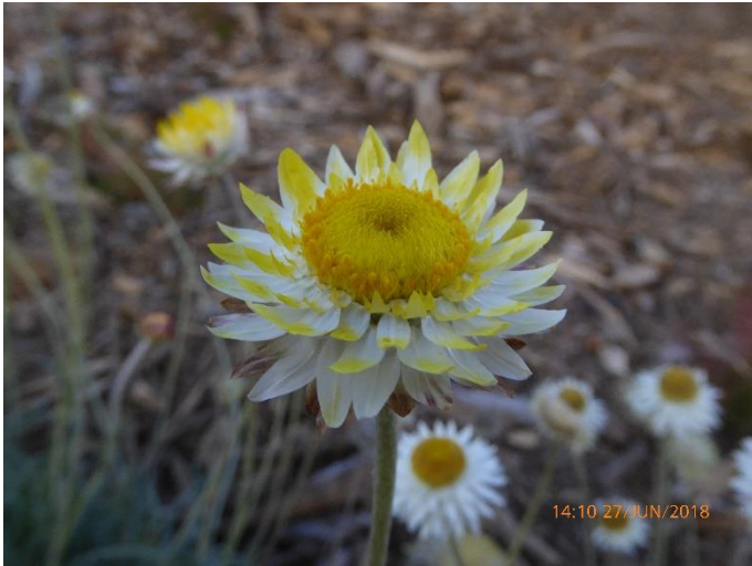
July. Leucochrysum albicans , Hoary Sunray. A long flowering local daisy. Grows well on gravel surfaces.