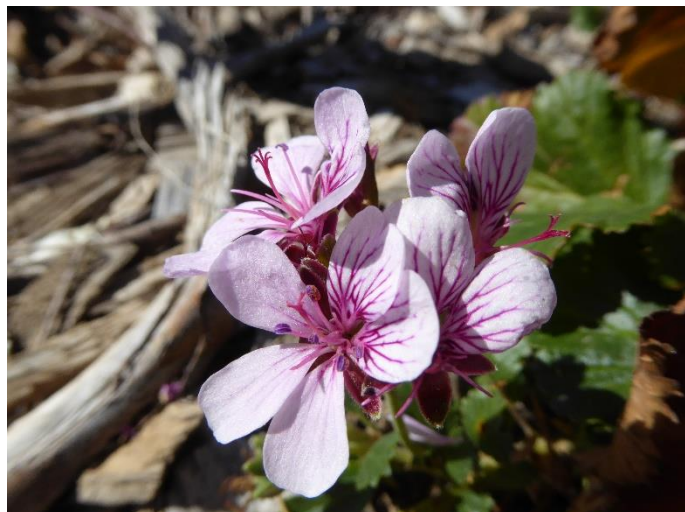
April. Pelargonium australe , Native Pelargonium. A member of the Geraniaceae family. Long flowering.