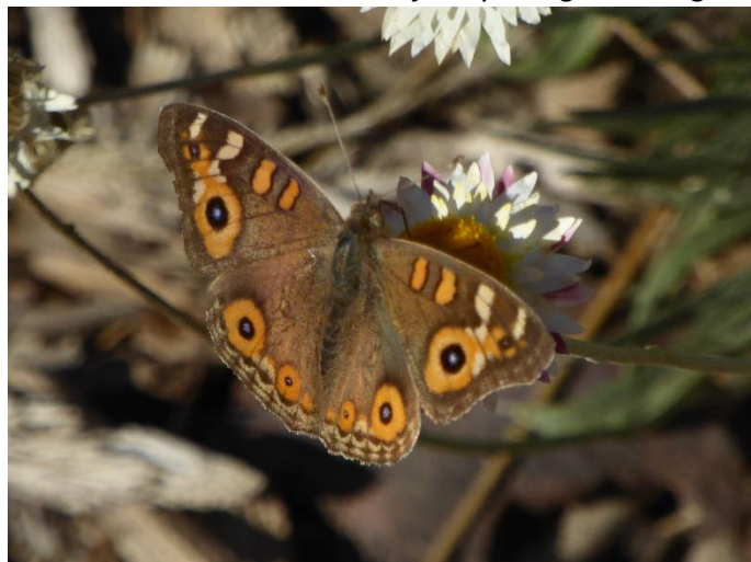
May. Junonia villida , Meadow Argus Butterfly. This is found Australia wide. Their caterpillars are black and Spikey.