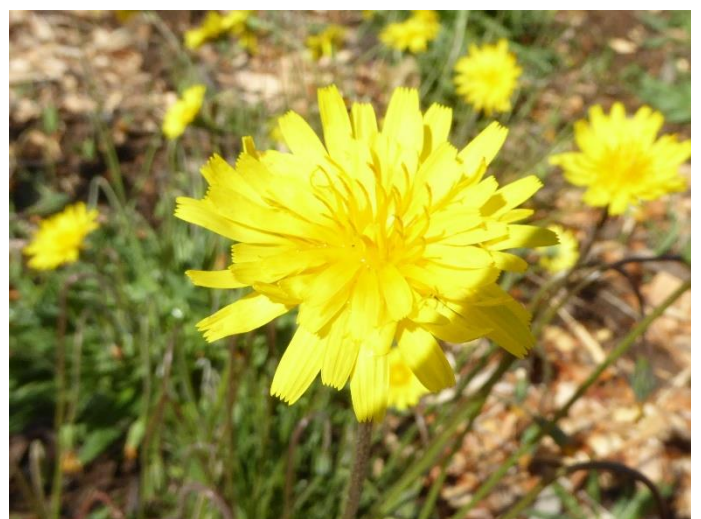
November. Microseris walteri (was lanceolata) Murnong. A food source for indigenous communities.