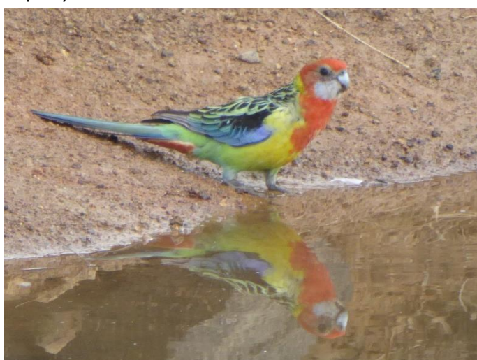
June. Platycercus eximius , Eastern Rosella and reflection. A common species that often feeds on grass seed.