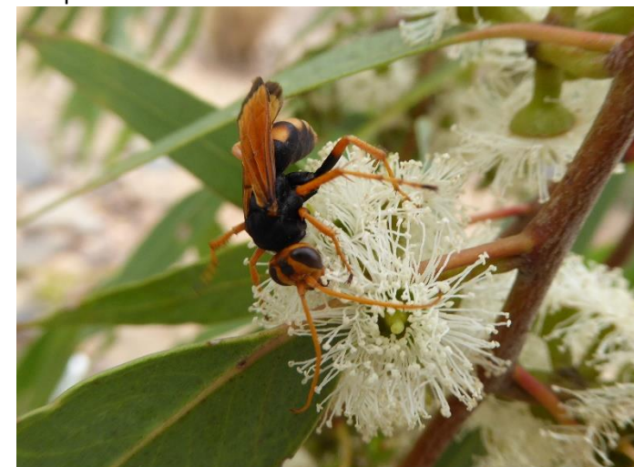
March. Eucalyptus macrorhyncha , Red Stringybark & Thynnus zonatus , Native Flower Wasp.