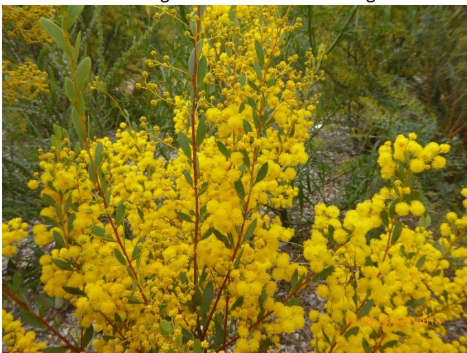
Mid-September Acacia buxifolia , Box-leaf Wattle. A tall shrub. A local wattle with bright golden blossom.