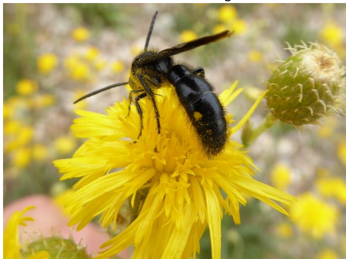
February. Podolepis jaceoides , Showy Copper-wire Daisy & Laeviscolia frontalis , Two-spot Hairy Flower Wasp.