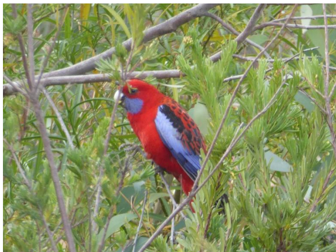
Platycercus elegans Crimson Rosella. Feeding in a clump of Grevillea iaspicula Wee Jasper Grevillea.