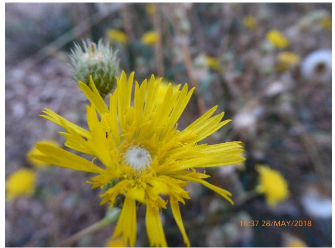
Podolepis jaceoides , Showy Copper-wire Daisy. Has been flowering for 6 months, must end soon.