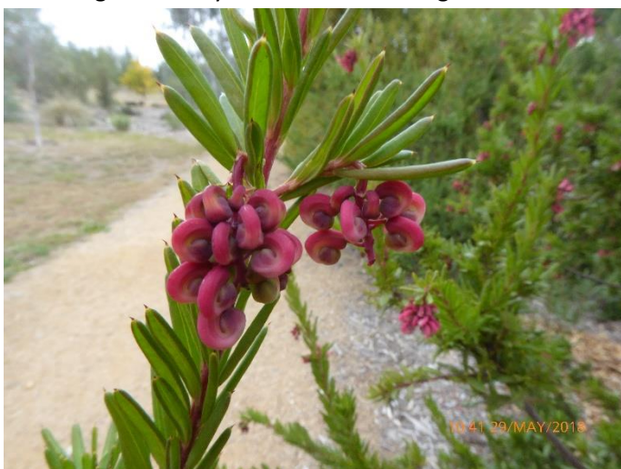
Grevillea iaspicula , Wee Jasper Grevillea. A tall shrub that is endangered in its natural setting.