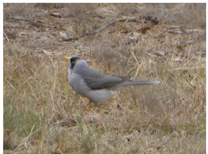
Manorina melanocephala , Noisy Miner. A common bird of the honeyeater family known for aggressive behaviour to other birds.

Our working bees are held every Thursday morning from 8am, please feel free to join our friendly group at whatever time you able to. We break for morning tea at 10 am at the table near our shed. An excellent morning tea is guaranteed.