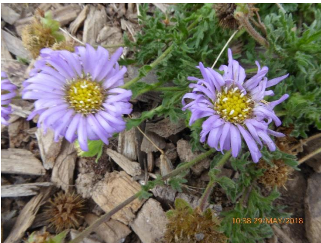
Calotis glandulosa , Mauve Burr-daisy. A perennial daisy with spiny seeds. A vulnerable species in NSW.