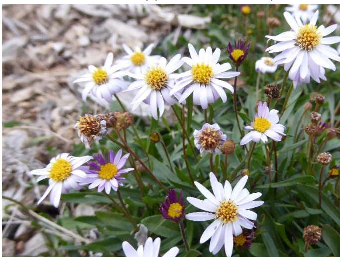
Brachyscome graminea , Grass Daisy. A hardy summer and autumn flowering perennial daisy.