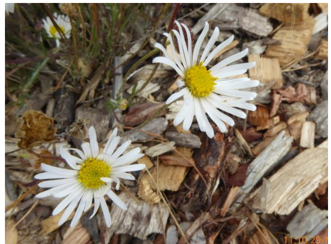
Brachyscome dentata , Lobe-seed Daisy. Another perennial daisy found over most of NSW.