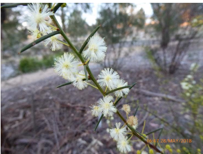
Acacia genistifolia , Spreading or Early Wattle. Can flower from late autumn to early spring.