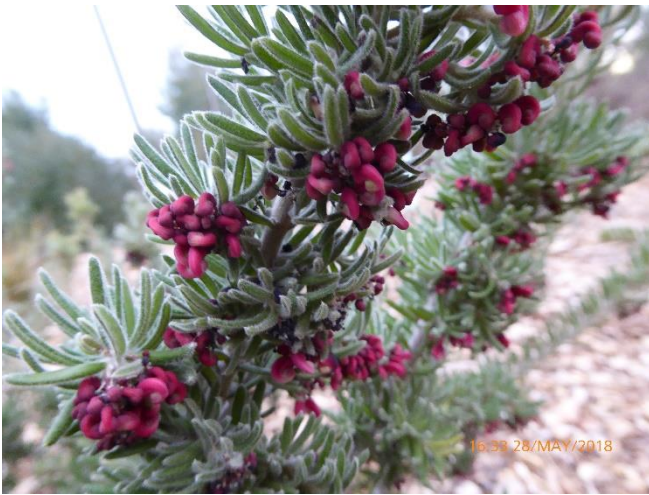
Grevillea lanigera , Woolley Grevillea, so called for its hairy branchlets and leaves. A woodland species.