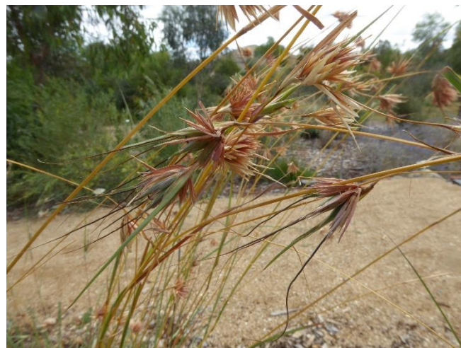
Themeda triandra , Kangaroo Grass. The best known of our native grasses. Cut back in late autumn/winter.