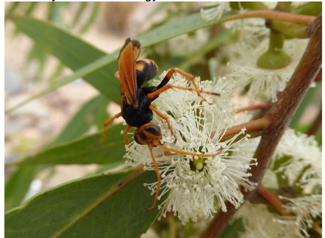
Thynnus zonatus , Native Flower Wasp on Eucalyptus macrorhyncha Red Stringybark.

Our working bees are held every Thursday morning from 8am, please feel free to join our friendly group at whatever time you able to. We break for morning tea at 10 am at the table near our shed. An excellent morning tea is guaranteed.