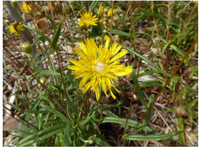
Podolepis jaceoides Showy Copper-wire Daisy. These plants have flowered well this season.