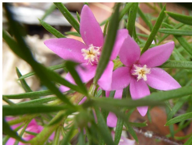
Crowea exalata Ginninderra Falls, Small Crowea A long flowering local plant