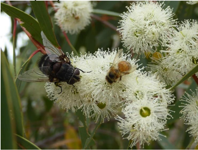
Rutilla sp.(genus) Bristle Fly and bee on Eucalyptus macrorhyncha , Red Stringybark blossom.