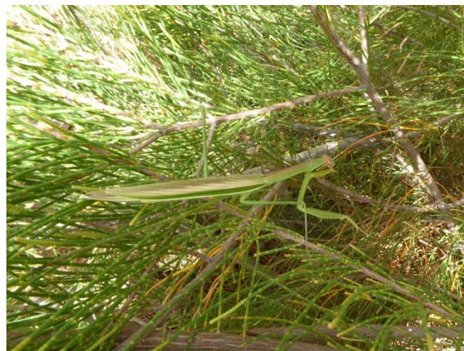
Tenodera australasiae , Purple-winged Mantis is well camouflaged within Allocasuarina nana Dwarf She-oak