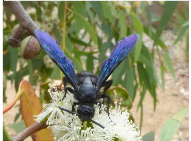
Scolia soror , Blue-black Flower Wasp on Eucalyptus macrorhyncha Red Stringybark blossom.