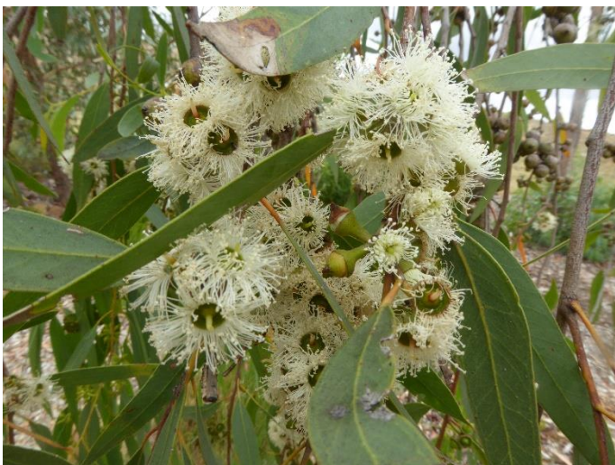
Eucalyptus macrorhyncha , Red Stringybark. This tree is attracting numerous insects in warm weather, see next page.