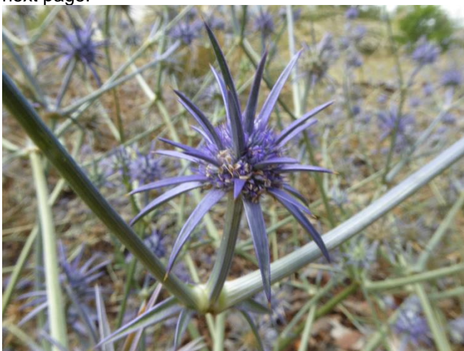
Eryngium ovinum , Blue Devil. A perennial herb with a thistle like head. Regrows from the base each year.