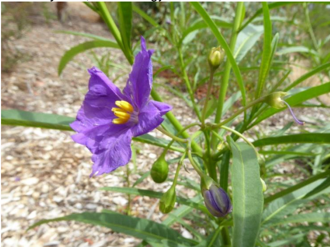
Solanum linearifolium , Mountain Kangaroo Apple. A tall long flowering woody shrub that readily reseeds.