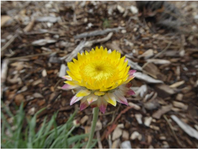
Leucochrysum albicans , Hoary Sunray. Long flowering local daisy with yellow or white forms.