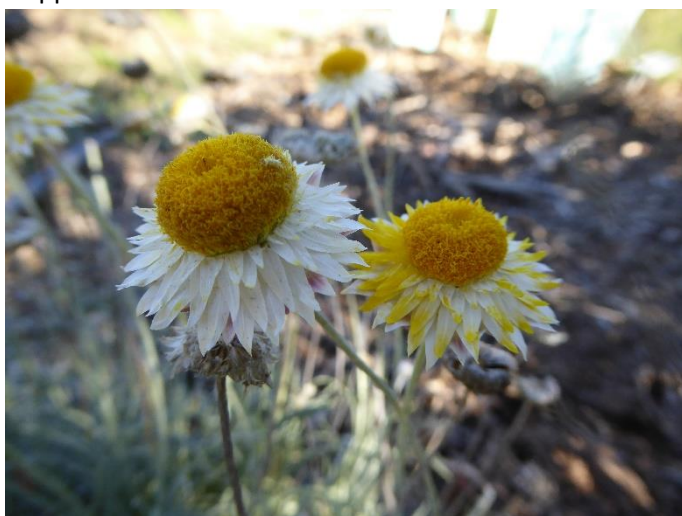
Leucochrysum albicans , Hoary Sunray. A long flowering local perennial daisy. Likes to grow in gravel.