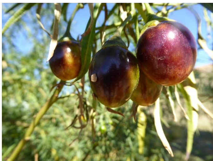
Fruit of Solanum linearifolium , Mountain Kangaroo Apple.