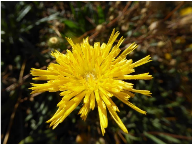
Podolepis jaceoides , Showy Copper-wire Daisy. Photographed for the 6 th successive month.