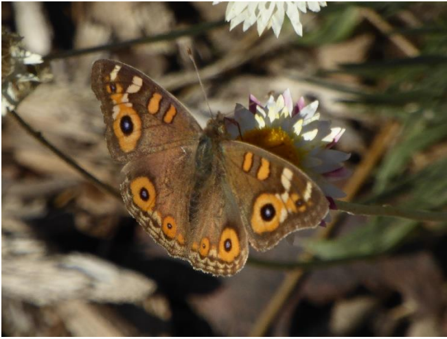
Junonia villida , Meadow Argus Butterfly. Is found through Australia. Caterpillars are black and spikey