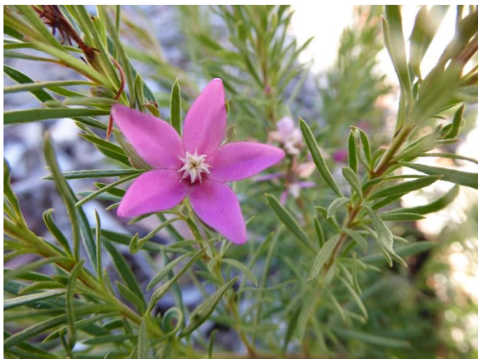
Crowea exalata Ginninderra Falls, Small Crowea. A long flowering local plant.