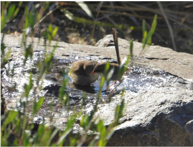
Malurus cyaneus , Female or juvenile Fairy Wrens enjoying the opportunity to bath in a rock depression.