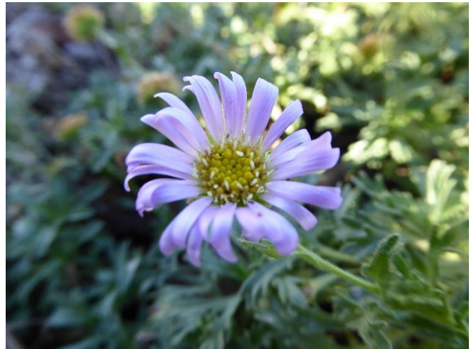
Calotis glandulosa , Mauve Burr-daisy. A perennial daisy with spiny seedheads. Endangered in the wild.

Our working bees are held every Thursday morning from 8am, please feel free to join our friendly group at whatever time you able to. We break for morning tea at 10 am at the table near our shed. An excellent morning tea is guaranteed.