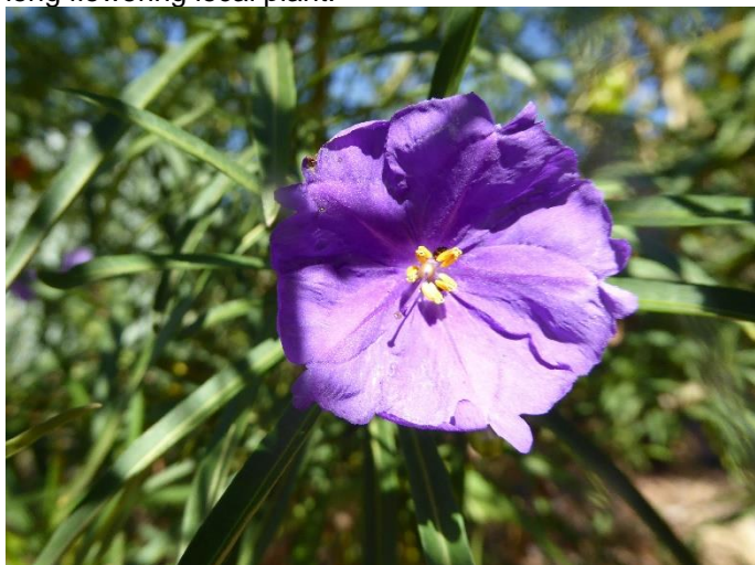
Solanum linearifolium , Mountain Kangaroo Apple. A tall long flowering woody shrub that readily reseeds.