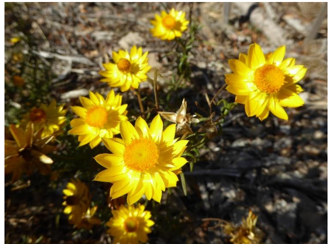
Xerochrysum viscosum , Sticky Everlasting. A hardy and common local everlasting daisy.