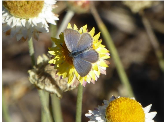
Zizina otis , Common Grass Blue (Butterfly). A common and widespread species across the ACT.