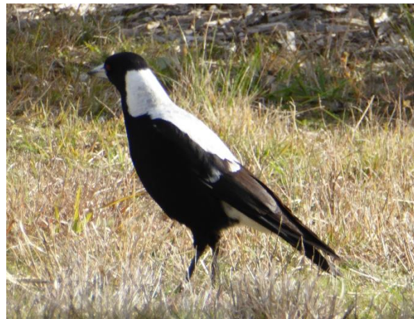
Cracticus tibicen , Australian Magpie