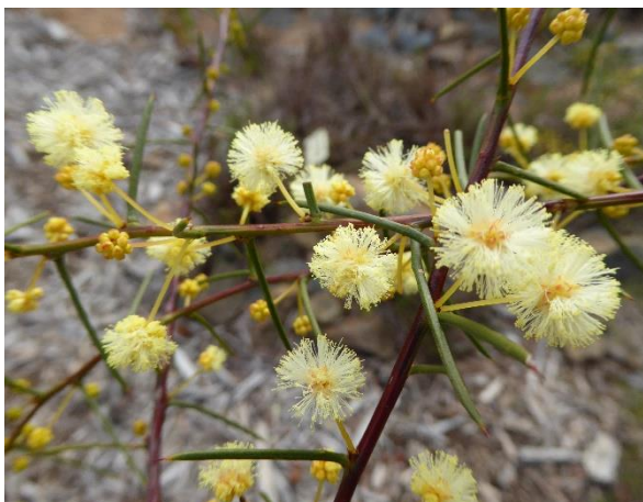
Acacia genistifolia , Early Wattle