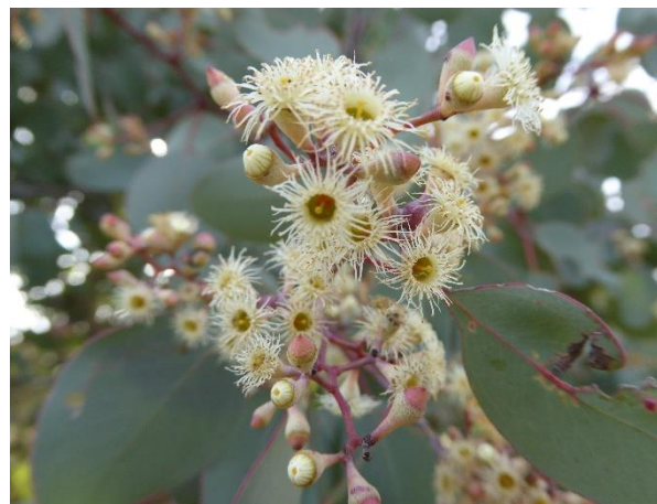
Eucalyptus polyanthemos , Red Box