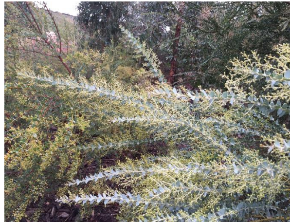
Acacia buxifolia and A. cultriformis