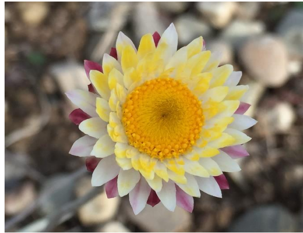
Leucochrysum albicans , magnified