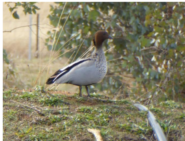
Chenonetta jubata , Australian Wood duck