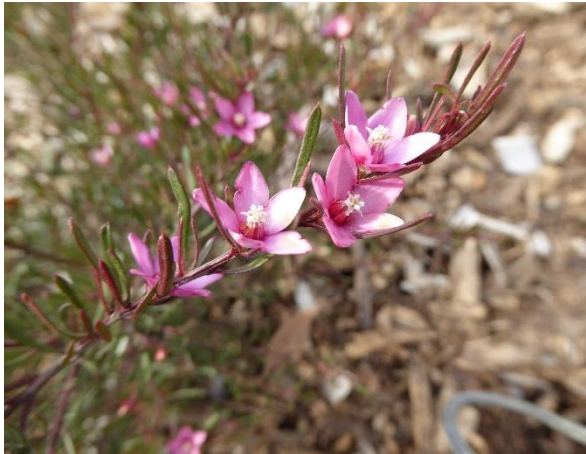
Crowea exalata "Ginninderra Falls"