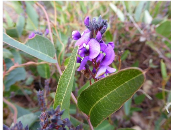
Hardenbergia violacea ,