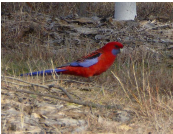
Platycercus elegans , Crimson Rosella