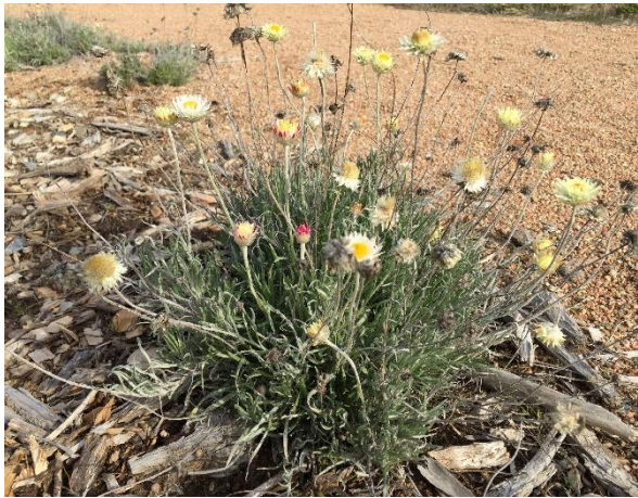
Leucochrysum albicans , Hoary Sunray