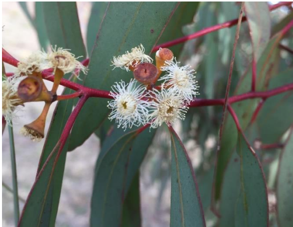
Eucalyptus rossii , Inland Scribbly Gum