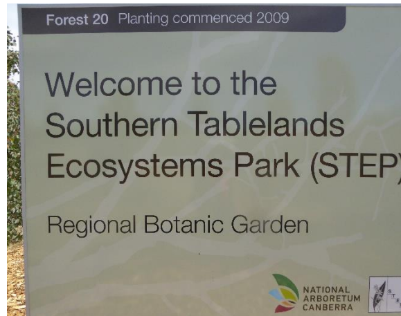
New welcome to STEP Forest 20 signs

Our working bees are held each Thursday morning from 8am, please join our friendly group at whatever time suits you. A generous morning tea is provided at 10am at the tables near our shed.