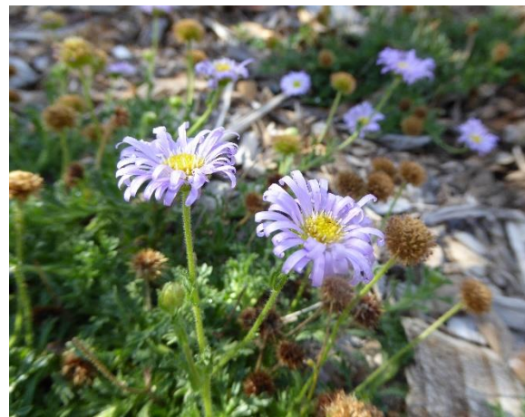
Calotis glandulosa , Mauve burr-daisy