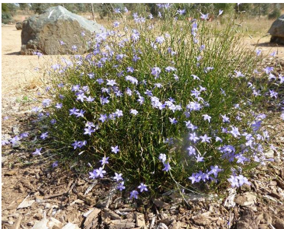
Wahlenbergia communis , Tufted bluebell