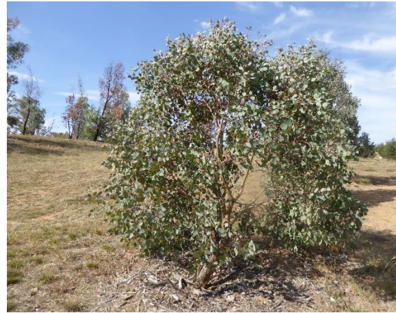
The particular tree that is flowering