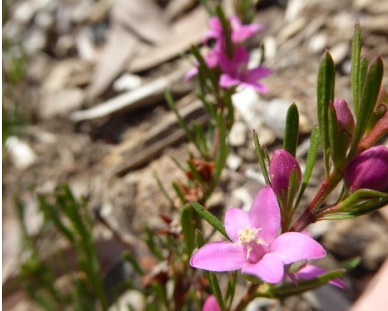
Crowea exalata "Ginninderra Falls"

Of Interest at Forest 20 National Arboretum Canberra May 2016