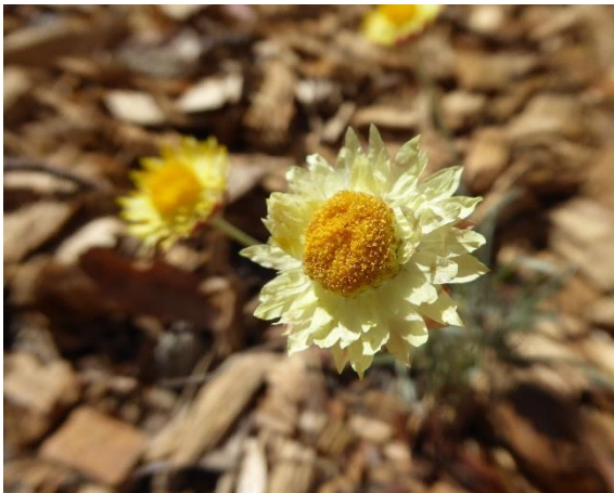
Leucochrysum albicans , Hoary sunray