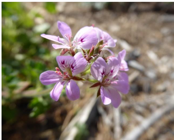
Pelargonium australe , Native storksbill