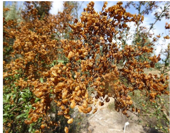
Bursaria spinosa seed cases, the seeds have dispersed