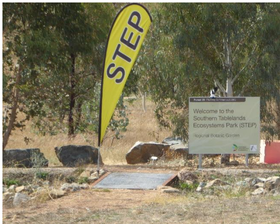
New STEP banner at Forest 20