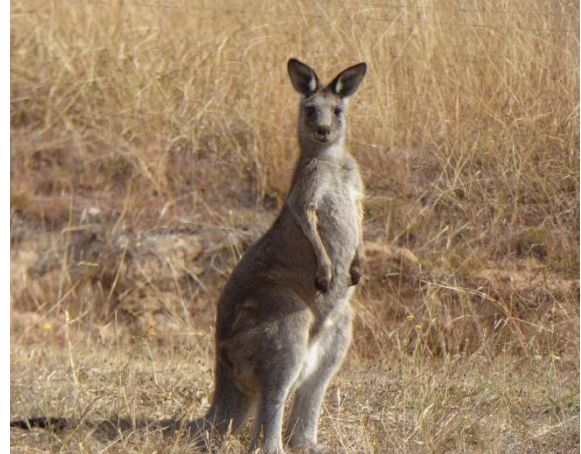
One of our visitors, Eastern Grey Kangaroo