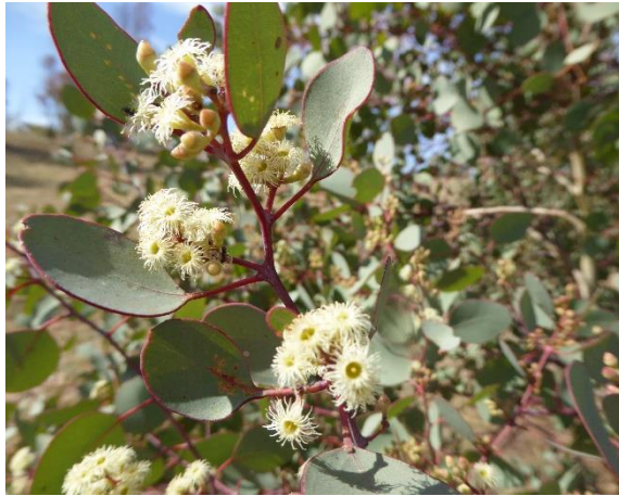
Eucalyptus polyanthemos , Red Box