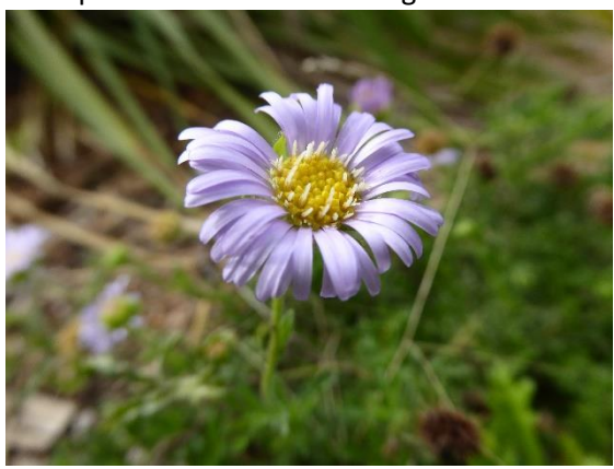
Calotis glandulosa, Mauve Bur-daisy. A perennial daisy with spiny seed heads.