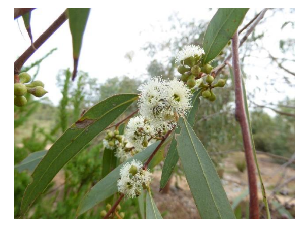
Eucalyptus macrorhyncha, Red Stringybark. This species has been flowering for months