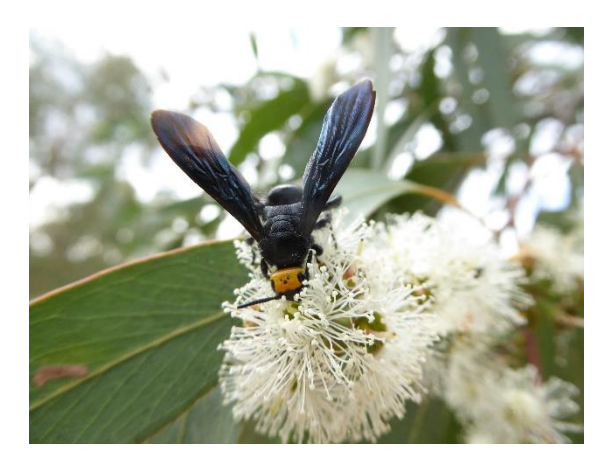
Scolia verticalis, Yellow Headed Hairy Flower Wasp on E macrorhyncha the Red Stringybark