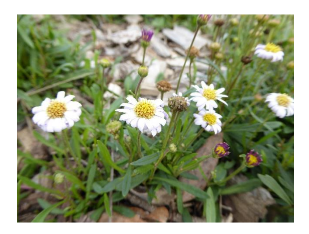
Brachyscome graminea, Grass Daisy. A hardy low growing summer flowering perennial.