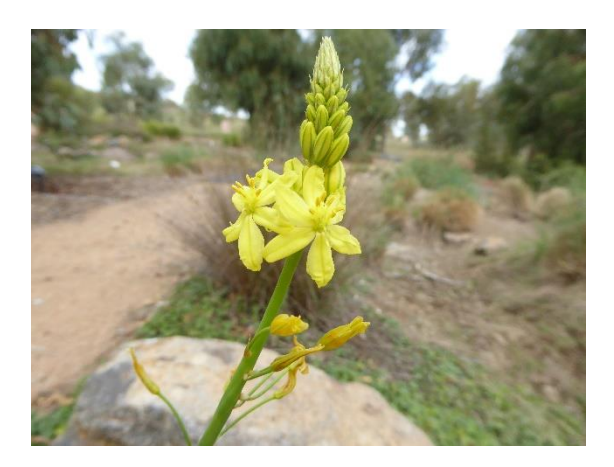
Bulbine glauca, Rock Lily A tufted perennial herb.