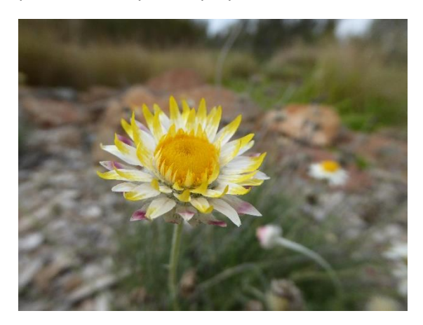
Leucochrysum albicans, Hoary Sunray. A long flowering member of the daisy family.