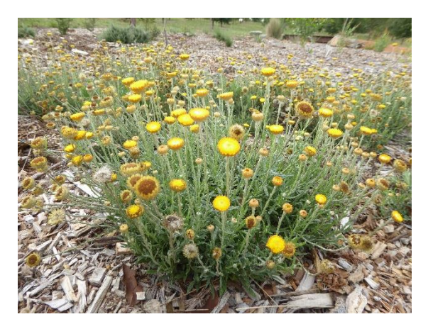
Coronidium gunnianum, Pale Everlasting. A long flowering perennial daisy.

Our working bees are held each Thursday morning from 8am, please feel free to join our friendly group at whatever time you can. We break for morning tea at 10 am at the table near our shed. An excellent (though byo) morning tea is guaranteed.