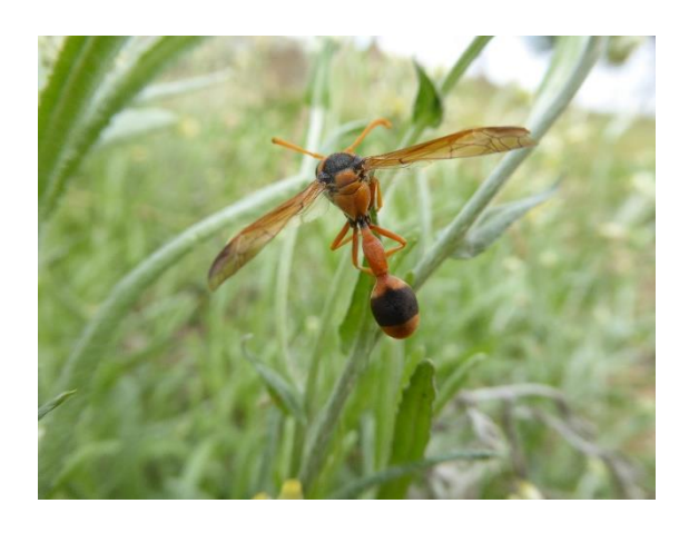
A potter Wasp on Helichrysum luteo-album . A volunteer of the daisy family.

Our working bees are held each Thursday morning from 8am, please feel free to join our friendly group at whatever time you can. We break for morning tea at 10 am at the table near our shed. An excellent (though byo) morning tea is guaranteed.