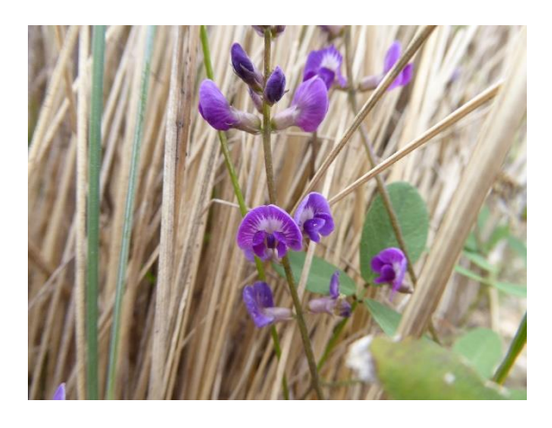
Glycine tabacina, Variable Glycine. A scrambling forb of the pea family(Fabaceae)