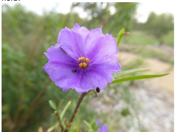
Solanum linearifolium, Mountain Kangaroo Apple. A long flowering tall woody shrub.