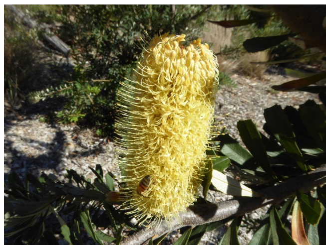
Banksia marginata , Silver Banksia. A hardy species that may be tree to 12 m or shrub due to location.