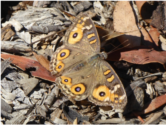
Junonia villida , Meadow Argus Butterflies. Found throughout Australia. Caterpillars are black and spiky.