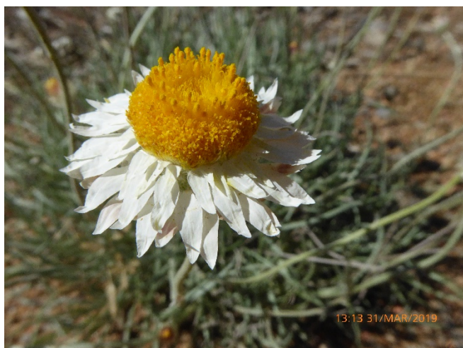
Leucochrysum albicans , Hoary Sunray. Long-flowering local daisy. Grows well on gravel.