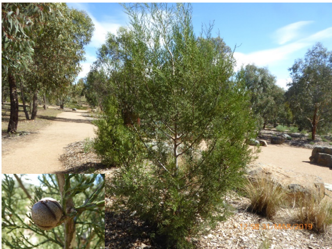
Callitris endlicheri , Black Cypress Pine. A native Australian conifer found from Queensland to Victoria.

Working bees are held every Thursday morning from 8am, feel free to join our friendly group at whatever time you are able. We break for morning tea at 10 am at the table near our shed. An excellent BYO morning tea is guaranteed. Park on grassy overflow section.