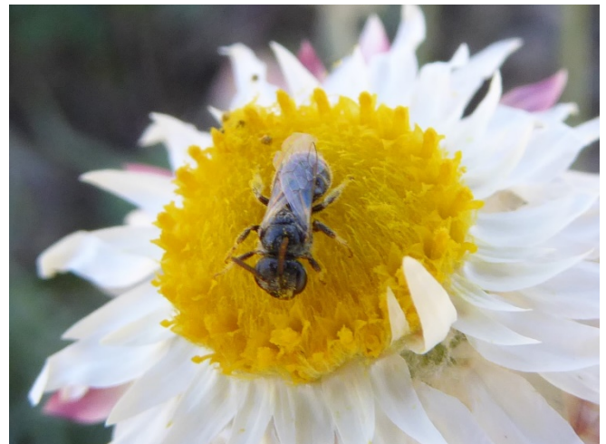
Lasioglossum species Bee on Leucochrysum albicans . This bee nests in the ground. They are useful pollinators.

Working bees are held every Thursday morning from 8am, feel free to join our friendly group at whatever time you are able. We break for morning tea at 10 am at the table near our shed. An excellent BYO morning tea is guaranteed. Park on grassy overflow section.