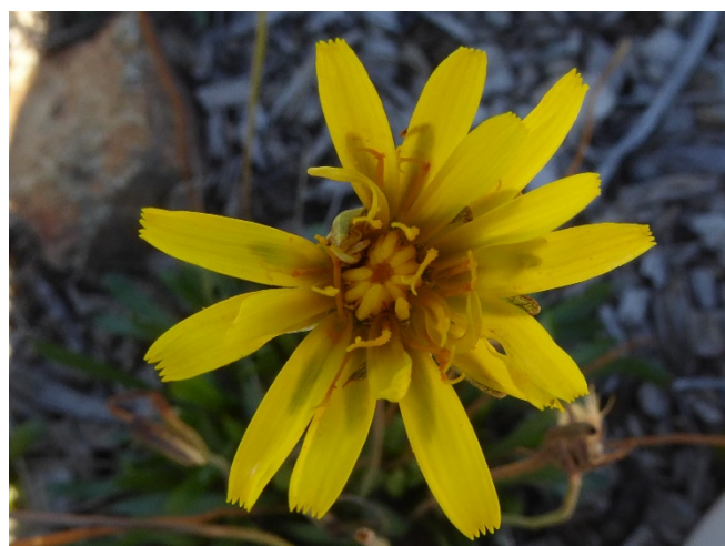
Microseris walteri , Murnong. A perennial herb used as a food source by indigenous communities.