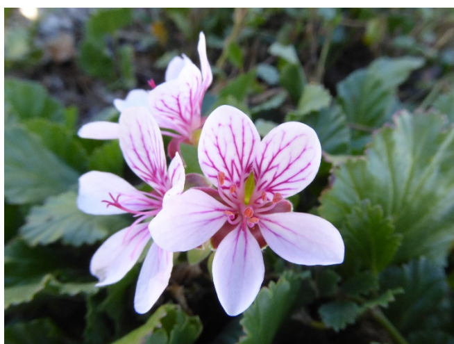
Pelargonium australe , Native Pelargonium. A particularly long flowering species.