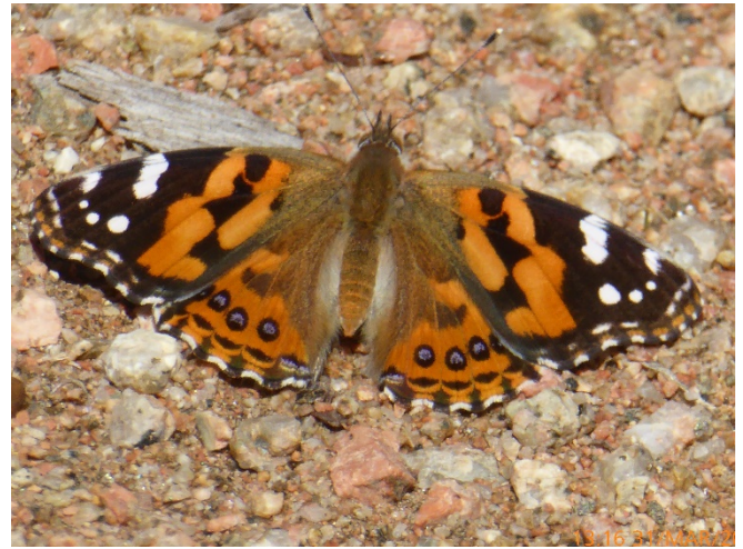
Vanessa kershawi , Australian Painted Lady. Best known for feeding on daisies, natives or exotics.