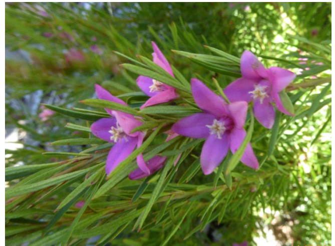
Crowea exalata Ginninderra Falls, Little Crowea. A long flowering local species.