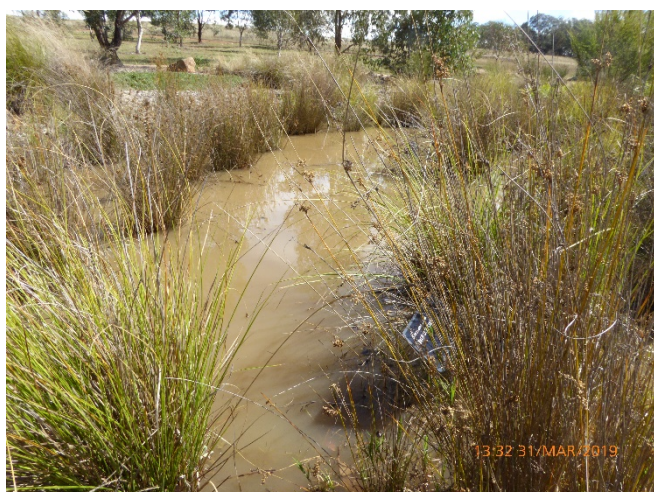
Ephemeral pond at capacity after recent good rain. The call of frogs heard while taking this photo.