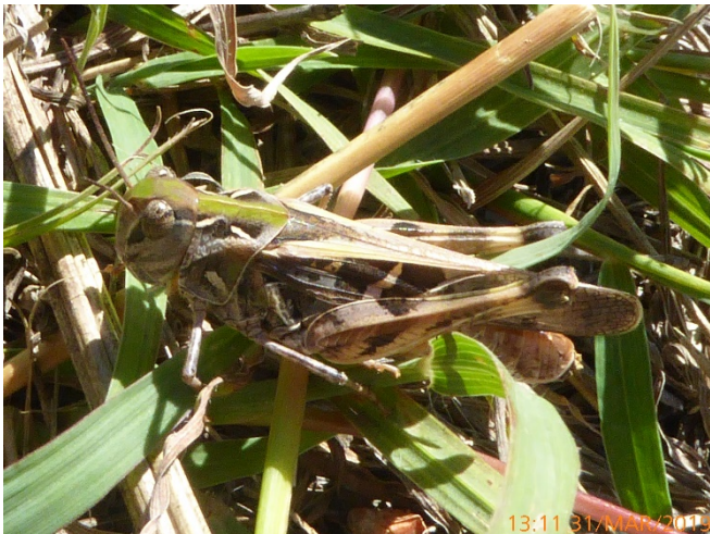
Gastrimargus musicus , Yellow-winged Locust. Widespread across Australia. Emits a clicking sound when flying.