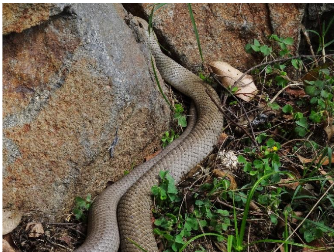
Pseudonaja textilis Eastern Brown Snake. This fellow has taken up residence in a rock wall near our shed.