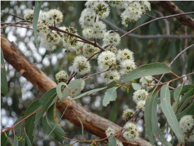
Eucalyptus macrorhyncha Red Stringybark. Our most numerous tree with several in flower at present.