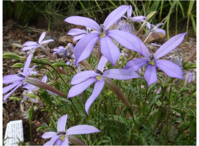
Isotoma axillaris Rock Isotome. Known to grow in damp rocky sites. The sap can cause irritation.