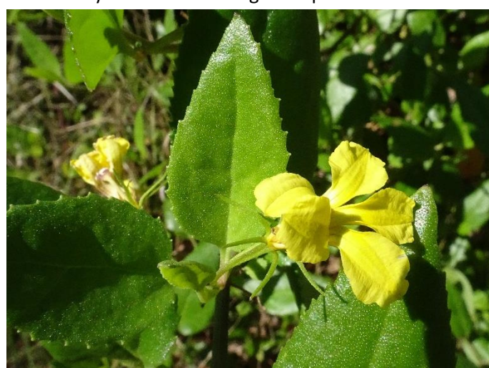
Goodenia ovata Hop Goodenia. A long flowering rounded shrub that responds to pruning.

There are still some sections of our paths are damaged so please take care when visiting. Our working bees are each Thursday morning from 8am. Morning tea (byo) is at 10am at the tables near the shed. Tools are supplied. New volunteers are welcome, just turn up and make yourself known.