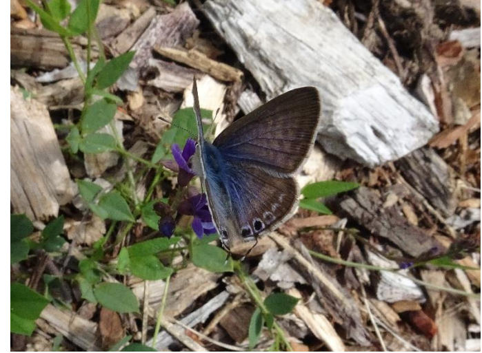
Zizina otis Common Grass-blue feeding on Glycine tabacina flowers.