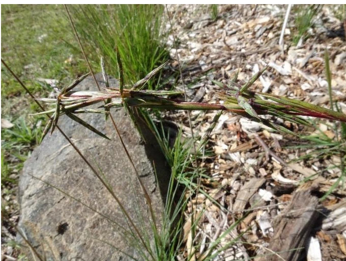
Cymbopogon refractus Barbed Wire Grass. Found in the eastern states and the Northern Territory.