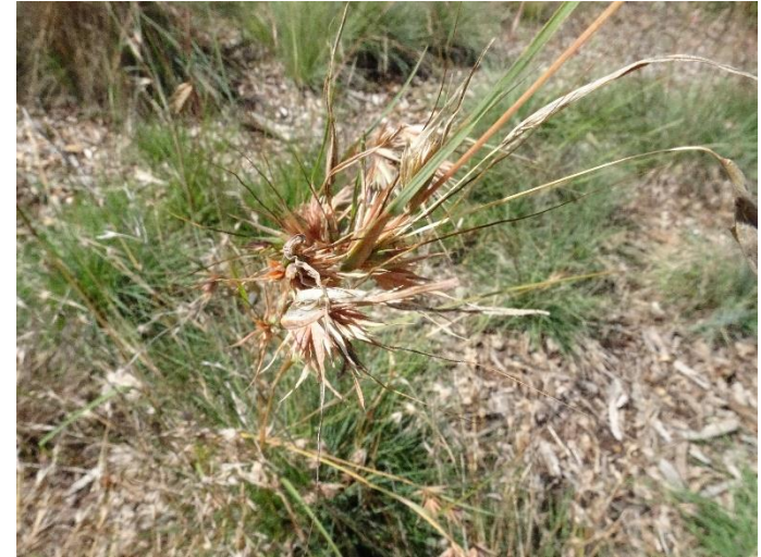
Themeda triandra Kangaroo Grass. A hardy local perennial grass we have growing in several locations.