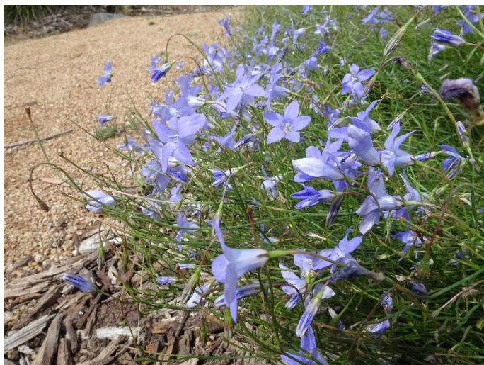
Wahlenbergia capillaris Tufted Bluebell. A perennial species with a thickened taproot.