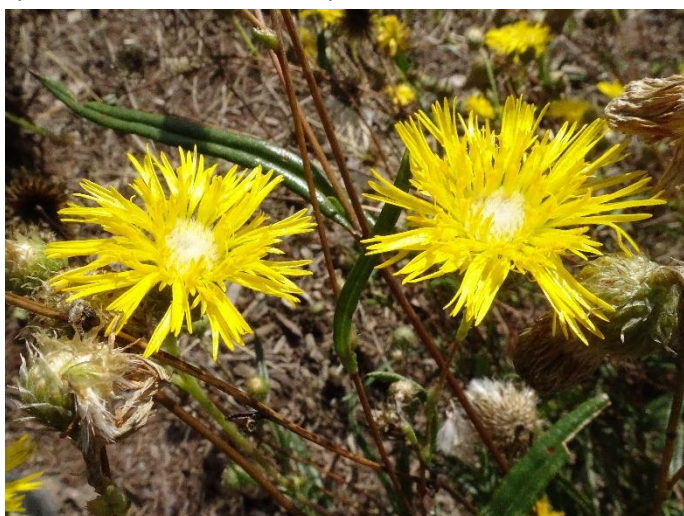
Podolepis jaceoides Showy Copper-wire Daisy. An attractive long flowering perennial daisy.