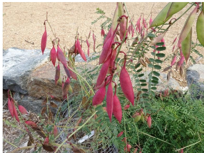
Swainsona galegifolia Smooth Darling Pea. Flowering for the last 2 months, now there are the seeds pods.