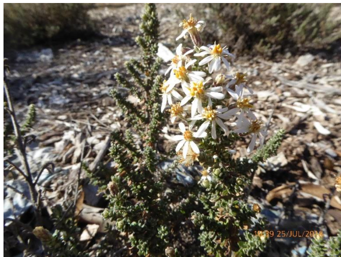
Olearia microphylla , Small-leaved Daisy-bush. An early flowering for this plant.