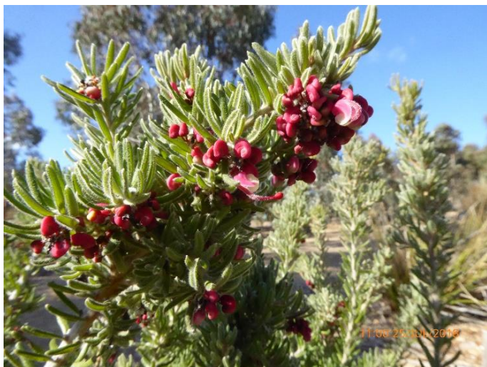
Grevillea lanigera , Woolly Grevillea. Named for its hairy branchlets and leaves. A woodland species.