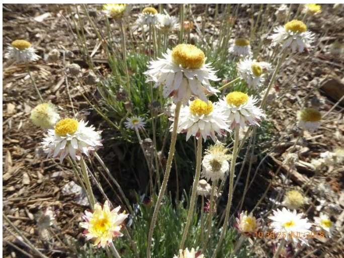
Leucochrysum albicans , Hoary Sunray. A long flowering local perennial daisy. Persists well in gravel.