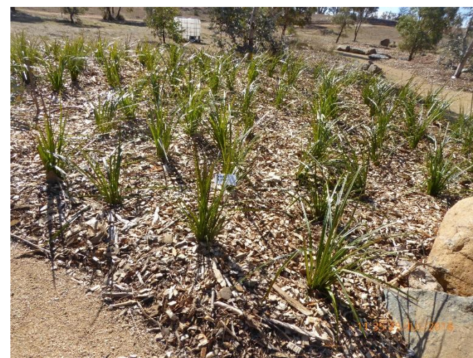
Dianella longifolia , Pale Flax-lily. Planted in the new Bush Tucker Garden, these are looking well despite the dry conditions.