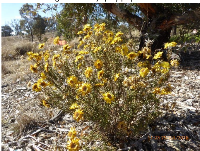
Xerochrysum viscosum , Sticky Everlasting. A hardy perennial daisy now looking like a dried arrangement.

Our working bees are held every Thursday morning from 8am, please feel free to join our friendly group at whatever time you are able to. We break for morning tea at 10 am at the table near our shed. An excellent morning tea is guaranteed. Park on lower section of overflow carpark where you will see a line of vehicles.