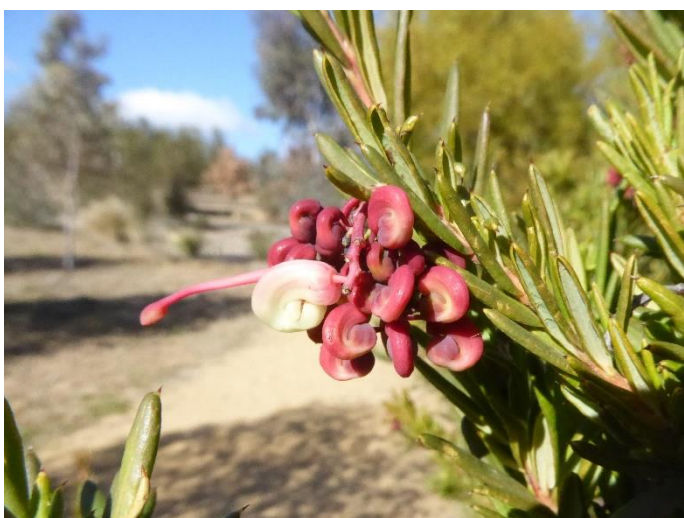
Grevillea iaspicula , Wee Jasper Grevillea. A tall shrub that is endangered in its natural setting.