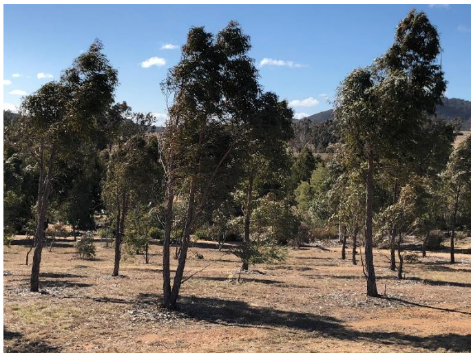
Various eucalypt species. The whole site is looking very dry.