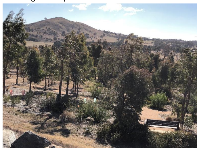
Another general view of Forest 20. Some understory in the foreground, looking towards Mount Painter.