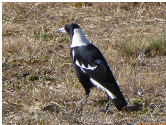
Cracticus tibicens , Australian Magpie. Resident at Forest 20, the Black-backed race of the Magpie.