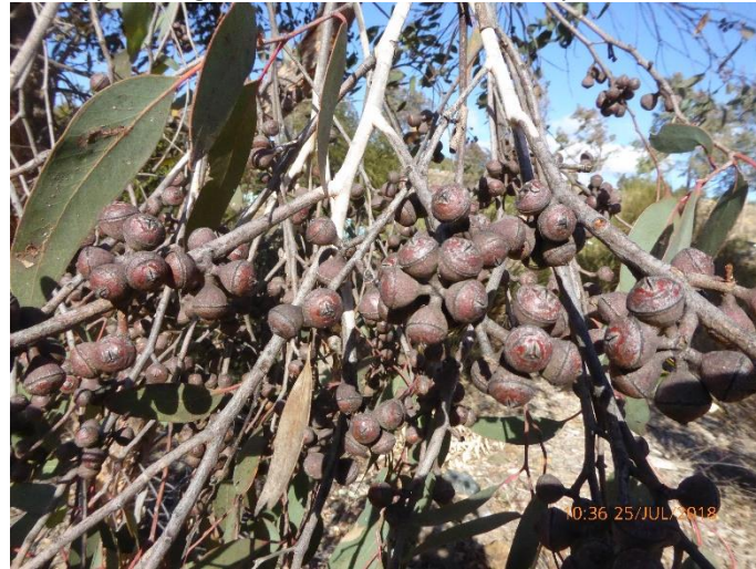
Eucalyptus macrorhyncha , Red Stringybark. Shows a heavy load of fruit developed from strong flowering.