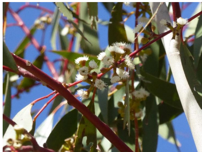
Eucalyptus pauciflora , Snow Gum. A smooth barked eucalypt that grows in frost hollows locally.

Our working bees are held every Thursday morning from 8am, please feel free to join our friendly group at whatever time you are able to. We break for morning tea at 10 am at the table near our shed. An excellent morning tea is guaranteed. Park on lower section of overflow carpark where you will see a line of vehicles.