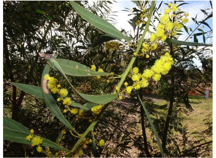
Acacia rubida Red-stemmed Wattle. Another taller species flowering on the Wattle Walk.