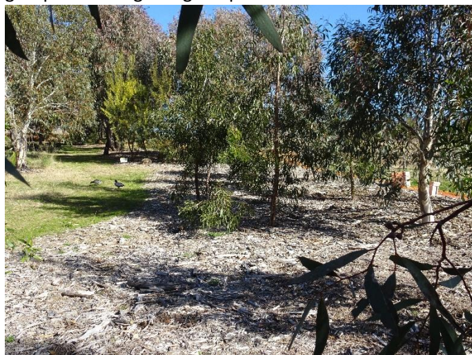
A view of the Wattle Walk with the mown path on the left and a pair of Wood Duck.

While Forest 20 has been closed to visitors due to water damage to our path system, our working bees are continuing each Thursday morning. Morning tea (byo) is at 10am at the tables near the shed