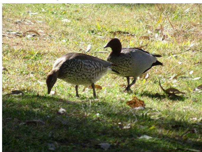
A pair of Wood Duck, Chenonetta jubata , part of a group that was grazing the path of the Wattle Walk.