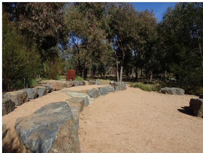
The Clearing , A meeting place for events. There was no water damage in this section of Forest 20.