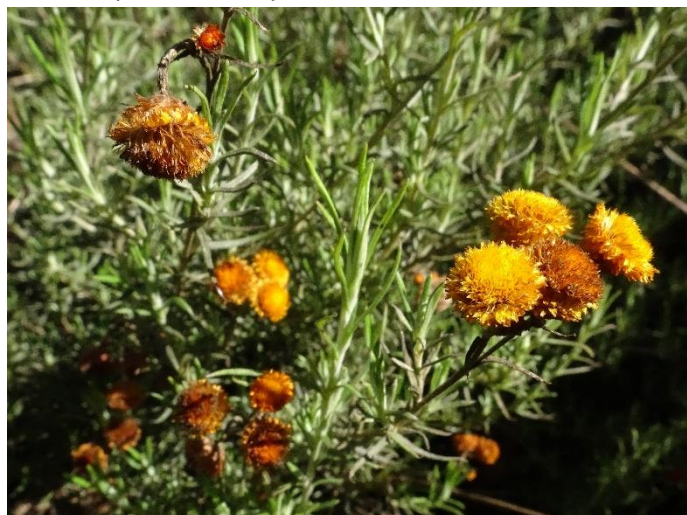
Chrysocephalum semipapposum Clustered Everlasting. Not looking its best but is it early or late flowering?