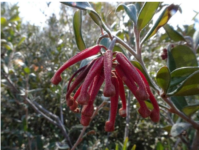
Grevillea victoriae subsp. nirvalis Royal Grevillea. Perhaps the same species as shown on the right.