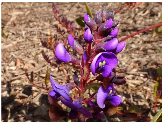
Hardenbergia violacea False Sarsaparilla. Flowering in sheltered places but is yet to reach its best.