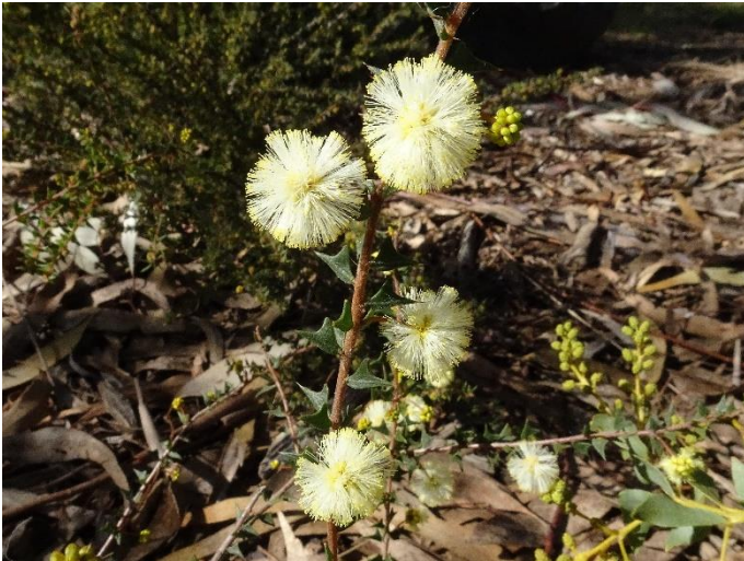
Acacia gunnii Ploughshare Wattle. This low growing species features on the Wattle Walk