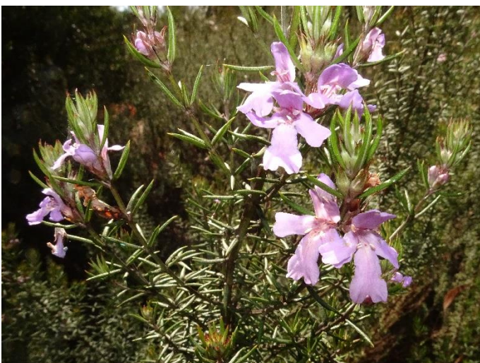
Westringia eremicola Slender Westringia. This medium sized shrub has flowered since March