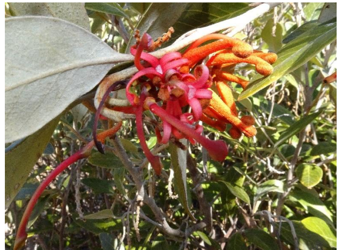
Grevillea victoriae subspecies nirvalis . This subspecies is known from the Kosciusko region.