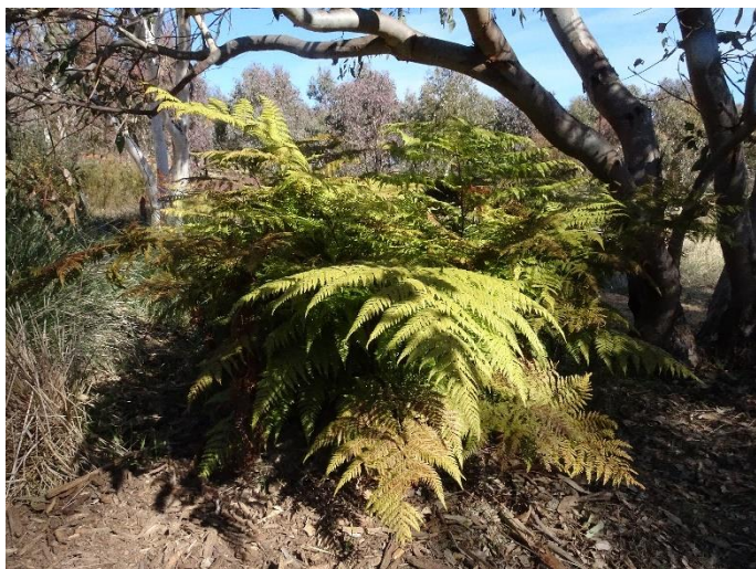
Pteridium esculentum Bracken Fern. A species of open forest and cleared land, where it is considered a pest.