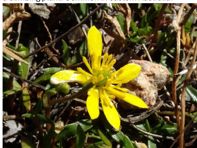
Ranunculus papulentus . Large River Buttercup. Less flowers now due to winter conditions. Spreads by rhizomes.

Our working bees are held each Thursday morning from 8-30am. Morning tea (byo) is at 10am at the tables near the shed. Tools are supplied. New volunteers are welcome, park near the Forest 20 entrance, just turn up and make yourself known.