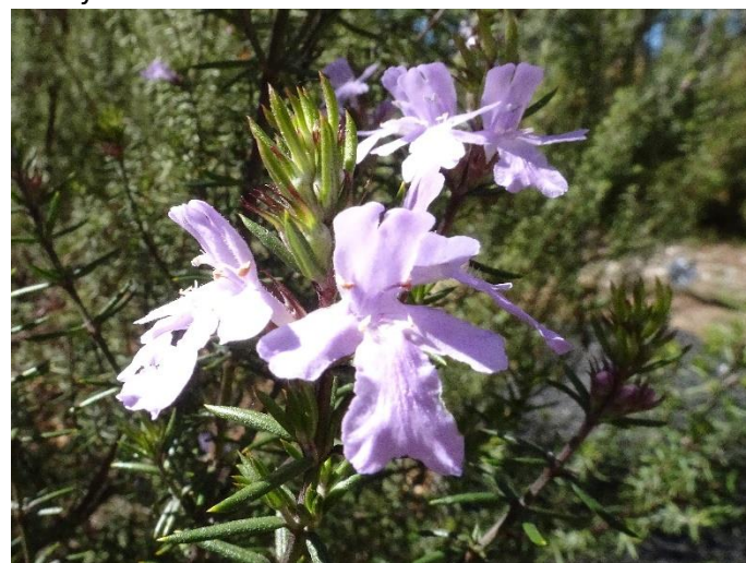
Westringia eremicola Slender Westringia. An exceptionally long flowering shrub.