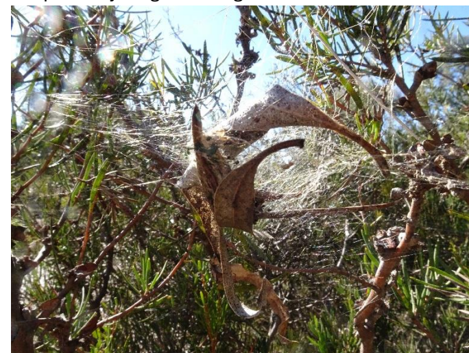
Web and home of the Leaf Curl Spider. May be Phonognatha graeffei .