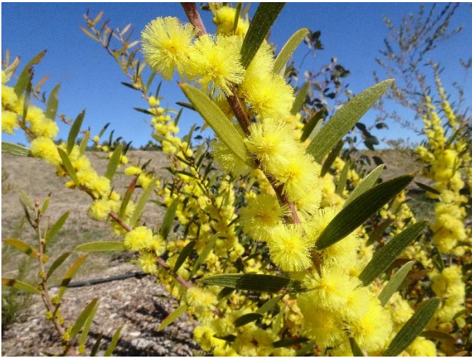
Acacia lanigera Woolly Wattle. Our first acacia to flower this Season. It is close to our entrance.

Of Interest at Forest 20, August 2024 Number 111