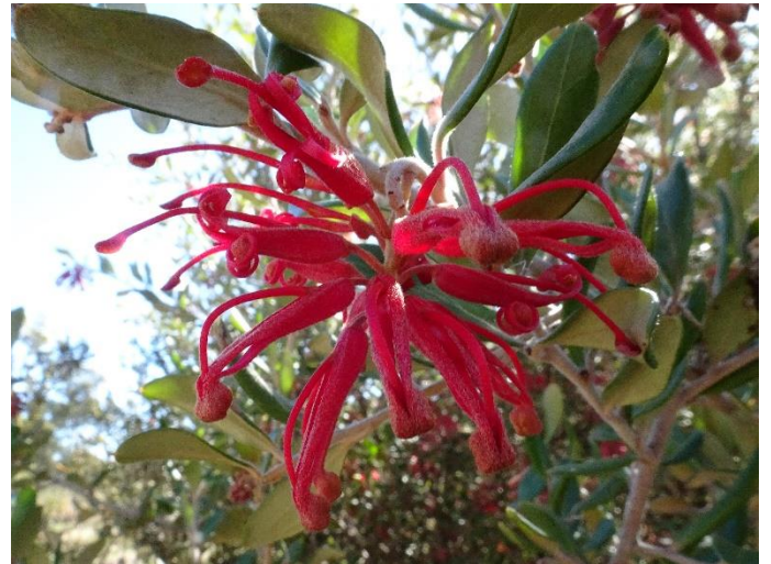
Grevillea victoriae subsp. nivalis Mountain Grevillea. Found south of the ACT