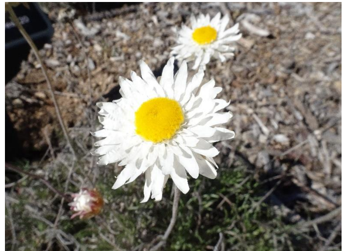
Leucochrysum albicans Hoary Sunray. Long flowering local daisy which likes good drainage.