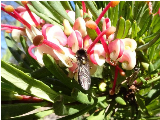
Grevillea iaspicula Wee Jasper Grevillea with Melangyna viridiceps Common Hoverfly.