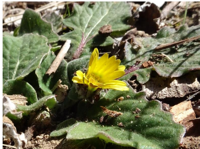
Cymbonotus lawsonianus Bears Ears. A prostrate perennial herb with noticeably hairy leaves.