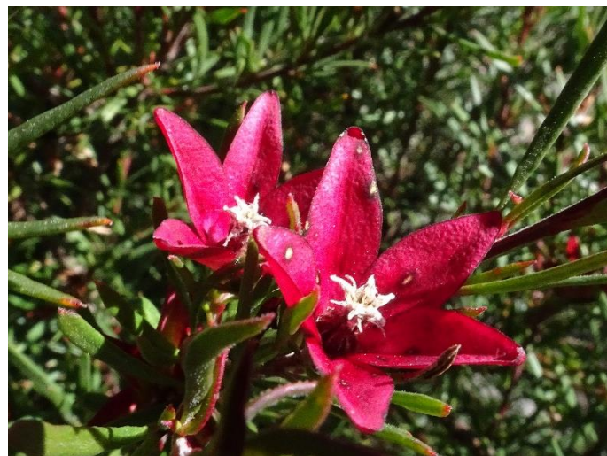
Crowea exalata Ginninderra Falls. A most attractive long flowering local species.