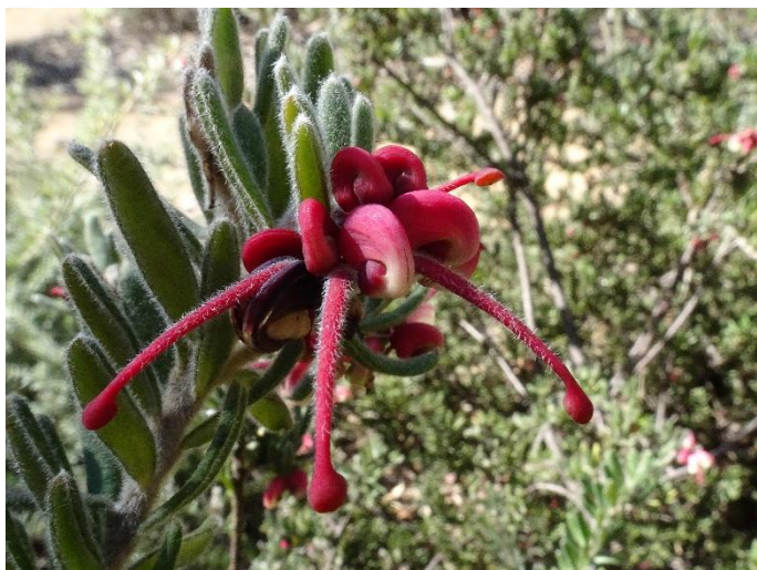
Grevillea lanigera Woolly Grevillea. Named for its woolly leaves and branchlets.