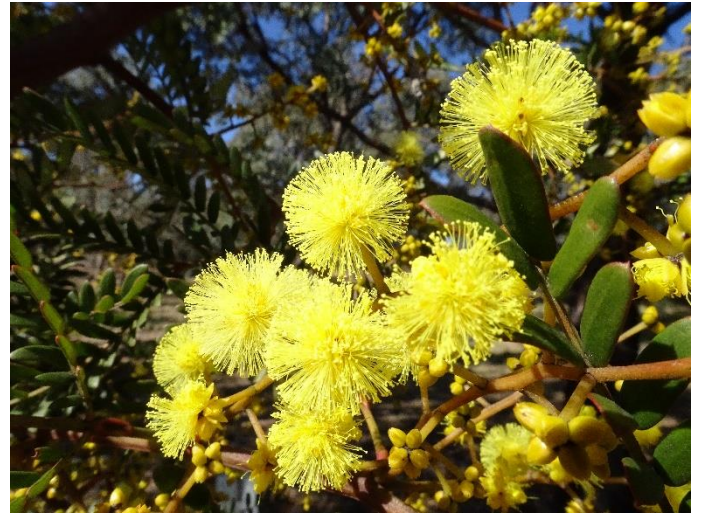
Acacia terminalis Sunshine Wattle. This attractive wattle is just starting to flower on our Wattle Walk.