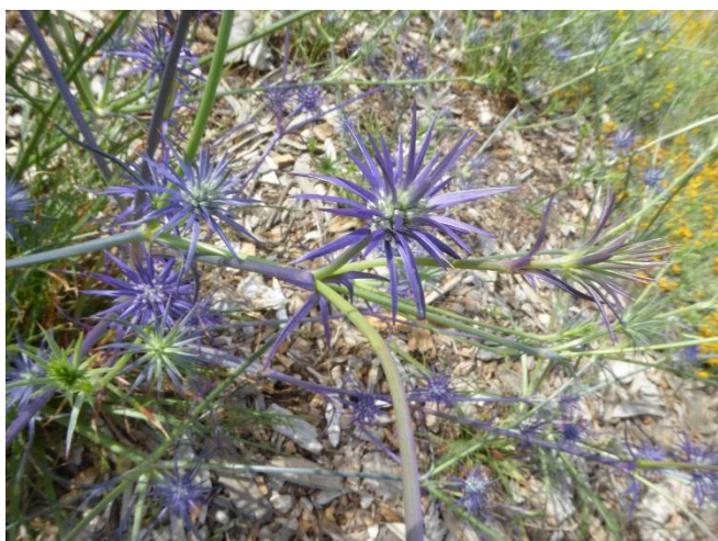
Eryngium ovinum , Blue Devil. A perennial herb with a thistle like heads. It regrows from the base each year.