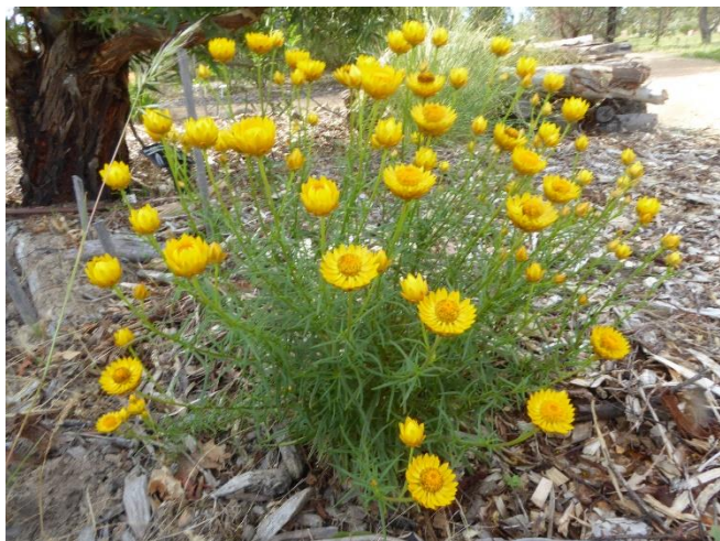
Xerochrysum viscosum , Sticky Everlasting. A hardy local everlasting daisy.