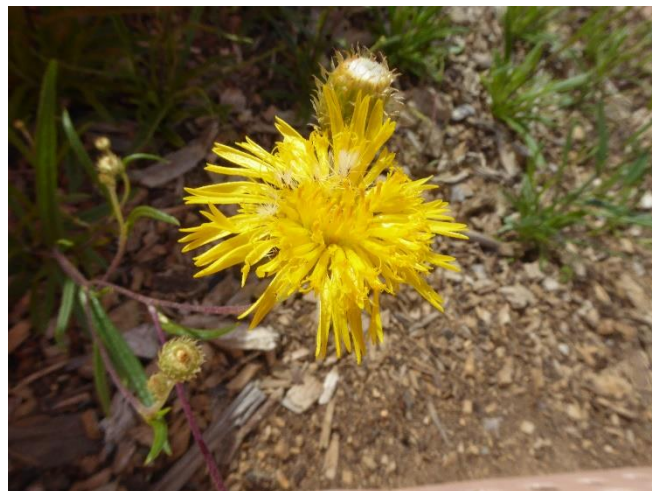
Podolepis jaceoides , Showy Copper Wire Daisy. Rising from the rootstock annually, an attractive daisy.