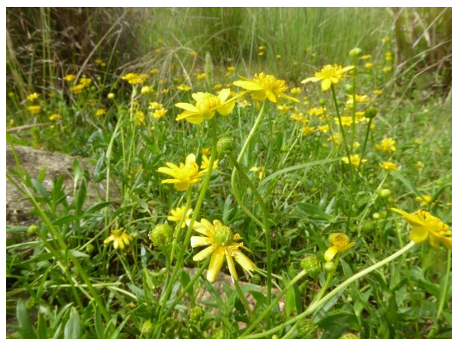
Ranunculus papulentus , Large River Buttercup. This is growing on the edge of the ephemeral pond.