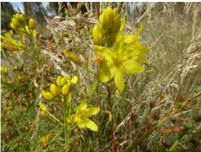
Bulbine glauca , Rock Lily. A tufted herb that holds its flowers for long periods.