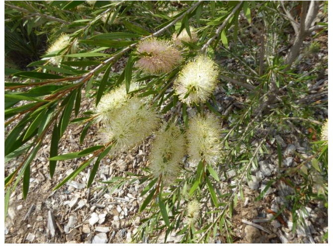
Callistemon sieberi , River Callistemon. This shrub has cream to pink flowers in spring and autumn.