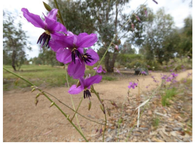
Arthropodium fimbriatum , Chocolate Lily. An erect perennial herb that grows on a variety of soils.