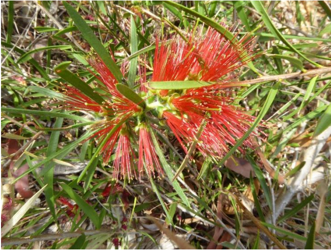
Callistemon subulatus , Dwarf Bottlebrush. A small open spreading shrub.