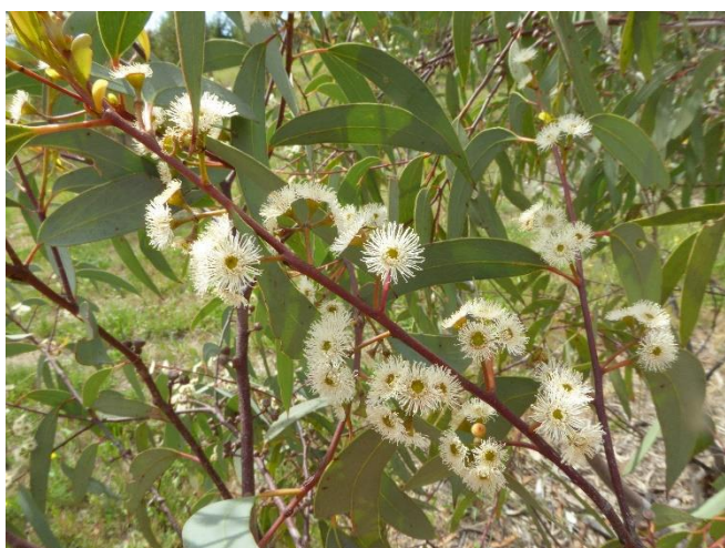
Eucalyptus rossii , Scribbly Gum. A hardy gum tree well known in the ACT for the insect scribbles on the bark.