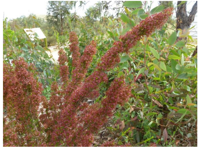
Calytrix tetragona , Common Fringe Myrtle. The red bracts remain after the flowers are shed.

Our working bees are held every Thursday morning from 8am, please feel free to join our friendly group at whatever time you are able to. We break for morning tea at 10 am at the table near our shed. An excellent morning tea is guaranteed.