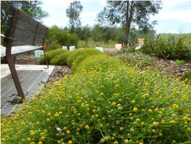
Calotis lappulacea , Yellow Burr-daisy. A dense low herb with spiny seed capsules.