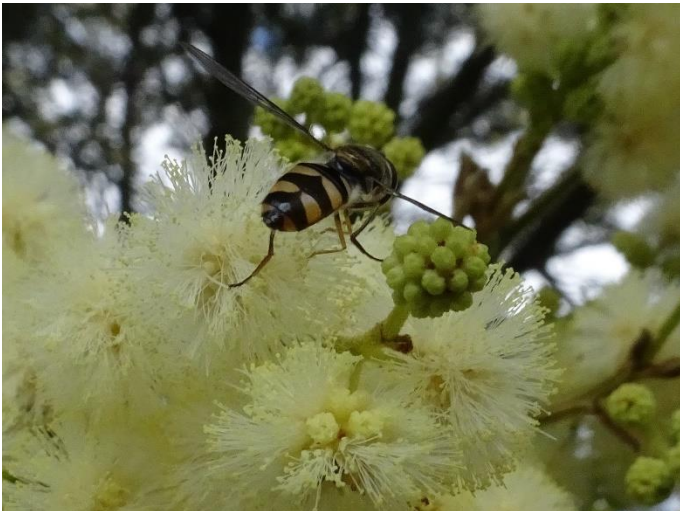
Acacia mearnsii , Late Black Wattle and Melangyna viridiceps Common Hoverfly. Fragrant pale-yellow blooms are a real standout at present.