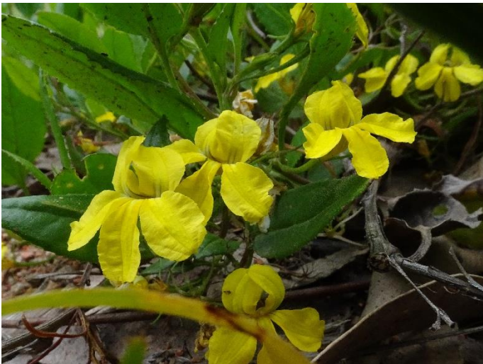
Goodenia ovata , Hop Goodenia. A sprawling shrub-groundcover. Has struggled when frosts were severe