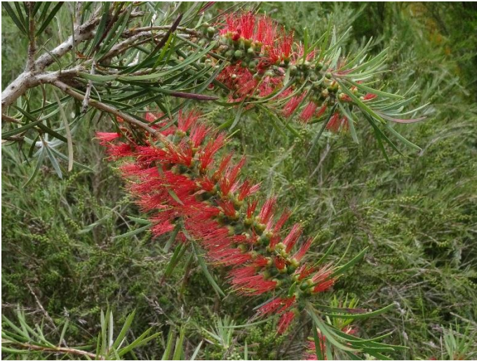
Callistemon subulatus , Dwarf Bottlebrush. An arching small to medium sized dense shrub with bright red brushes.