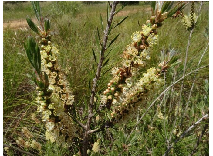
Callistemon pallidus , Lemon Bottlebrush. An upright medium sized shrub on the edge of the ephemeral wetland.