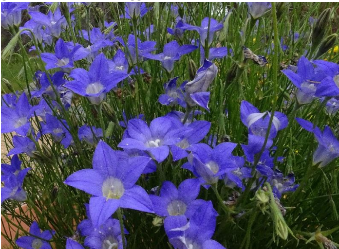
Wahlenbergia stricta , Tall Bluebell. A great display in the Kurrajong Rocks area.