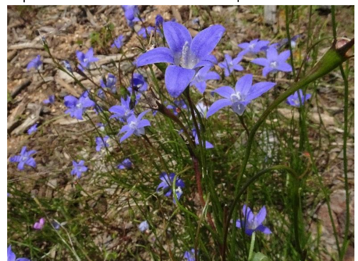
Wahlenbergia gracilis , Australian or Sprawling Bluebell. Often found in urban Canberra.

Our working bees are now back to full swing . Check in CBR is still required at our shed. A BYO morning tea is held at the tables near the shed. We have sufficient chairs to be able to space out. On a different note, please watch your step on our water damaged paths.