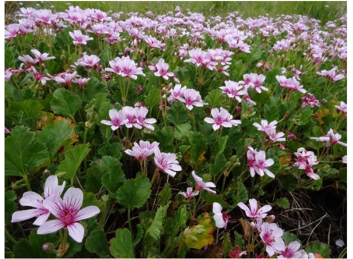
Pelargonium australe , Native Pelargonium. Best known of the seven Australian pelargonium species.