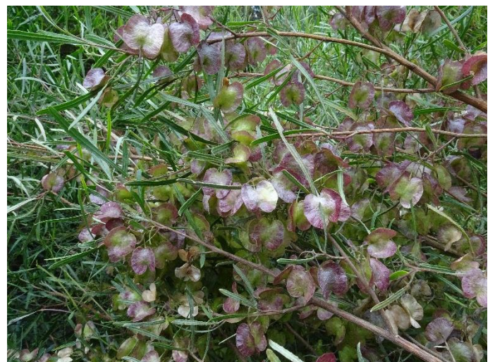
Dodoniaea viscosa ssp. angustissima , Narrow-leaved Hopbush. Male and female flowers on separate bushes