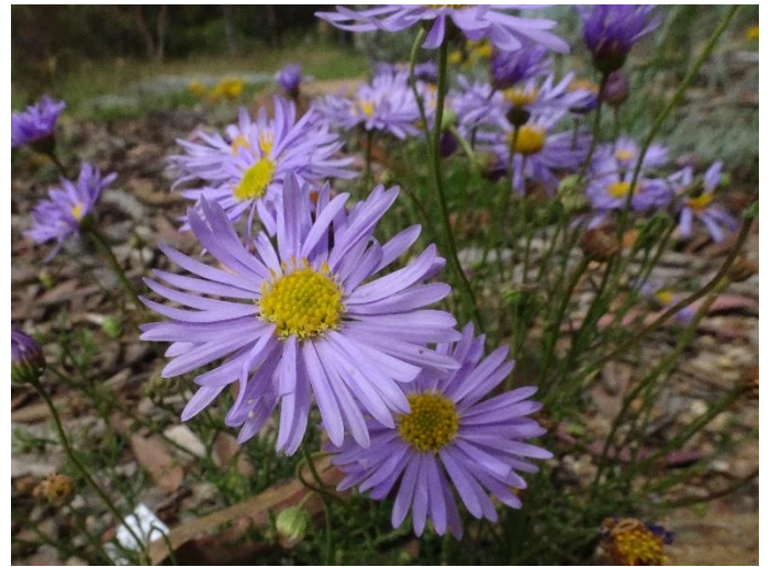
Brachyscome rigidula , Cut-leaf Daisy. A sprawling wiry perennial daisy with mauve flowers.