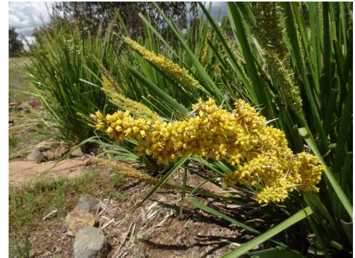
Lomandra longifolia , Spiney-headed Mat-rush. A rhizomatous herb which can grow into large clumps.