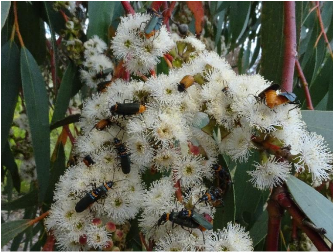
Eucalyptus pauciflora , Snow Gum, with Scarab and Soldier beetles.