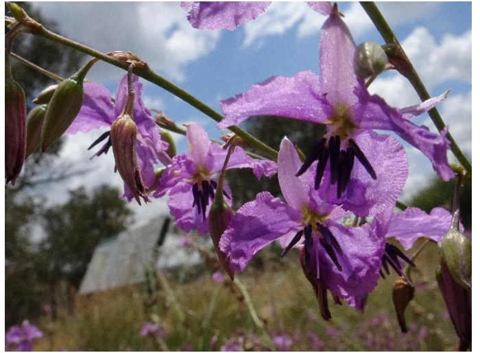
Arthropodium fimbriatum Chocolate Lily. Known for the chocolate fragrance of the flowers.