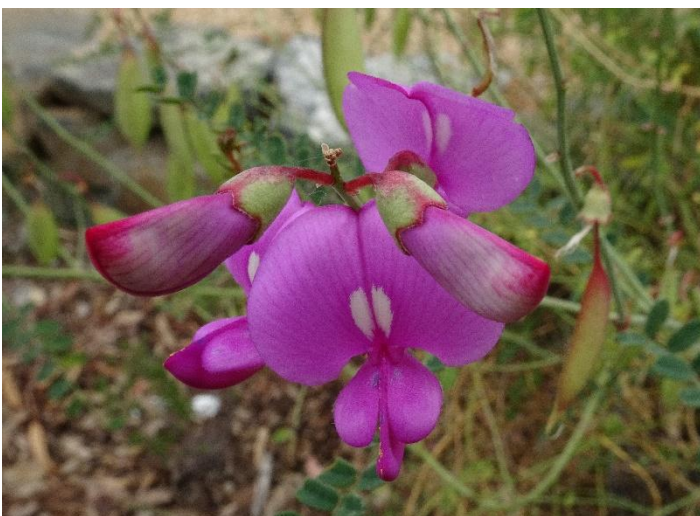
Swainsona galegifolia Smooth Darling Pea. A very long flowering attractive pea.