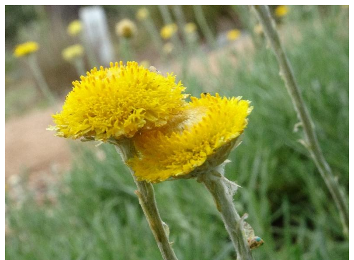
Leptorhynchos squamatus Scaly Buttons. A larger button than usual and may be a Coronidium sp!