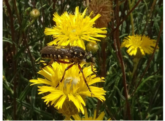
Podolepis jaceoides Showy Copper-wire Daisy with Thereutria amaraca Spine-legged Robber Fly.