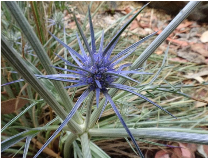
Eryngium ovinum Blue Devil. A perennial herb which renews from the base each year.