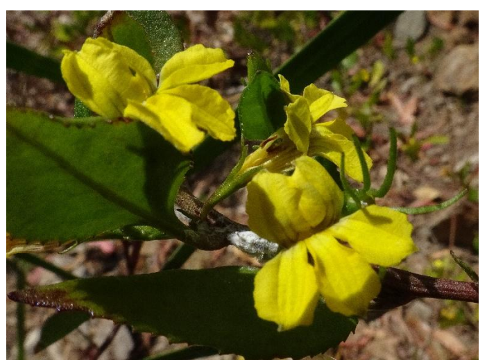
Goodenia ovata Hop Goodenia. A long flowering shrub that responds to pruning after flowering.

Our working bees are held every Thursday from 8-30am. Morning tea (byo) is at 10am at the tables near the shed. Tools are supplied. New volunteers are welcome, park near the Forest 20 entrance, just turn up and make yourself known.