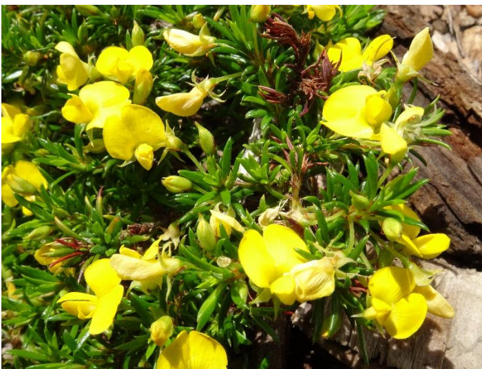
Pultenaea pedunculata Matted Bush-pea. A rare and endangered species. May cover several metres.