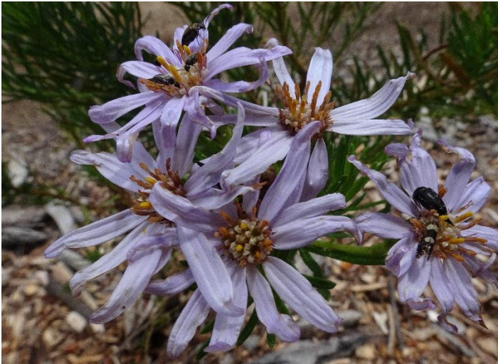
Olearia microphylla Twiggy Daisy Bush With small Pintail beetles Mordellae family and a Sedge moth.