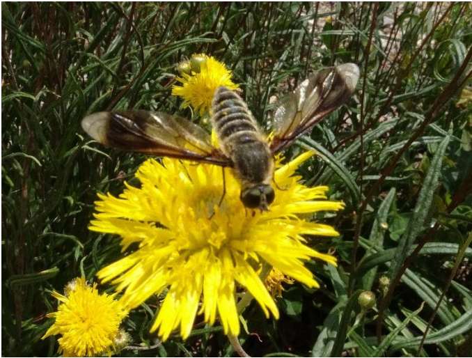
Podolepis jaceoides Showy Copper-wire Daisy with Comptosia quadripennis a Bee Fly.