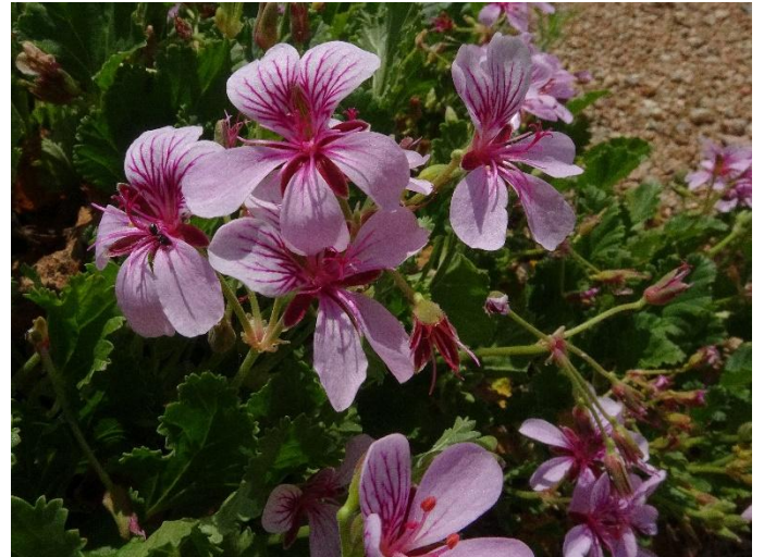
Pelargonium sp. Striatellum Omeo Storksbill. A yet to be formally named endangered species.