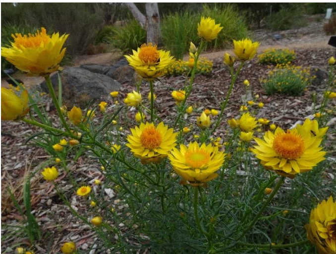
Xerochrysum viscosum Sticky Everlasting. A perennial local daisy. Cut old growth back as new growth comes in spring