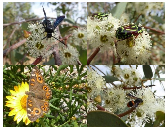
From top left, a Hairy Flower Wasp, right a Fiddler Beetle, below Meadow Argus Butterfly, bottom right a yet to be identified wasp.

Our working bees are held each Thursday morning from 8am, please feel free to join our friendly group at whatever time you can. We break for morning tea at 10 am at the table near our shed. An excellent (byo) morning tea is guaranteed.