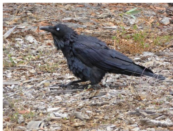
Corvus coronoides , Australian Raven, a regular visitor.