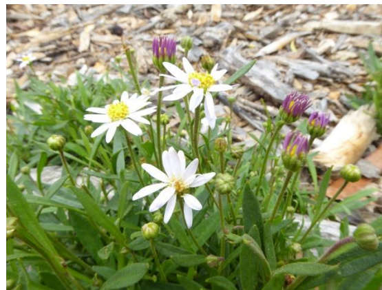
Brachyscome graminea , Grass Daisy. Another perennial daisy.