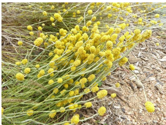
Calocephalus citreus , Lemon Beauty-heads. Another perennial daisy.