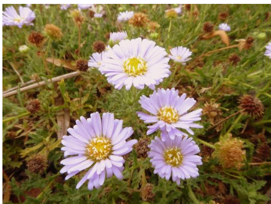
Calotis glandulosa , Mauve Burr-daisy. A perennial daisy with spiny seed head.