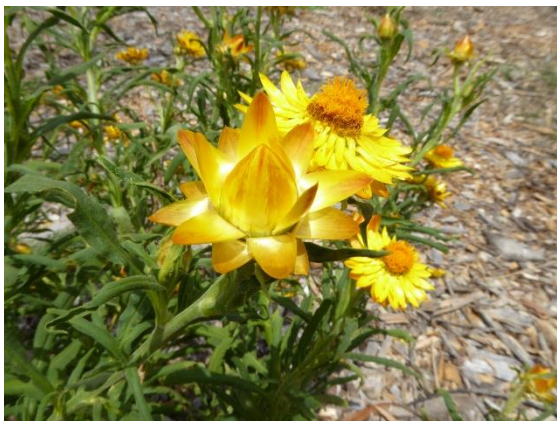
Xerochrysum bracteatum , Golden Everlasting, A stunning though short-lived daisy.

Our working bees are held each Thursday morning from 8am, please feel free to join our friendly group at whatever time you can. We break for morning tea at 10 am at the table near our shed. An excellent (byo) morning tea is guaranteed.