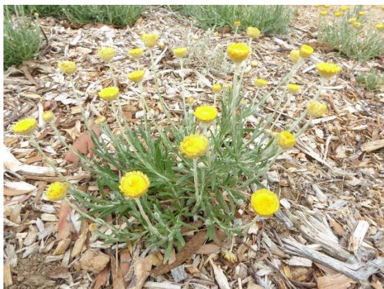
Coronidium gunnianum , Pale Everlasting. A hardy long flowering daisy.