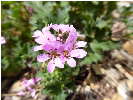
Pelargonium australe , Austral Storks-bill, a small herbaceous plant of the Geraniaceae family.