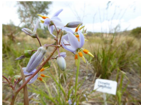
Dianella longifolia , Smooth Flax Lily, a perennial tufted herb.