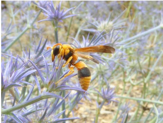
Eryngium ovinum , Blue devil with what may be a potter wasp (yet to be identified).