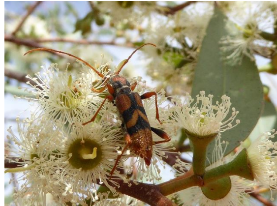
Eucalyptus macrorhyncha , Red Stringybark with Aridaeus thoracicus the Longicorn Beetle