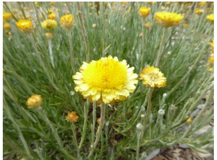
Coronidium gunnianum , Pale Everlasting. A hardy long flowering daisy. Used to be known as Helichrysum rutidolepis .

Our working bees are held every Thursday morning from 8am, please feel free to join our friendly group at whatever time you able to. We break for morning tea at 10 am at the table near our shed. An excellent morning tea is guaranteed.