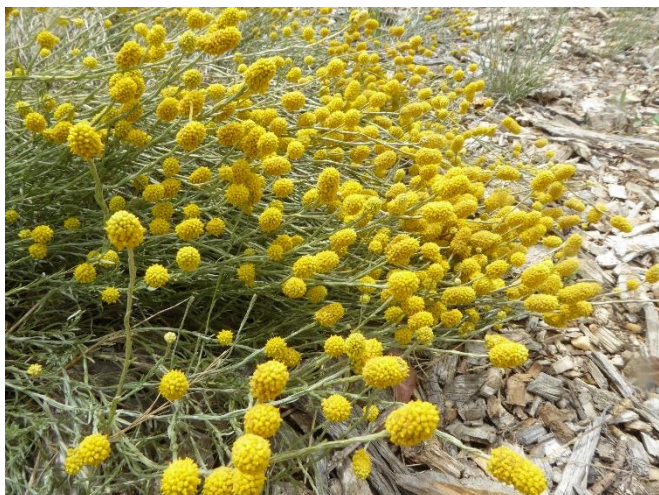
Calocephalus citreus , Lemon Beauty-heads. A low perennial daisy with silvery foliage.