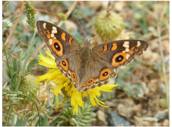
Junonia villida , Meadow Argus Butterfly on Podolepis jaceoides , Showy Copper-wire Daisy.