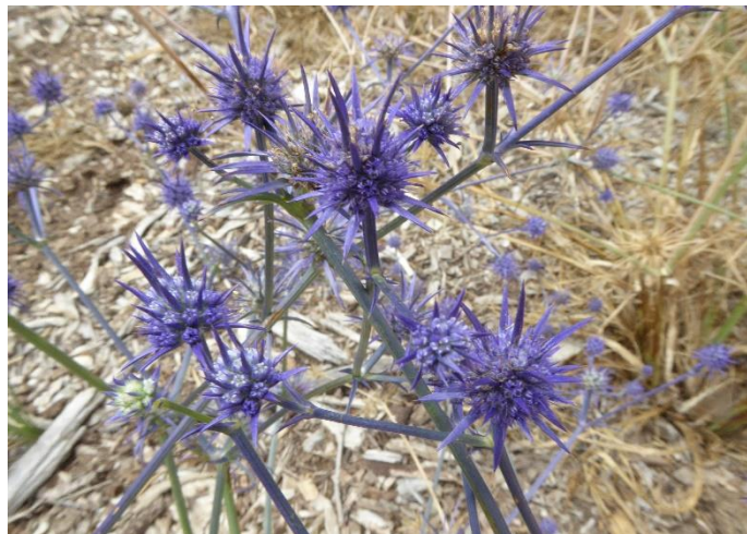
Eryngium ovinum , Blue Devil. A perennial herb with a thistle like head. Regrows from the base each year.