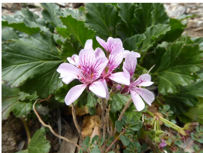
Pelargonium australe , Native Pelargonium. A member of the Geranium family.