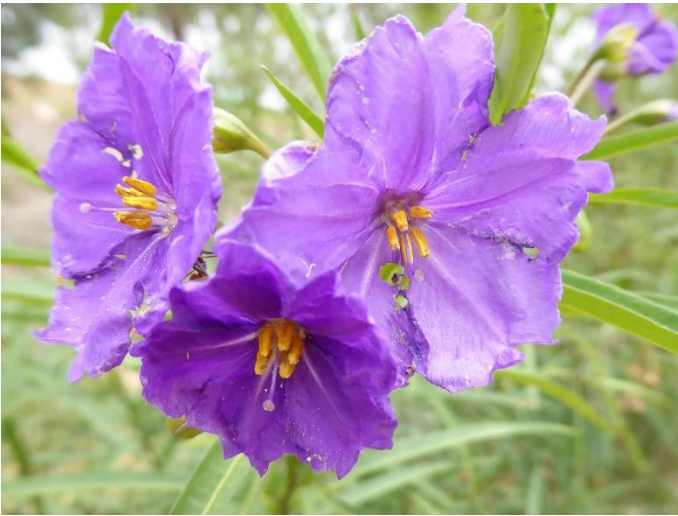
Solanum linearifolium , Mountain Kangaroo Apple. A long flowering tall woody shrub that may self-seed.