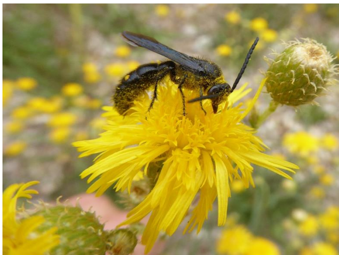
Podolepis jaceoides , Showy Copper-wire Daisy with Laeviscolia frontalis the Two-spot Hairy Flower Wasp,