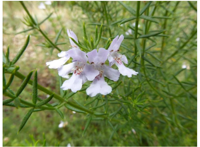
Westringia eremicola , Slender Westringia. A low shrub with slightly prickly leaves that are in whorls.