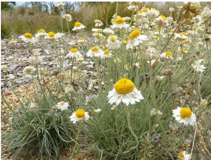
Leucochrysum albicans , Hoary Sunray. An attractive and long flowering perennial daisy.