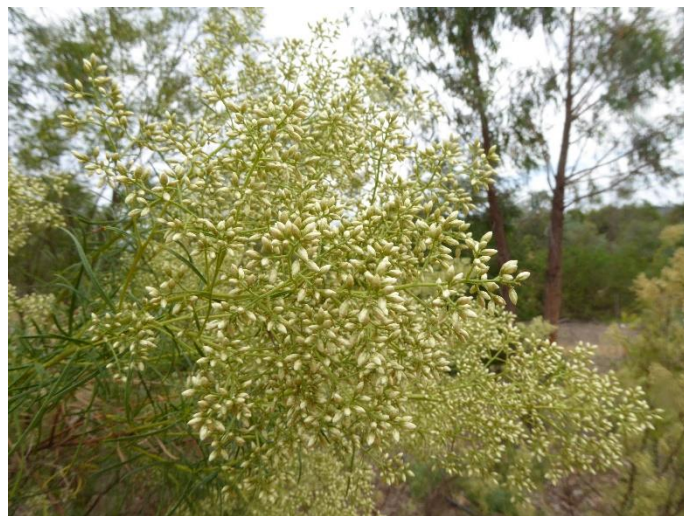
Cassinia quinquefaria , Wild Rosemary. A tall aromatic shrub of the daisy family with straw coloured flowers.