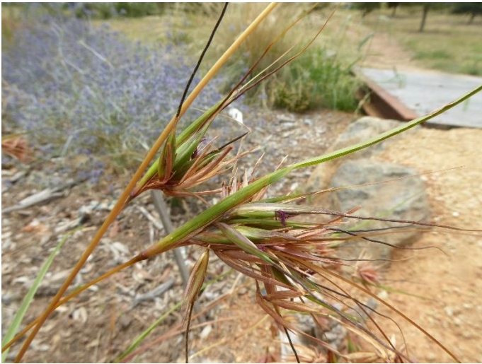
Themeda triandra , Kangaroo Grass. An attractive summer flowering grass suitable for garden settings.