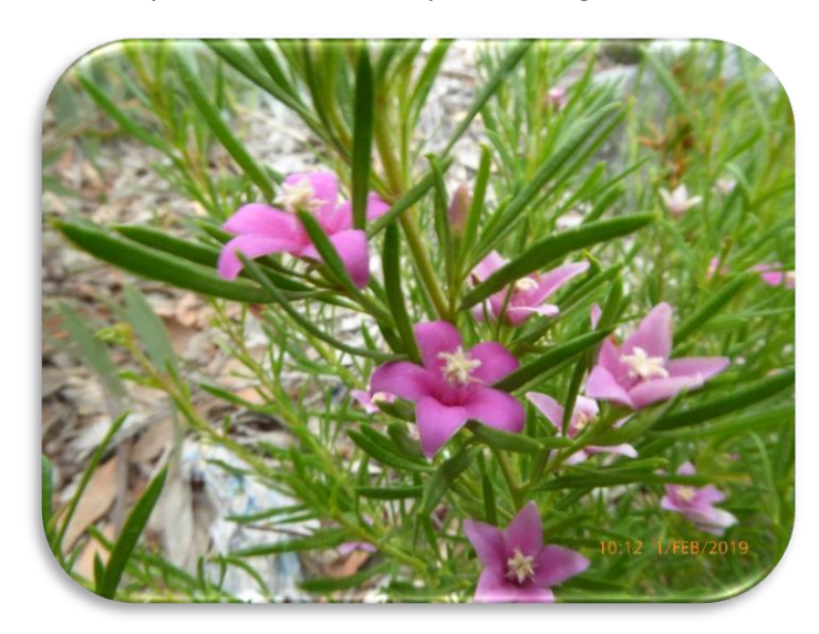
Crowea Exalata Ginninderra Falls.