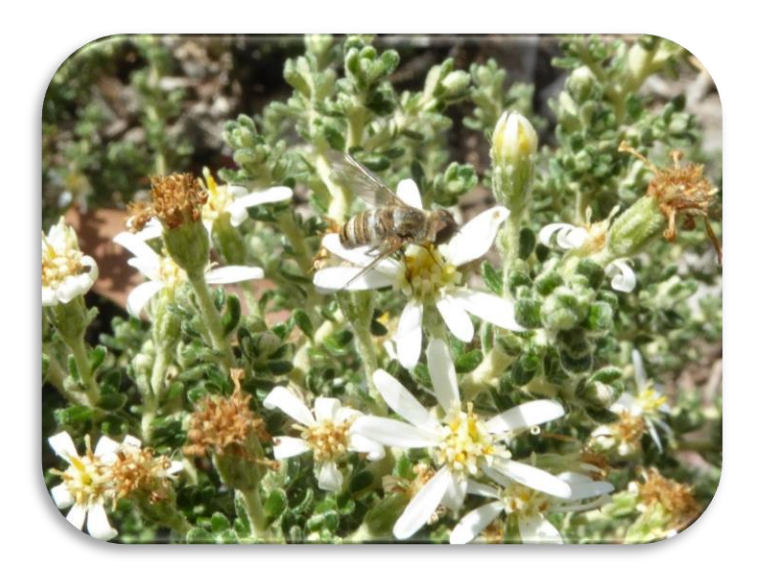
Olearia microphylla, Small-leaved Daisy Bush