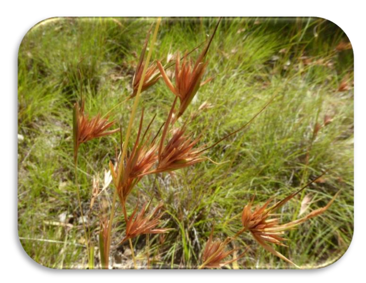
Themeda triandra, Kangaroo Grass

Working bees are held every Thursday morning from 8am, please feel free to join our friendly group at whatever time you are able. We break for morning tea at 10 am at the table near our shed. An excellent BYO morning tea is guaranteed. Park on lower section of overflow car park. Times may be earlier if it is hot.