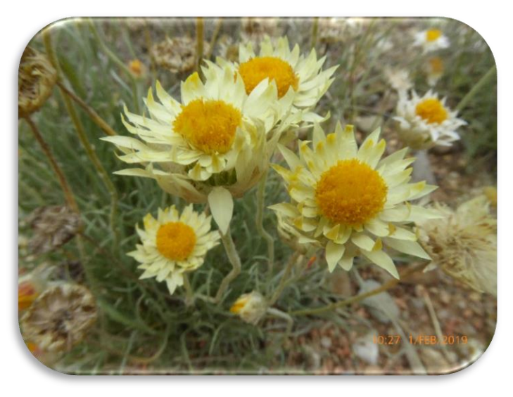
Leucochrysum albicans, Hoary Sunray. A long flowering local daisy showing yellow form.