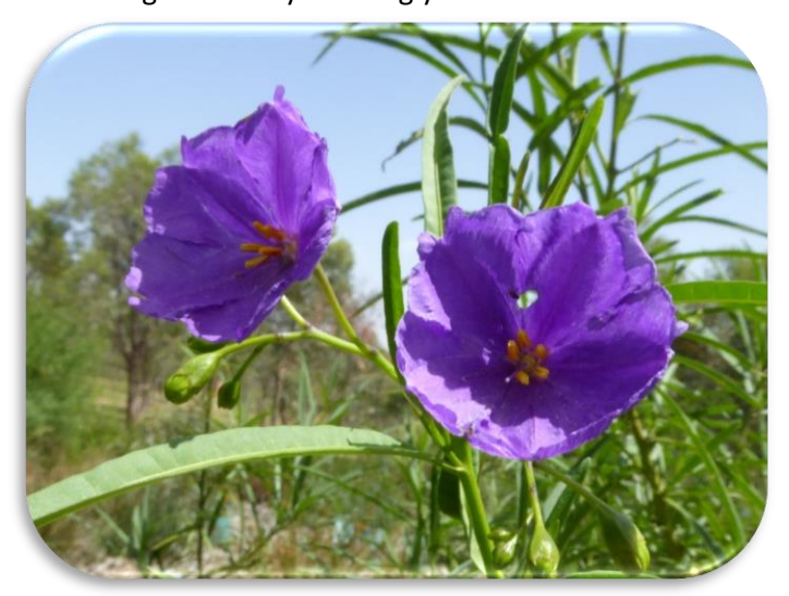
Solanum linearifolium, Mountain Kangaroo Apple