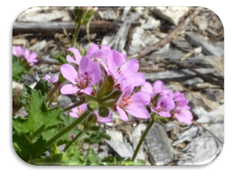
Pelargonium australe, Native Pelargonium. A member of the Geraniaceae Family.