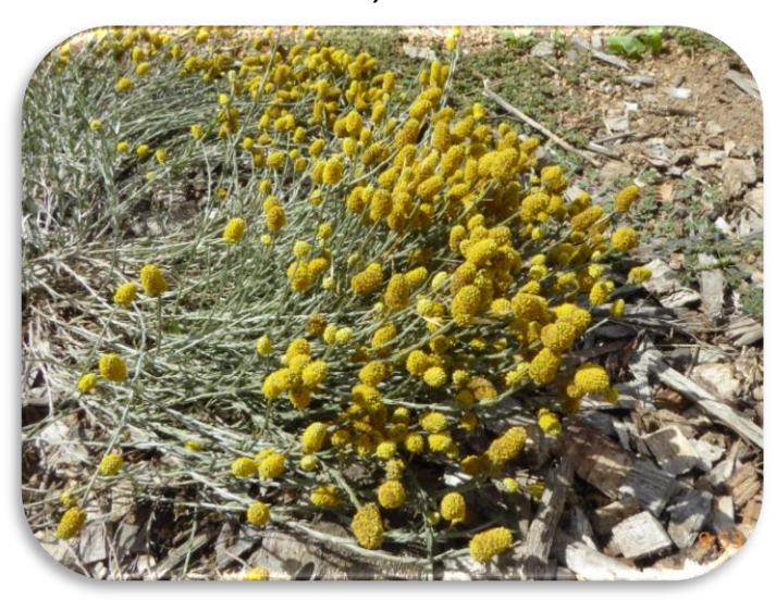
Calocephalus citreus, Lemon Beauty Heads.