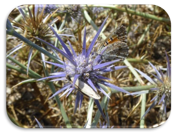
Eryngium ovinum, Blue Devil with butterflies