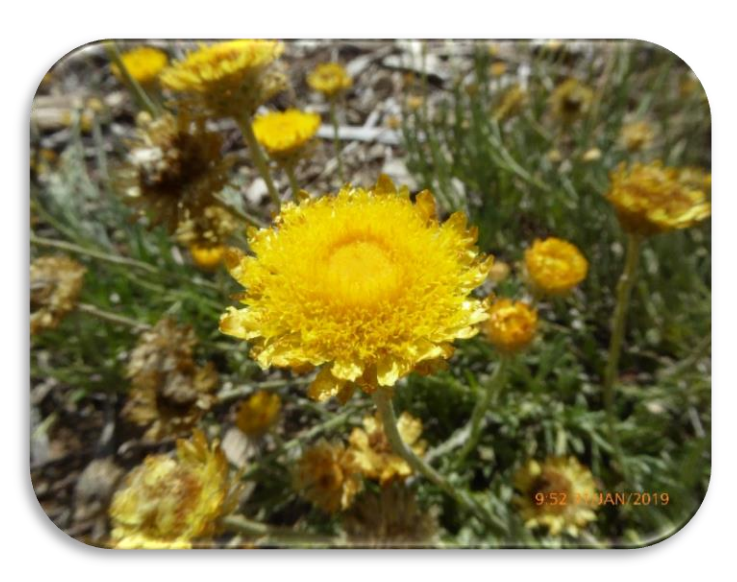
Coronidium gunnianum, Pale Everlasting

Working bees are held every Thursday morning from 8am, please feel free to join our friendly group at whatever time you are able. We break for morning tea at 10 am at the table near our shed. An excellent BYO morning tea is guaranteed. Park on lower section of overflow car park. Times may be earlier if it is hot.