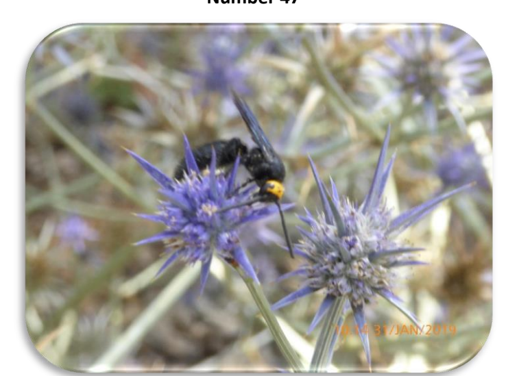
Scolia verticalis, Yellow-headed Flower Wasp.