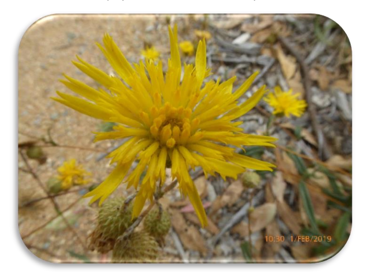
Podolepis jaceoides, Showy Copper-wire Daisy