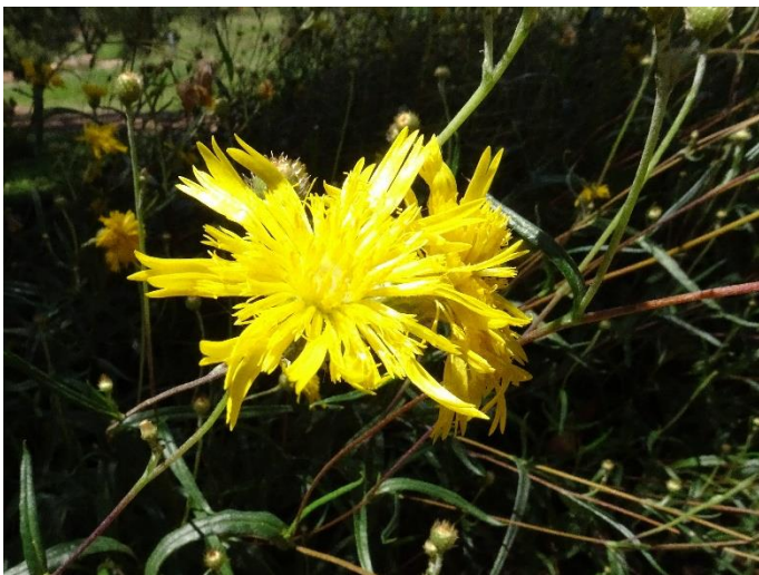
Podolepis jaceoides , Showy Copper-wire Daisy. An attractive long flowering perennial daisy.