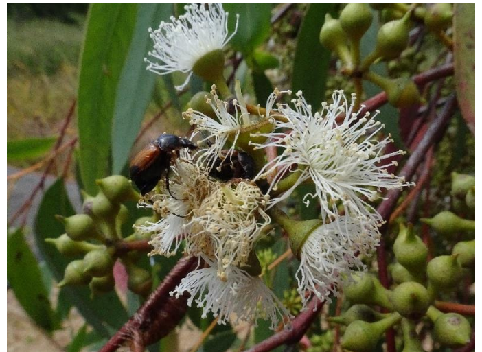
Eucalyptus macrorhyncha Red Stringybark with Phyllotocus navicularis , Nectar Scarab.