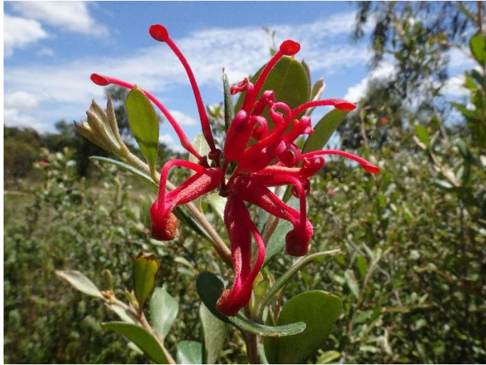
Grevillea victoriae , Royal Grevillea. A rounded frost tolerant shrub. Flower colour is variable.