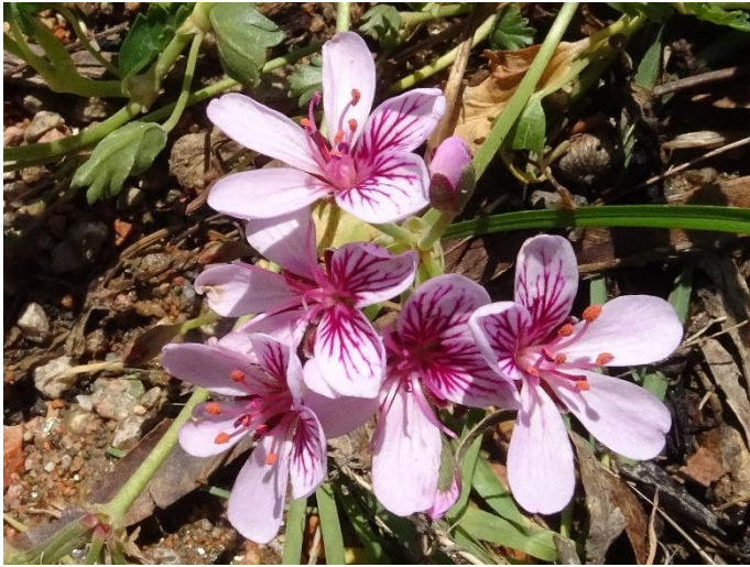
Pelargonium sp. Striatellum , Omeo Storksbill. An endangered species associated with basalt lakes.