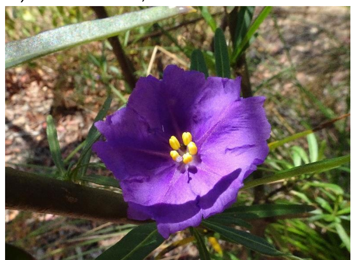
Solanum linearifolium , Mountain Kangaroo Apple. A tall woody shrub that self-seeds readily.