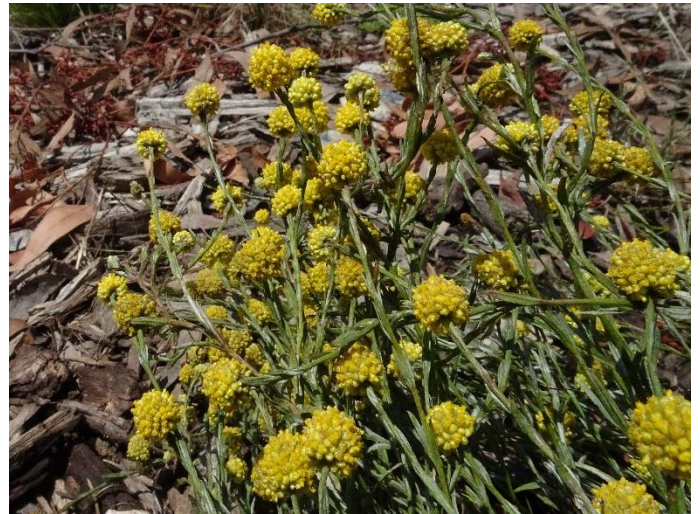
Calocephalus citreus , Lemon Beauty-heads. A low perennial daisy with silvery foliage.