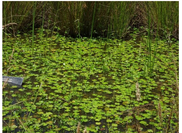
Marsilea drummondii , Nardoo. An aquatic fern that is beneficial for frogs. They are noisily calling here today.

Our working bees are continuing in these uncertain times. Check in CBR is required at our shed. A BYO morning tea is held at the tables near the shed. We have sufficient chairs to be able to space out.