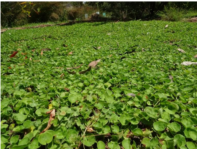
Dichondra repens , Kidney Weed. An herbaceous perennial with a creeping habit that likes wet locations