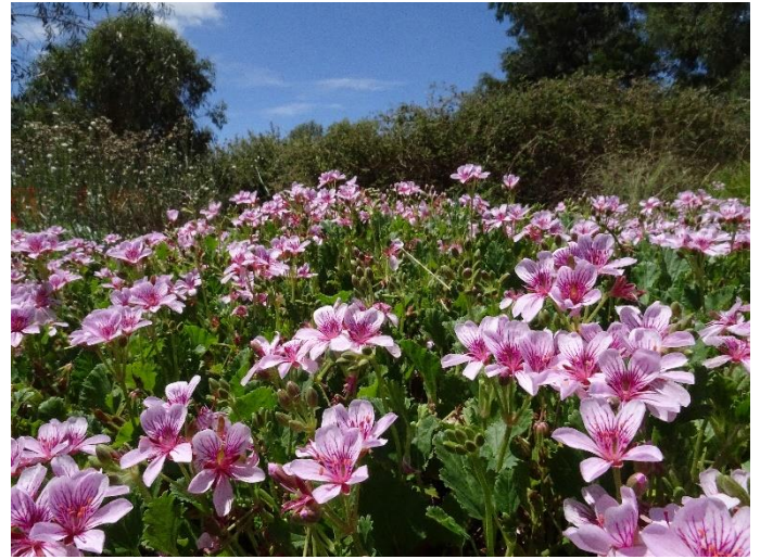
Pelargonium australe , Native Pelargonium. Best known of the seven Australian pelargonium species.