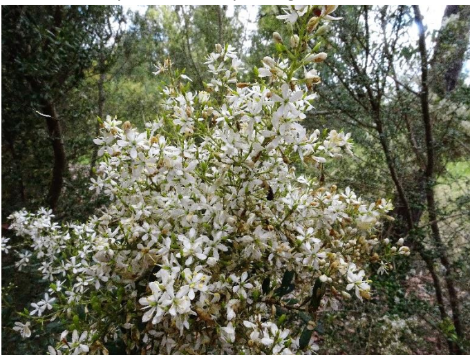
Bursaria spinosa , Blackthorn. A small tree or shrub. An understory species of eucalypt woodland, attractive to insects at flowering.