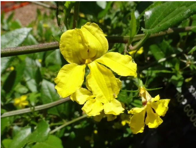
Goodenia ovata , Hop Goodenia. A small, rounded shrub that responds well to pruning.