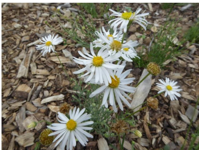
Brachyscome dentata , Lobe-seed Daisy. A perennial daisy that is found across most of NSW.