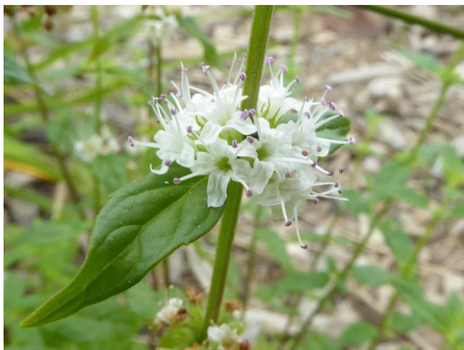
Mentha diemenica , Slender Native Mint. Likes damp conditions. Useful as a culinary herb.