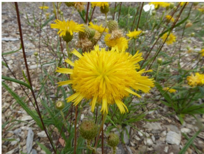
Podolepis jaceoides , Showy Copper-wire Daisy. An attractive daisy renewing from the rootstock annually