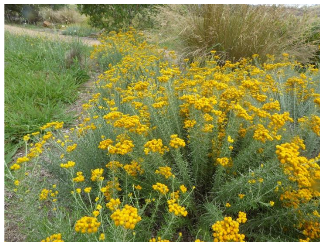
Chrysocephalum semipapposum , Clustered Everlasting. A hardy daisy that renews from the base annually. Remove old stems as new growth comes.