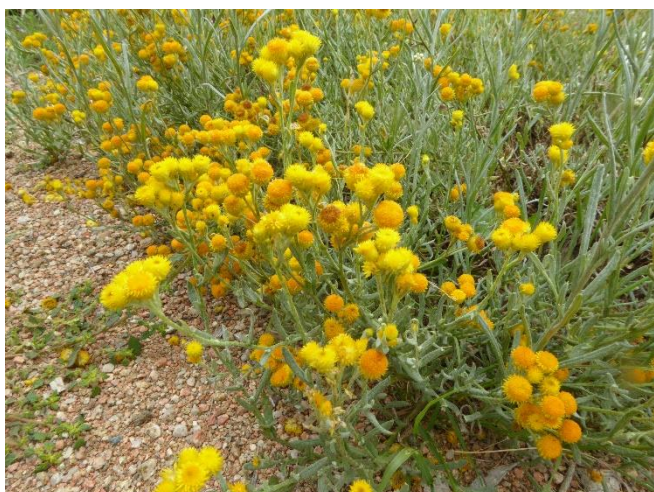
Chrysocephalum apiculatum , Common Everlasting. A perennial daisy species that has many forms.