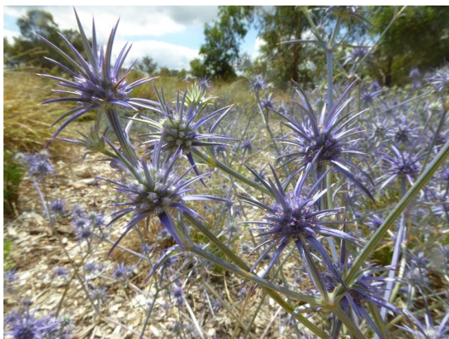
Eryngium ovinum , Blue Devil. A perennial herb that renews from the base each year.