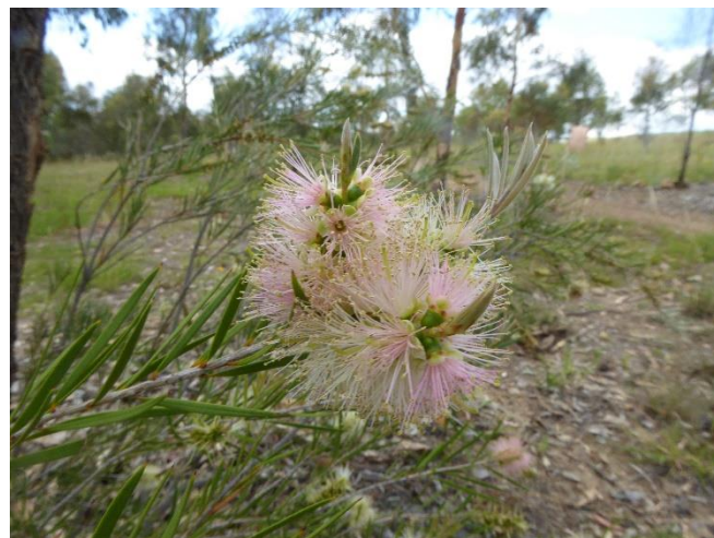
Callistemon sieberi , River Bottlebrush. A small tree or shrub tolerant of both wet and dry conditions.