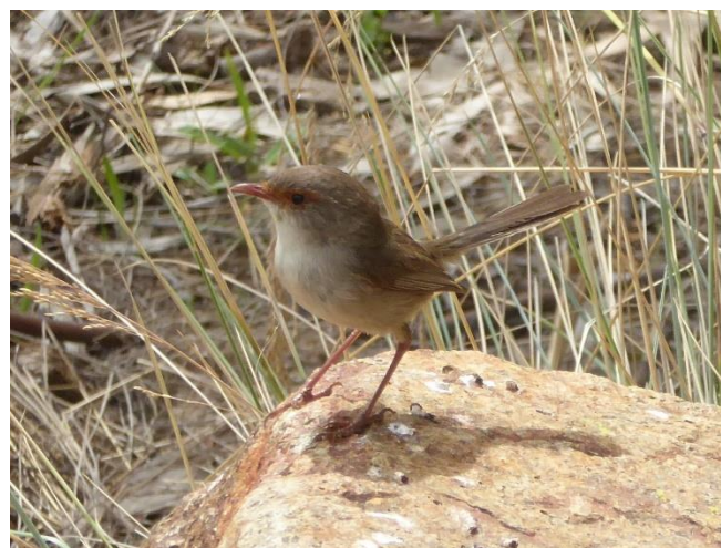
Malurus cyaneus , Female or juvenile Superb Fairy-wren near ephemeral wetland and Teatree cover