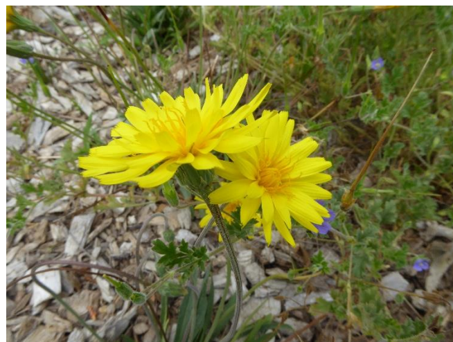
Microseris lanceolata , Murnong. A perennial herb used as a food source by indigenous communities.