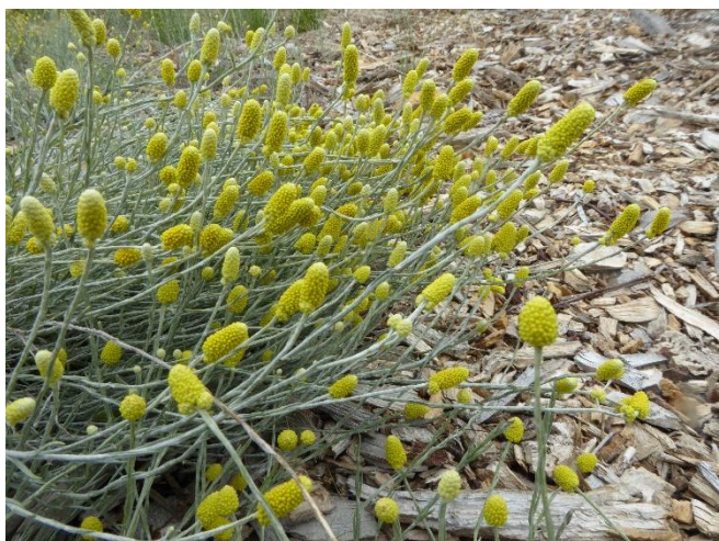
Calocephalus citreus , Lemon Beauty-heads. A low perennial daisy with silvery foliage. Copes with dry conditions.