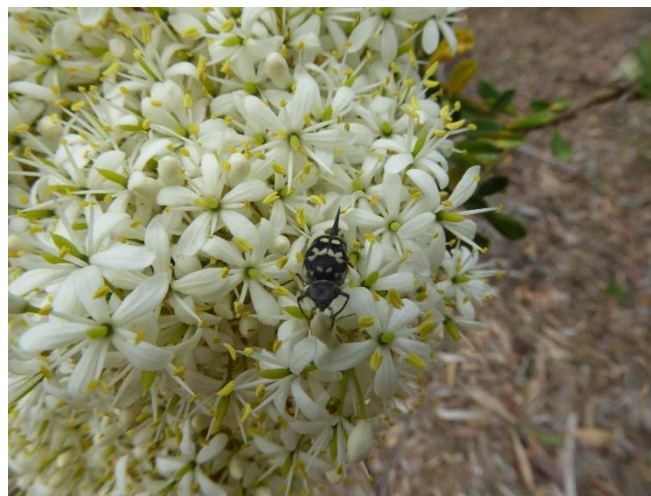
Bursaria spinosa , Sweet Bursaria. A tall thorny shrub that is cover for small birds, flowers attracts insects.