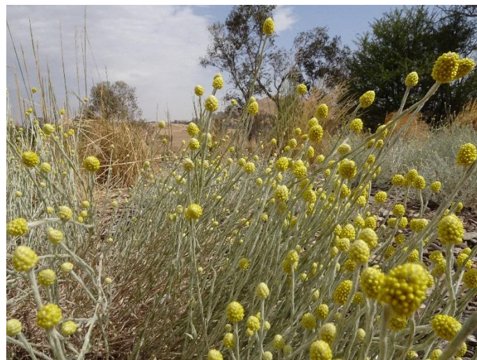
Calocephalus citreus , Lemon Beauty-heads. A late flowering member of the daisy family.