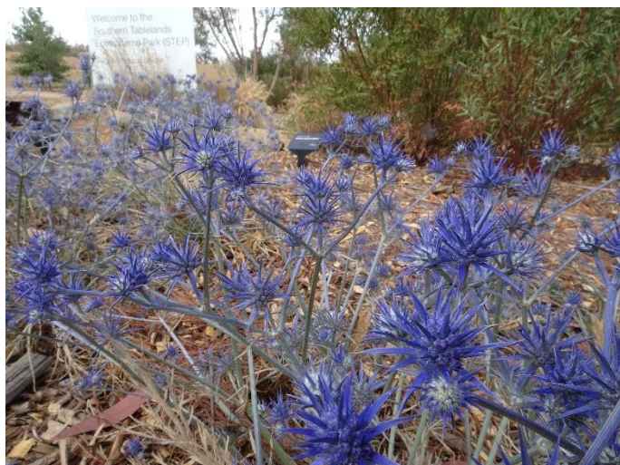
Eryngium ovinum , Blue Devil. A small group of these plants have done well despite dry conditions.

Of Interest at Forest 20, January 2020 Number 57