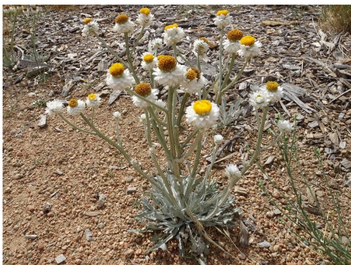
Ammobium alatum , Winged Everlasting. A perennial daisy that reseeds readily.