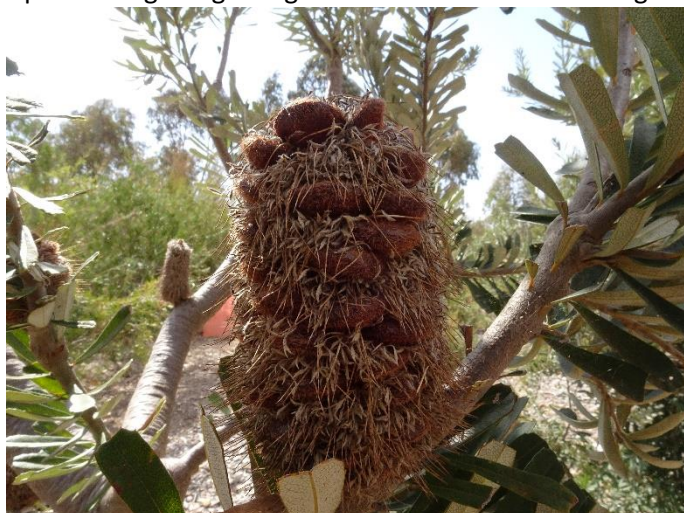
Banksia marginata , Silver Banksia. This species varies across its range in south eastern Australia from a 12-metre tree to a shrub.