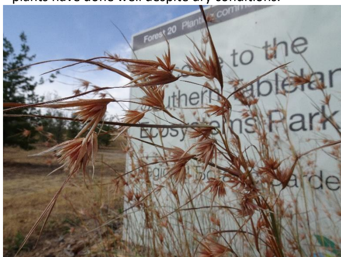
Themeda triandra , Kangaroo Grass. A hardy local perennial grass gracing the welcome to Forest 20 sign.