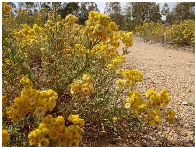
Chrysocephalum apiculatum , Common Everlasting. A hardy local perennial daisy with various forms.