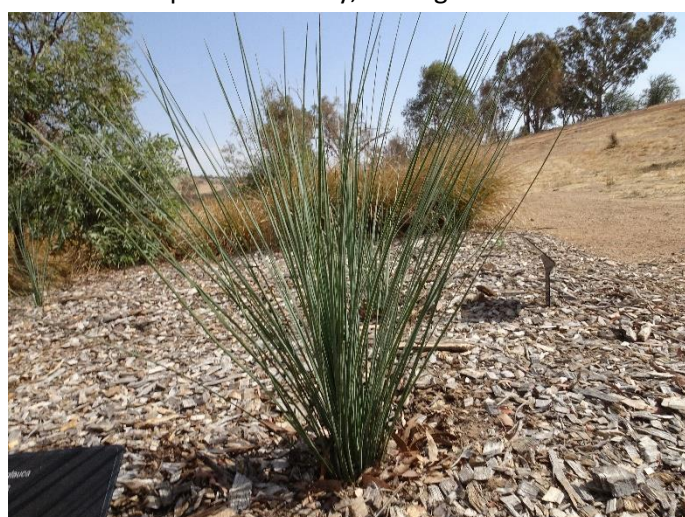
Xanthorrhoea glauca , Southern Grass Tree. Planted in the Bush Tucker Garden, this one is thriving.

Working bees are held every Thursday morning from 8am, feel free to join our friendly group at whatever time you are able. We break for morning tea at 10 am at the table near our shed. An excellent BYO morning tea is guaranteed. Park on grassy overflow car park where a group of cars are seen.