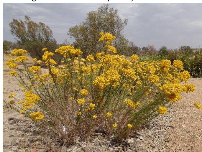
Chrysocephalum semipapposum , Clustered Everlasting. An attractive perennial daisy, looks good en mass.