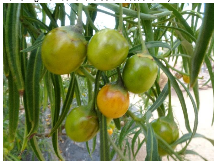
Solanum linearifolium , Mountain Kangaroo Apple. A tall woody shrub that reseeds readily.