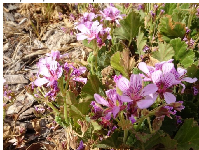
Pelargonium australe , Native Pelargonium. A long-flowering member of the Geraniaceae family.