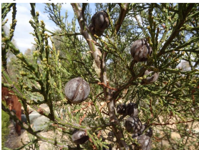
Callitris endlicheri , Black Cypress Pine. Growing adjacent to the Clearing. Showing the seed capsules.