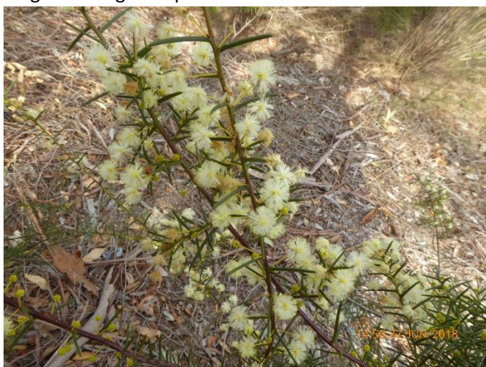
Acacia genistifolia , Early Wattle. A spiny local wattle that provides cover for small birds. Flowers from late autumn to early spring.