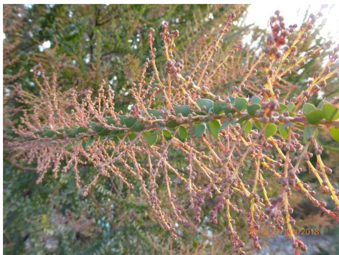
Acacia pravissima Ovens Wattle. Well budded for an early spring flowering.