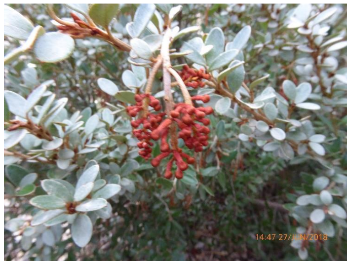
Grevillea diminuta , Small Royal Grevillea. A small shrub that tends to hide its flowers.

Our working bees are held every Thursday morning from 8am, please feel free to join our friendly group at whatever time you able to. We break for morning tea at 10 am at the table near our shed. An excellent morning tea is guaranteed. Park on lower section of overflow carpark with other volunteers.