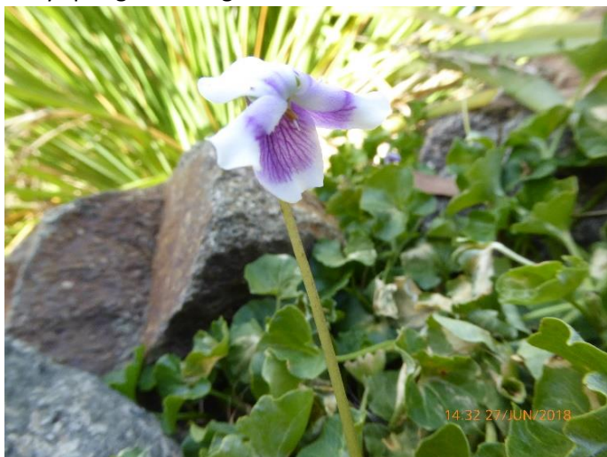
Viola hederacea , Ivy-leaved Violet. A densely spreading stoloniferous herb. Suits damp areas.