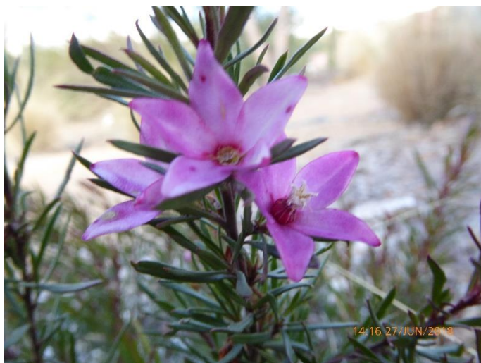
Crowea exalata Ginninderra Falls, Small Crowea. A long flowering local plant.