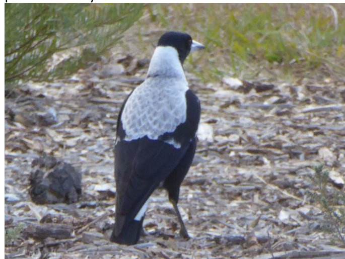
Cracticus tibicens , Australian Magpie. This white backed form of the Magpie is Race hypoleuca .