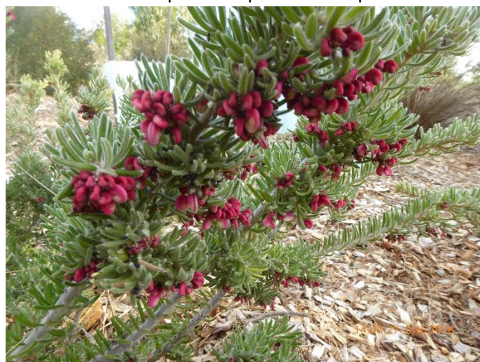
Grevillea lanigera , Woolly Grevillea. Named for its hairy branchlets and leaves. A woodland species.