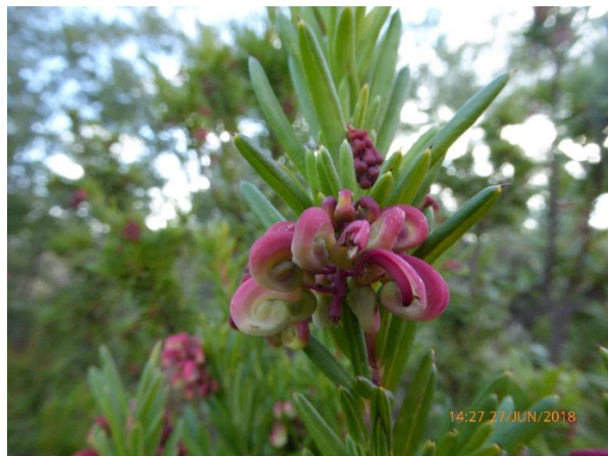
Grevillea iaspicula , Wee Jasper Grevillea. A tall shrub that is endangered in its natural habitat.