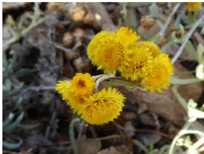
Chrysocephalum apiculatum , Common Everlasting. A perennial daisy with various forms.