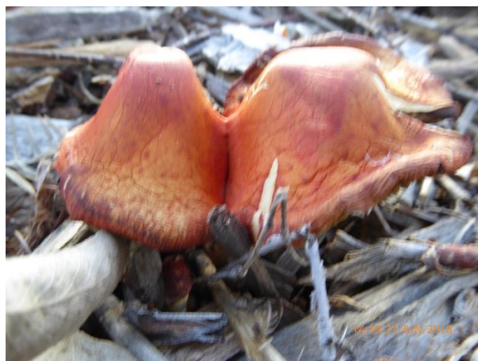
Leratiomyces ceres , Redhead Roundhead. Generally found in wood chips. It is reported to be poisonous.