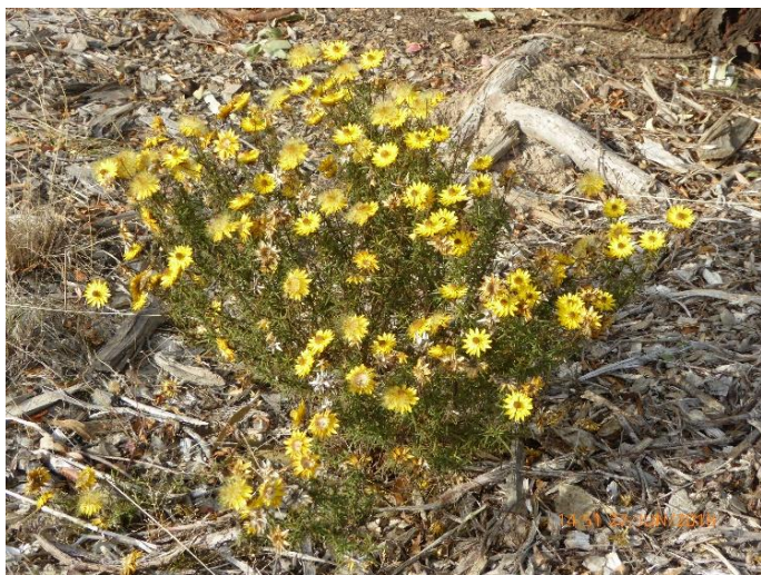
Xerochrysum viscosum , Sticky Everlasting. A hardy common local everlasting daisy.