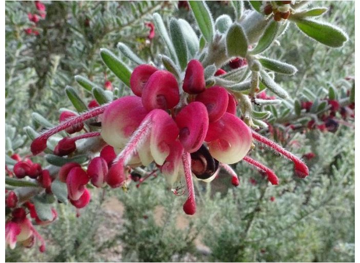
Grevillea lanigera , Woolly Grevillea. Named for its woolly branchlets and leaves. A woodland species.