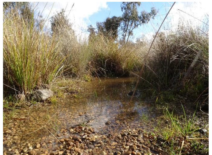
The ephemeral wetland where the Spotted Gras Frog, Eastern Froglets and other frogs are calling.