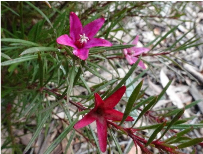
Crowea exalata "Ginninderra Falls", Small Crowea. An attractive long flowering local species.