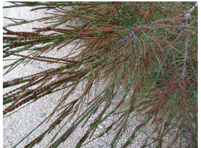
Allocasuarina nana , Dwarf She-oak. Adjacent male plant.

The postal address for STEP is PO Box 440, Jamison Centre, ACT 2614