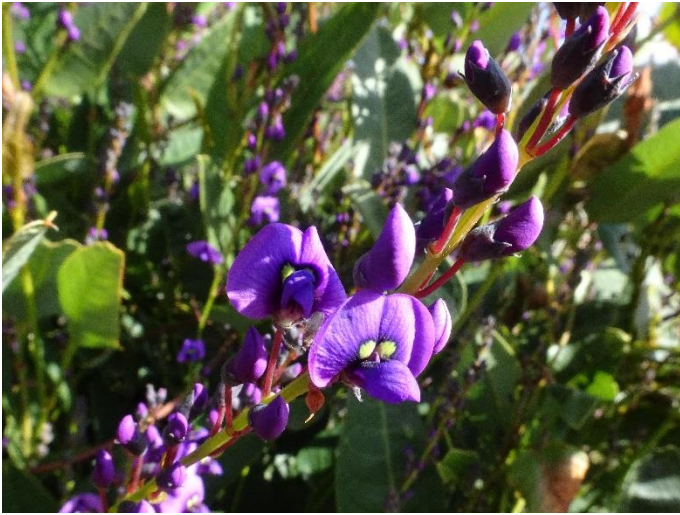
Hardenbergia violacea , False Sarsaparilla. Now flowering for over a month, particularly early.