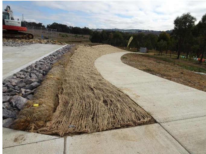
Hessian matting laid beside the ramp entrance to Forest 20 with the aim to reduce erosion.