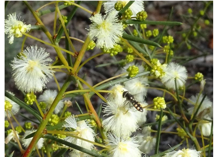
Acacia genistifolia , Early Wattle with Melangyna viridiceps Common Hoverfly. Still here though it is cool