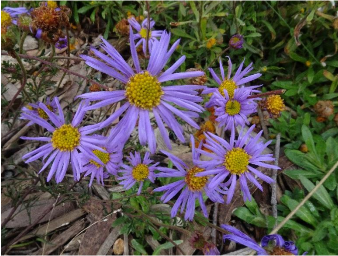
Brachyscome rigidula Cut-leaf Daisy. A sprawling wiry perennial daisy with hairy stems.