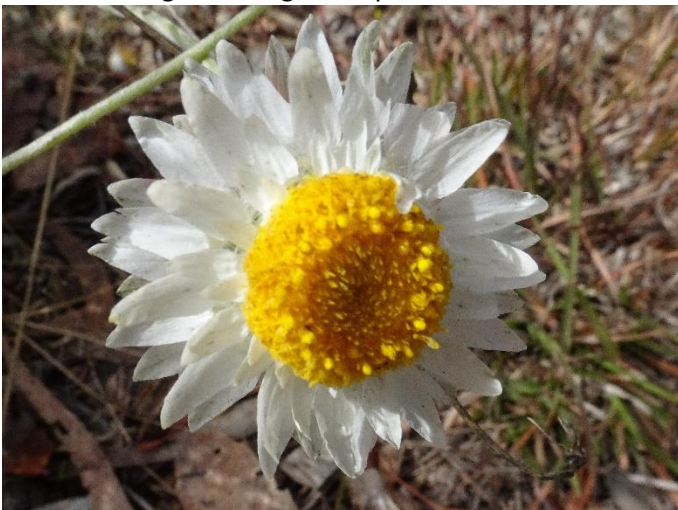
Leucochrysum albicans , Hoary Sunray. An attractive everlasting daisy with white and yellow forms.