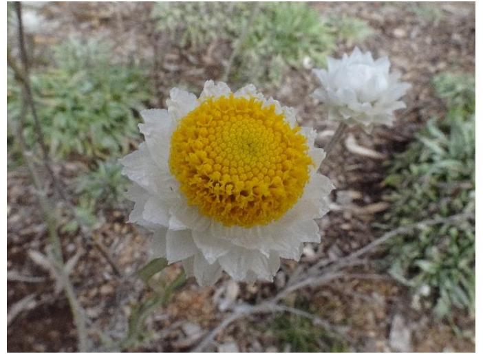
Ammobium alatum , Winged Everlasting. A perennial daisy that may be considered invasive.

Check in CBR is done at our shed. The STEP working bees are being held each Thursday from 8am. Car parking is in the lowest section of the new parking area where you will see a group of cars. Enter by the new concrete ramp. Morning tea is byo and held near our shed. Masks should be worn when congregating.