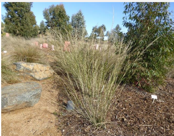
Austrostipa verticilata , Slender Bamboo Grass