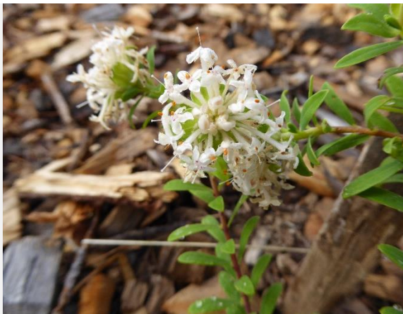
Pimelia linifolia , Slender Rice Flower