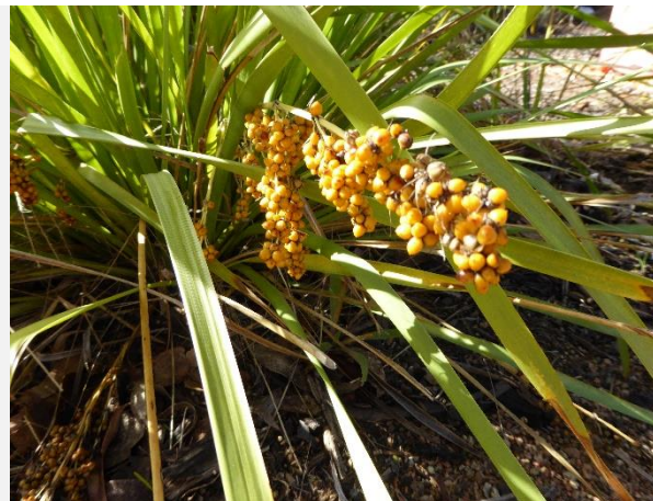
Lomandra longifolia , Spiny-headed Matrush