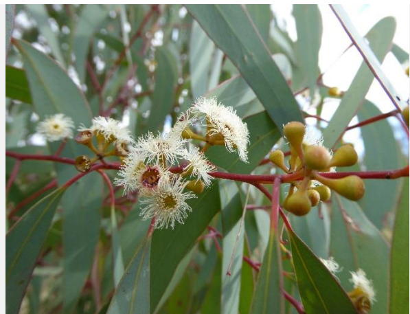
The first of these to flower

Our working bees are held each Thursday morning from 8am, please join our friendly group at whatever time suits you. We break for morning tea at 10 am at the tables near our shed. A scrumptious morning tea is guaranteed.