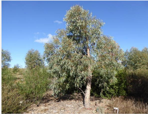
Eucalyptus macrorhyncha , Red Stryngybark