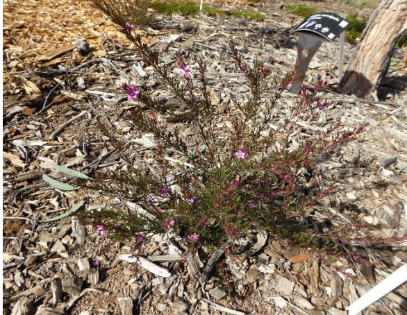
Crowea exalata Ginninderra Falls

Of Interest at Forest 20 National Arboretum Canberra June 2016