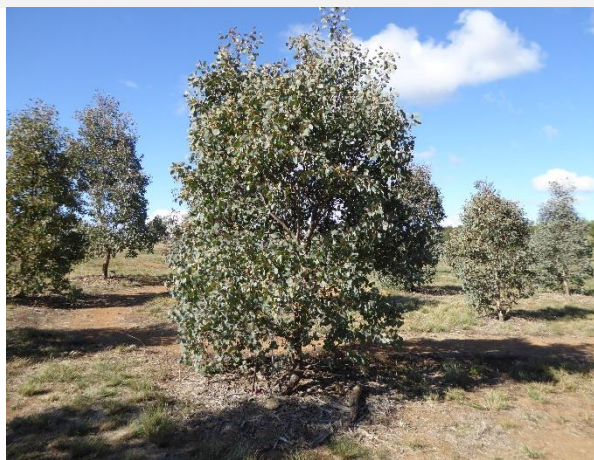
Eucalyptus polyanthemos , Red Box