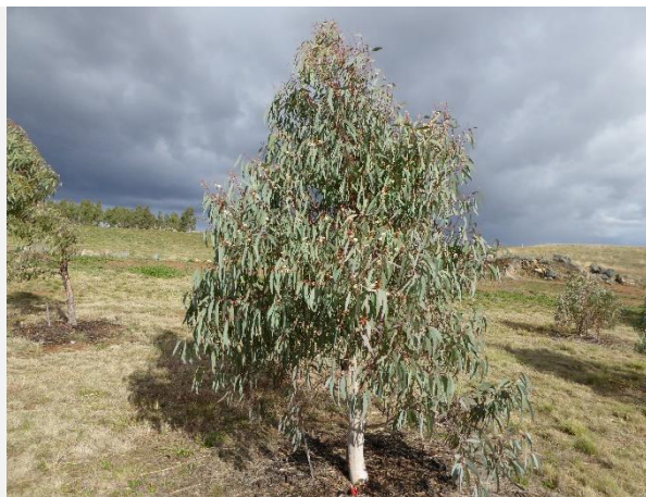
Eucalyptus rossii , Scribly Gum