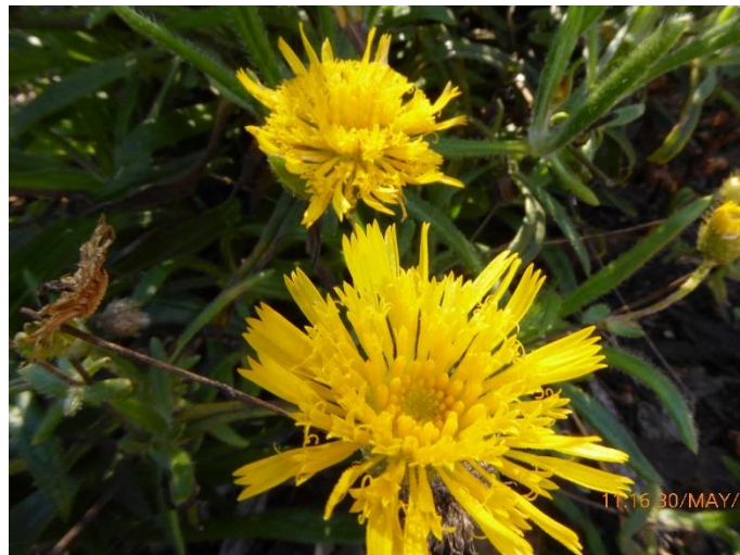
Podolepis jaceoides , Showy Copper-wire Daisy. A long flowering perennial daisy.