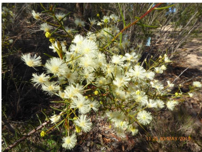
Acacia genistifolia , Early Wattle. A spiny local wattle flowering from late autumn to early spring.