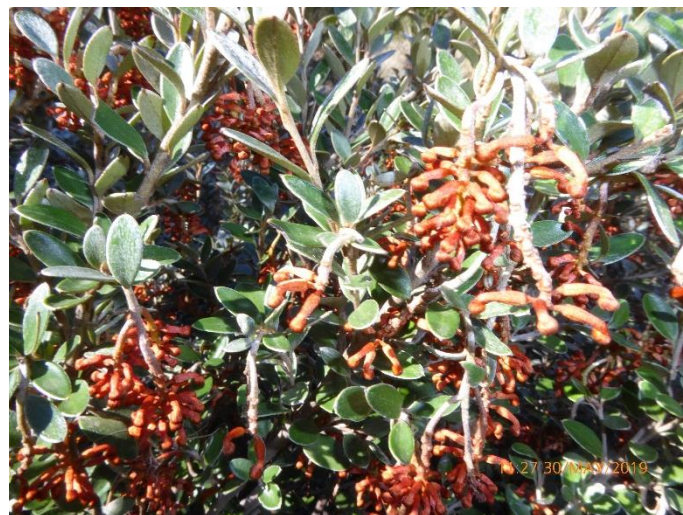
Grevillea diminuta , Brindabella Grevillea. A small shrub that tends to hide its flowers.