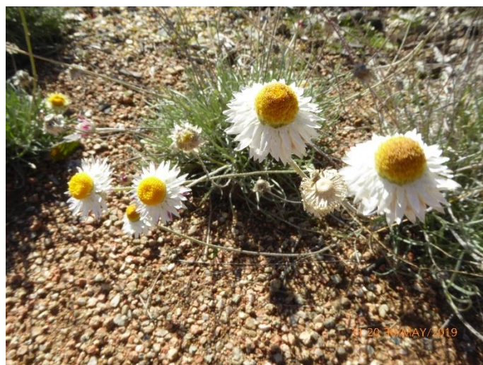
Leucochrysum albicans , Hoary Sunray. This photo shows the colour variation within this species.