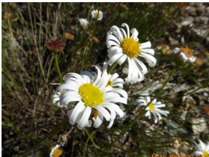
Brachyscome dentata , Lobe-seed Daisy. Another perennial daisy found over most of NSW.