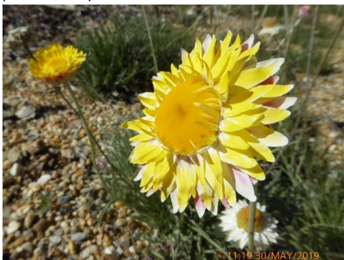
Leucochrysum albicans , Hoary Sunray. A long flowering local daisy. Will reseed well on a gravel base