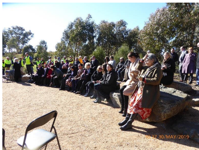
Some of those who attended this event which celebrated the completion of stage 2 of the Bush Tucker Garden and the planting of a snow gum.