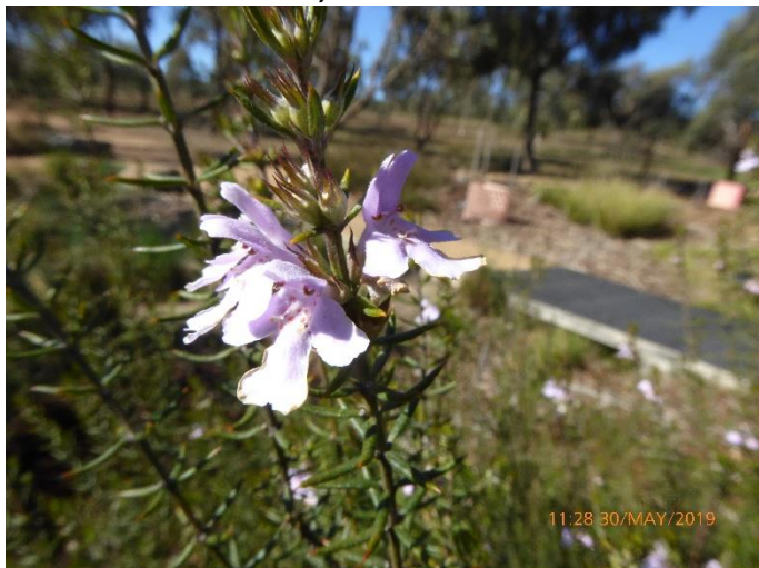
Westringia eremicola , Slender Westringia. A perennial shrub growing to a metre high with attractive flowers.