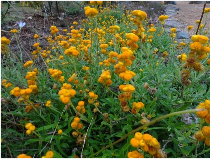
Chrysocephalum apiculatum Common Everlasting. A hardy local perennial daisy with many different forms.