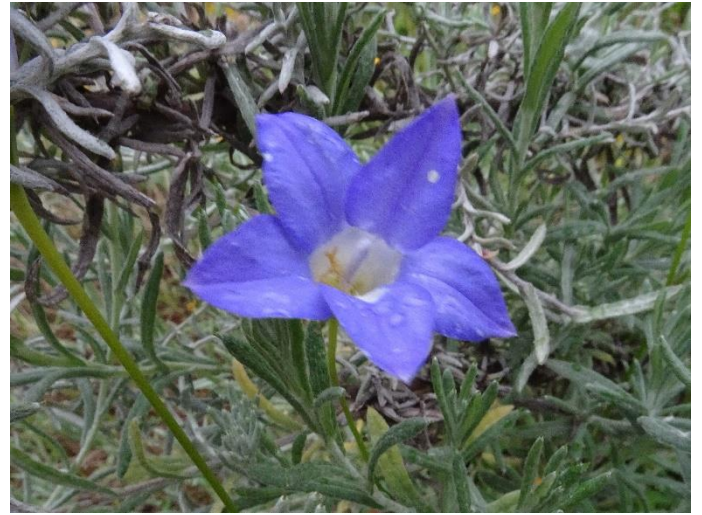
Wahlenbergia stricta Tall Bluebell. The largest flowers of the Wahlenbergia species.

While Forest 20 has been closed to visitors (except on Reconciliation Day) due to damage to our path system, our working bees are continuing each Thursday morning. Morning tea (byo) is at 10am at the tables near the shed