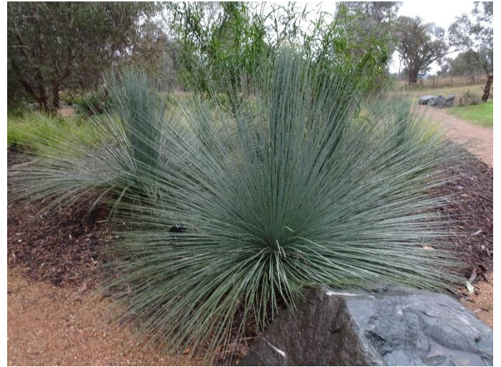
Xanthorrhoea Glauca Grass Tree. Three of these growing well in the Bush Tucker Garden