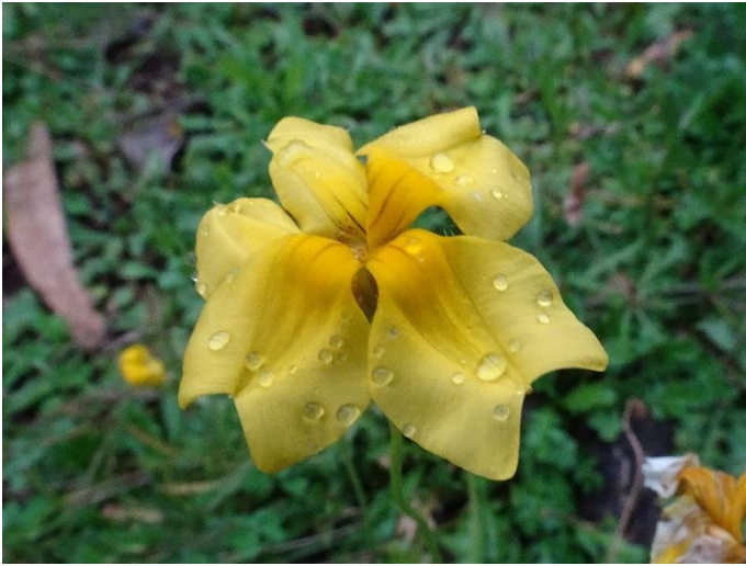
Goodenia pinnatifida Cut-leaf Goodenia. . A widespread grassland species of the southeast.