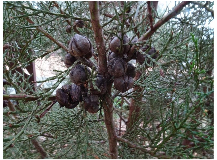
Callitris endlicheri Black Cypress showing the fruiting branchlets and cones, these trees fringe the Clearing.