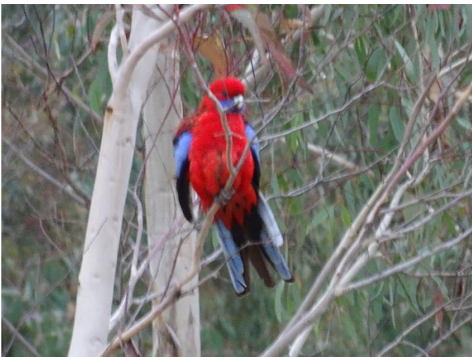
Platycercus elegans Male Crimson Rosella. Perched in a Eucalyptus mannifera Brittle Gum