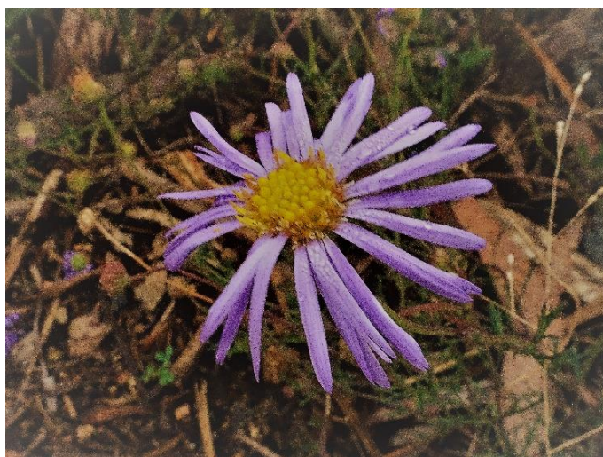
Brachyscome rigidula Cut-leaf Daisy. A sprawling wiry perennial daisy with blue or mauve ray florets.

While Forest 20 has been closed to visitors (except on Reconciliation Day) due to damage to our path system, our working bees are continuing each Thursday morning. Morning tea (byo) is at 10am at the tables near the shed