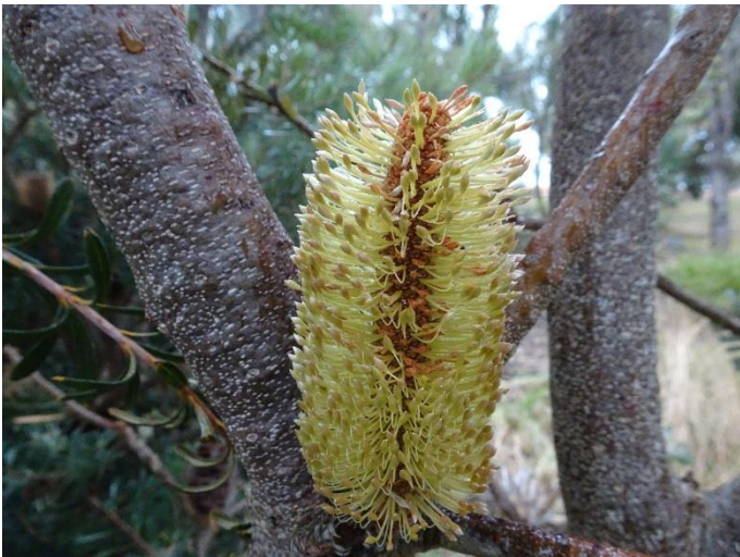
Banksia marginata Silver Banksia. Also called Honeysuckle in early European settlement days