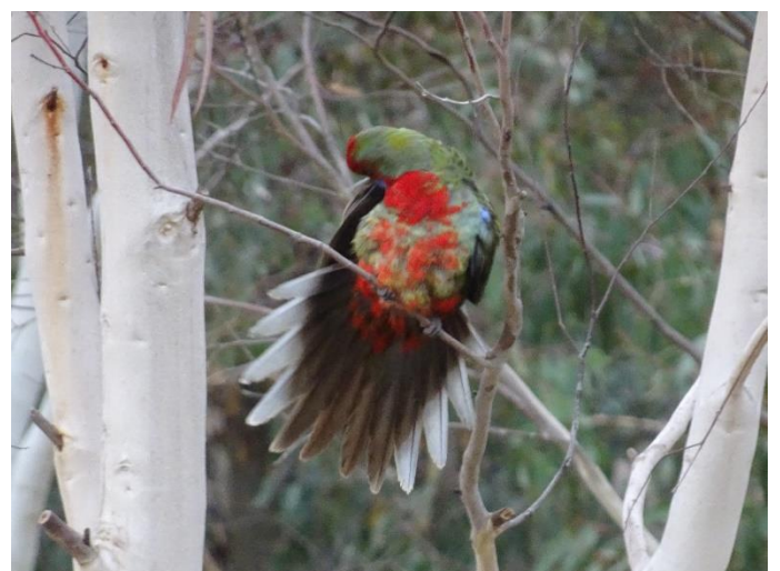
Platycercus elegans Female or juvenile Crimson Rosella in the same tree as the male.