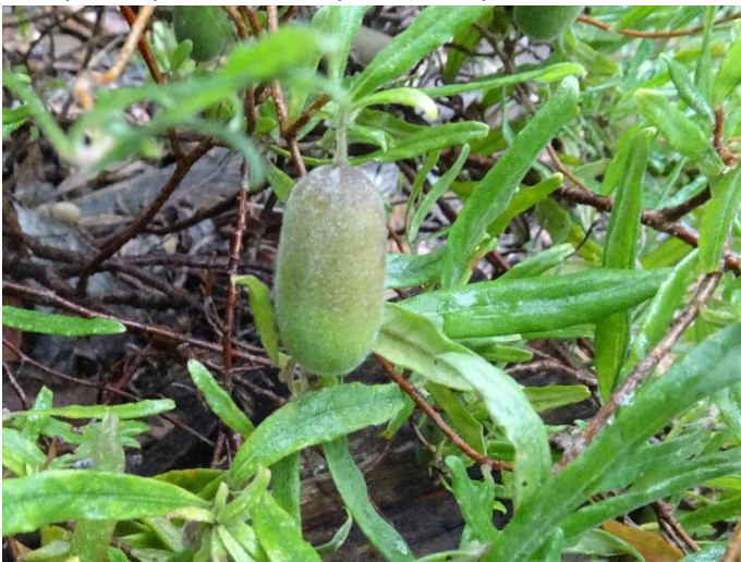
Billardiera scandens Fruit of the Hairy Appleberry. This is growing in the Bush Tucker Garden.