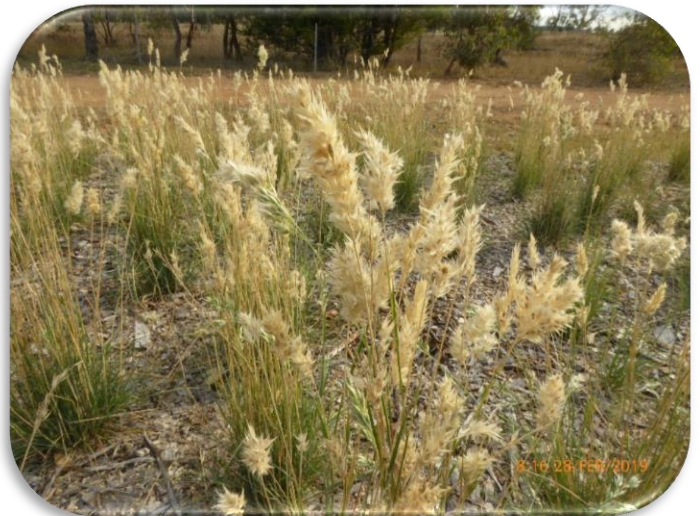
Rytidosperma bipartitum , Leafy Wallaby Grass.