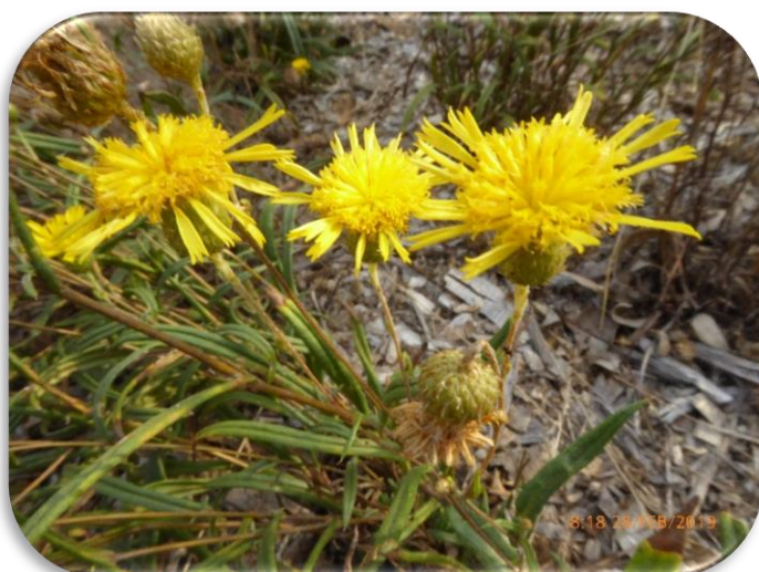
Podolepis jaceoides , Showy Copper-wire Daisy. A long flowering perennial Daisy.