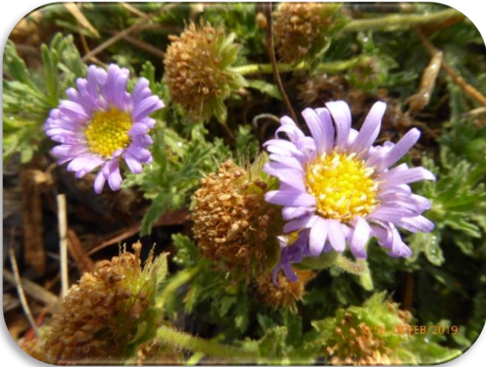
Calotis glandulosa , Mauve Burr-daisy