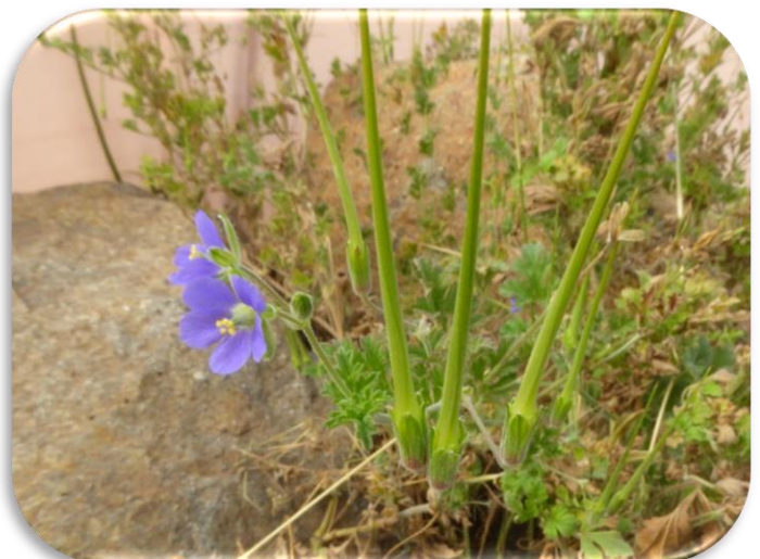
Erodium crinitum , Blue Storksbill. A volunteer species.

Working bees are held every Thursday morning from 8am, feel free to join our friendly group at whatever time you are able. We break for morning tea at 10 am at the table near our shed. An excellent BYO morning tea is guaranteed. Park on grassy overflow section.