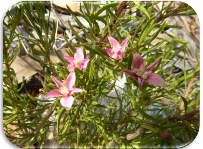
Crowea exalata "Ginninderra Falls". Small Crowea