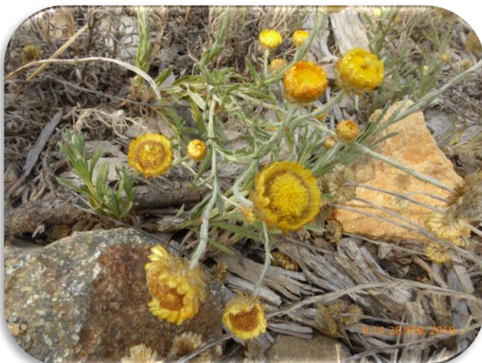
Coronidium gunnianum , Pale Everlasting

Working bees are held every Thursday morning from 8am, feel free to join our friendly group at whatever time you are able. We break for morning tea at 10 am at the table near our shed. An excellent BYO morning tea is guaranteed. Park on grassy overflow section.