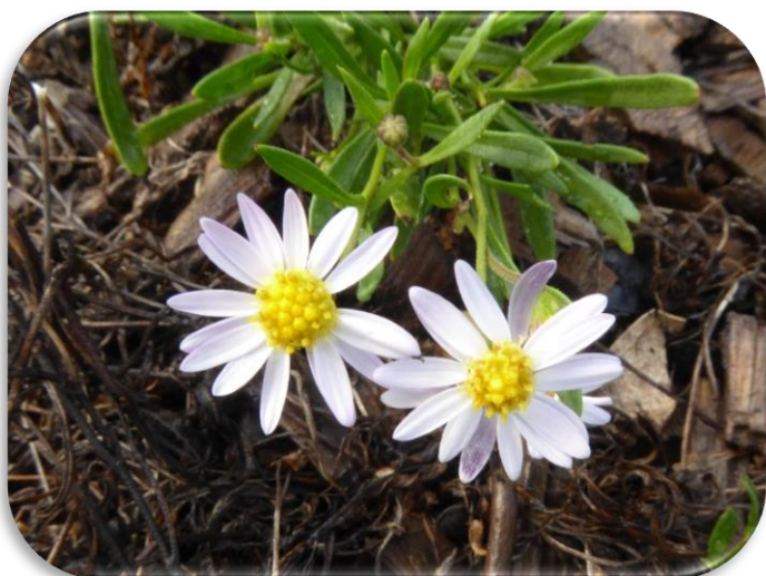
Brachyscome graminea , Grass Daisy. A summer and autumn flowering perennial daisy.