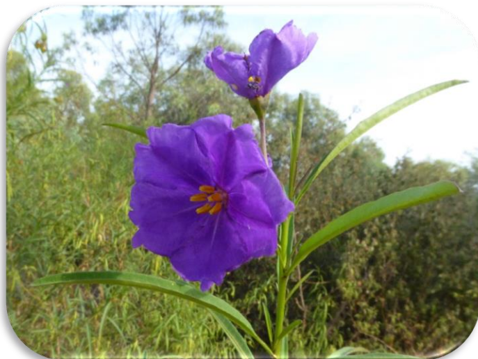
Solanum leiocladum , Mountain Kangaroo Apple.