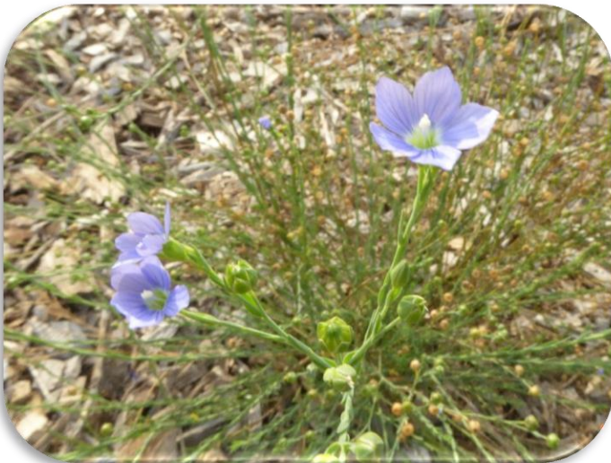
Linum marginale , Native Flax. A short-lived local herb often overlooked when not in flower.