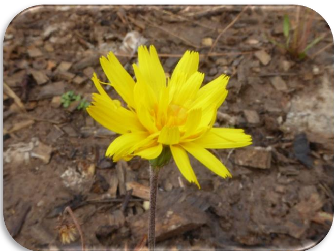
Microseris walteri , Murnong. A perennial herb used as a food source for indigenous communities.