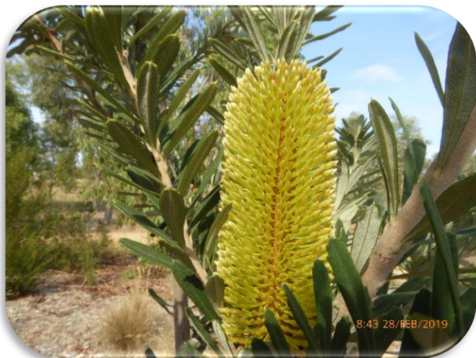
Banksia marginata , Silver Banksia.