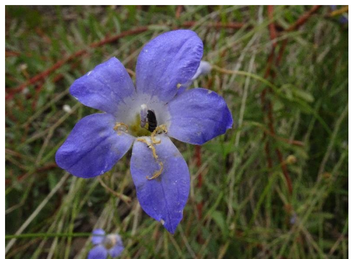
Wahlenbergia stricta Tall Bluebell with an unidentified insect.