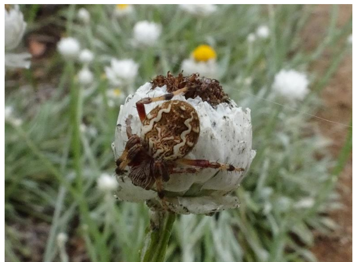
Araneus hamiltoni Hamilton's Orb Weaver on Ammobium alatum Winged Everlasting.

While Forest 20 has been closed to visitors due to damage to our path system, our working bees are continuing each Thursday morning. Morning tea (byo) is at 10am at the tables neat the shed