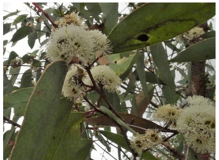
Eucalyptus macrorhyncha Red Stringybark. A young tree with a lot of blossom.