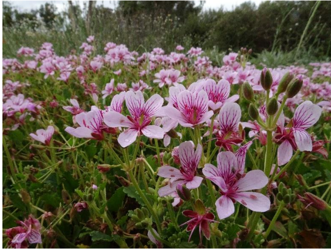
Pelargonium australe Native Pelargonium. This species is a great survivor of the wet conditions