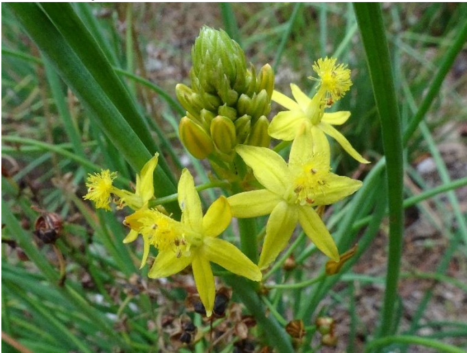
Bulbine bulbosa Bulbine Lily. An attractive species that has fragrant flowers. A useful plant for rockeries.