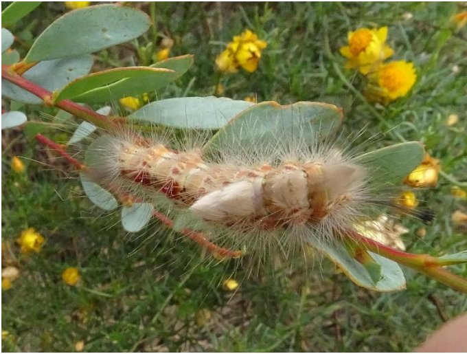
Orgyia anartoides Hairy Apple Moth caterpillar on Acacia buxifolia Box-leaved Wattle.