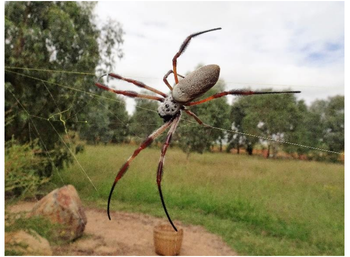
Nephilia edulis Golden Orb-weaving Spider. On a web strung between a post and a tea-tree plant.