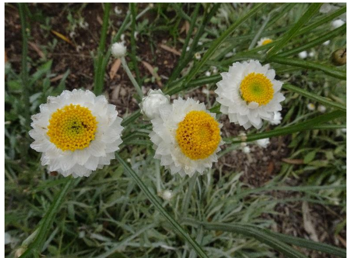
Ammobium alatum Winged Everlasting. A perennial daisy that self-seeds readily. Often considered weedy