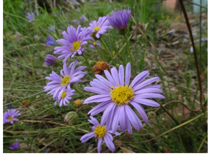
Brachyscome rigidula Cut-leaf Daisy. A sprawling wiry perennial daisy with attractive mauve flowers.