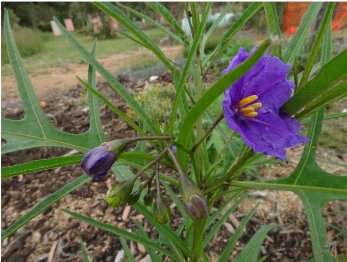
Solanum linearifolium Mountain Kangaroo Apple. A tall woody shrub that readily self-seeds