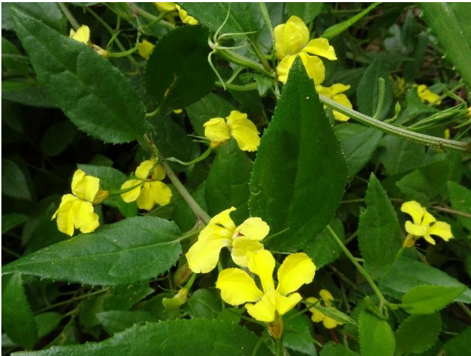
Goodenia ovata Hop Goodenia. A rounded shrub that responds well to pruning. Shown for a second month.