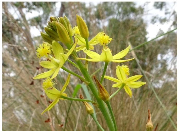
Bulbine glauca Rock Lily. Presumably self-sown as it is trying to compete with exotic grass species.