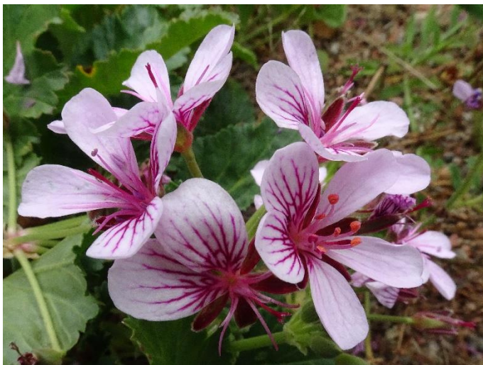
Pelargonium sp. Striatellum Omeo Storksbill. A yet to be formally named endangered species.