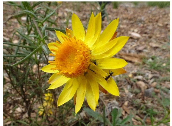
Xerochrysum viscosum Sticky Everlasting with some Iridomyrmex purpureus Meat Ants.