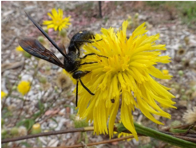
Laeviscolia frontalis , Two-spot Hairy Flower Wasp on Podolepis jacioides Showy Copper-wire Daisy.