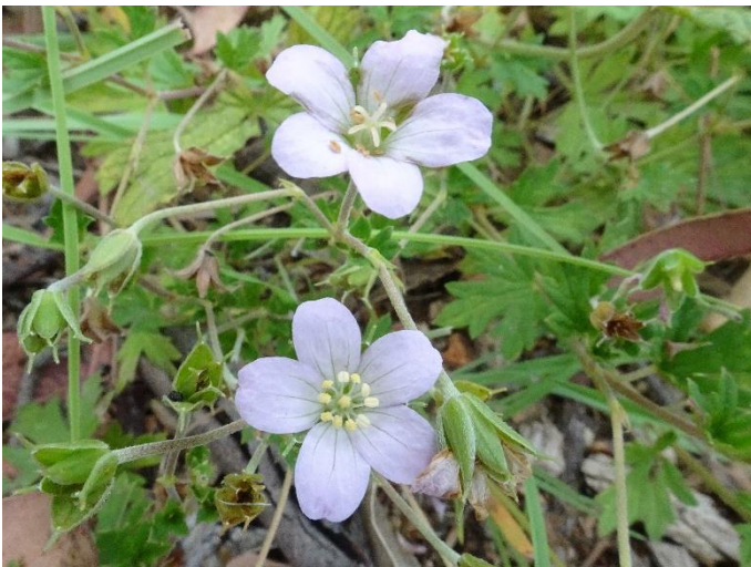
Geranium potentilloides . Cinquefoil Cranesbill. A prostrate perennial herb with a thick taproot.