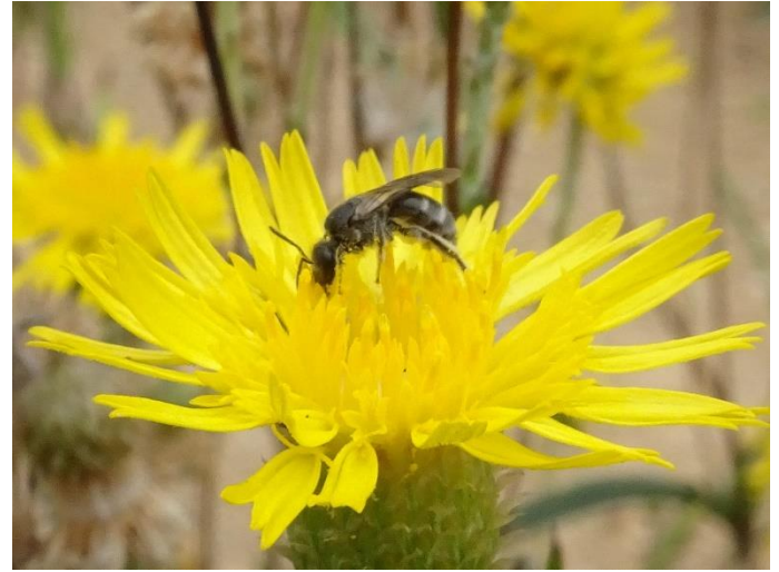
Lasioglossum (Chilalictus) lanarium Halictid Bee on Podolepis jaceoides Showy Copper Wire Daisy.