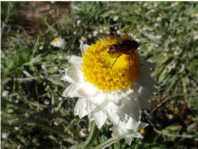
Ammobium alatum Winged Everlasting with Dasybasis sp, a March Fly.