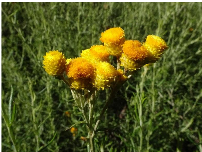
Chrysocephalum semipapposum Clustered Everlasting. Most unusual to be flowering now.