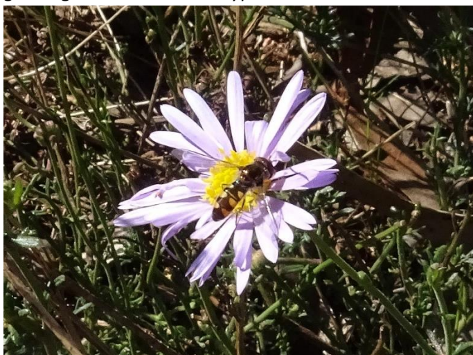
Melangyna viridiceps Common Hoverfly on Brachyscome rigidula Cut-leaf Daisy.