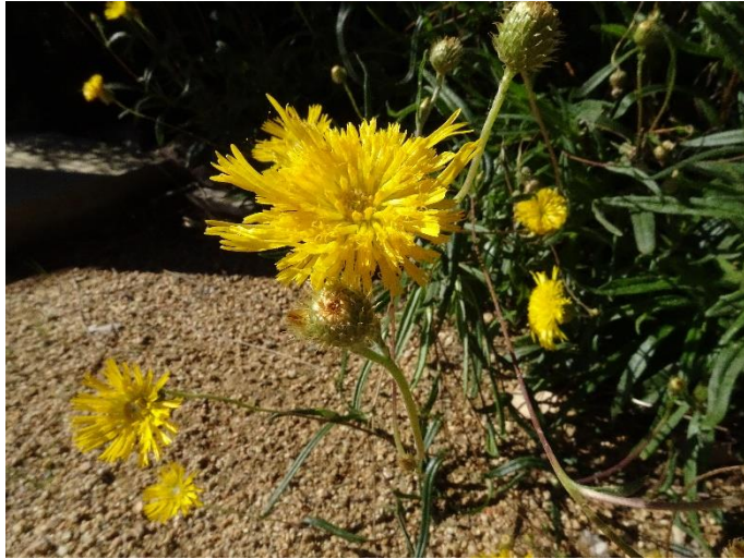
Podolepis jaceoides Showy Copper-wire Daisy. . An attractive long-flowering perennial daisy