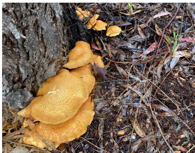
Gymnopilus junonius Spectacular Rustgill. This was growing at the foot of Eucalyptus nortonii .