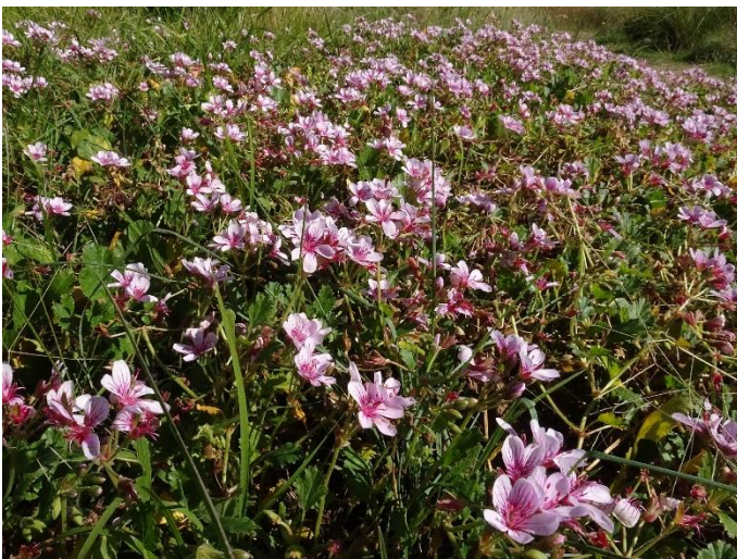
Pelargonium australe Native Pelargonium. A great survivor of the wet conditions. Has flowered for 6 months.