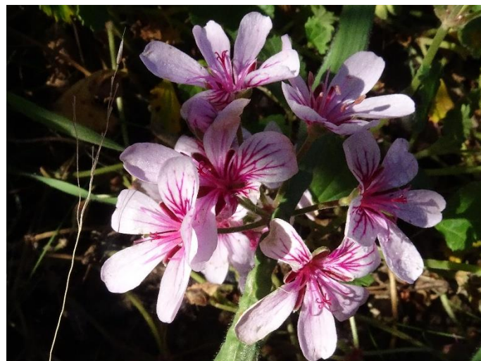
Pelargonium sp Striatellum Omeo Storksbill. A yet to be formally described endangered species.