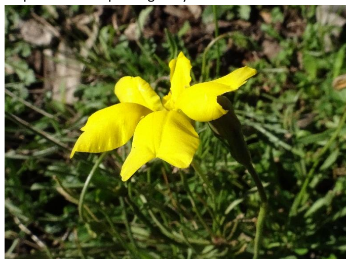
Goodenia pinnatifida Cut-leaf Goodenia. Canberra Nature Map shows this to be widespread in the ACT.

While Forest 20 has been closed to visitors due to damage to our path system, our working bees are continuing each Thursday morning. Morning tea (byo) is at 10am at the tables near the shed