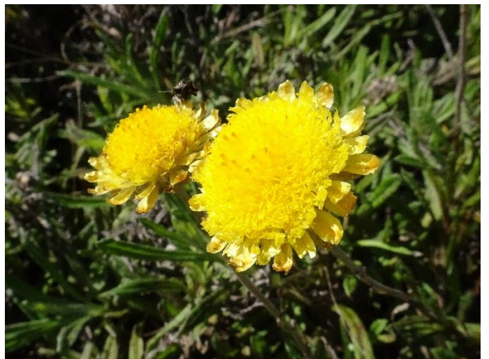
Coronidium gunnianum Pale Everlasting. This perennial daisy species spreads by rhizomes and by seed.