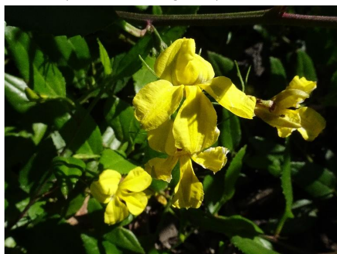
Goodenia ovata Hop Goodenia. A rounded shrub that responds well to pruning. May need some frost care.