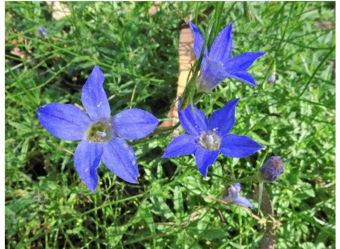
Wahlenbergia stricta Tall Bluebell. Flowering in the Bush Tucker Garden.