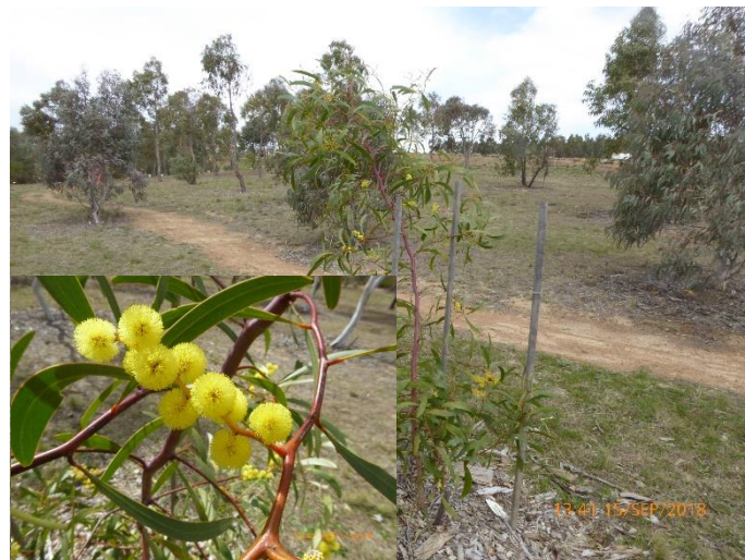
Acacia pycnantha , Golden Wattle. The national floral emblem. A young tree flowering for the first time.