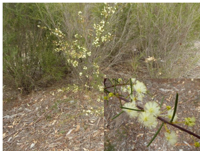
Acacia genistifolia , The Early Wattle. A spiny species that gives cover to small birds. Seen autumn to spring.