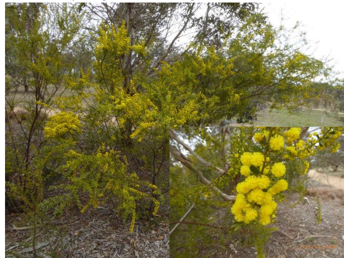
Acacia acinacea , Gold-dust Wattle. A fast-growing drought and frost tolerant species. A medium shrub.