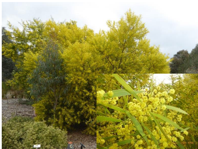
Acacia rubida , the Red-stemmed Wattle A large shrub with dense foliage.

Of Interest at Forest 20, Mid-September 2018