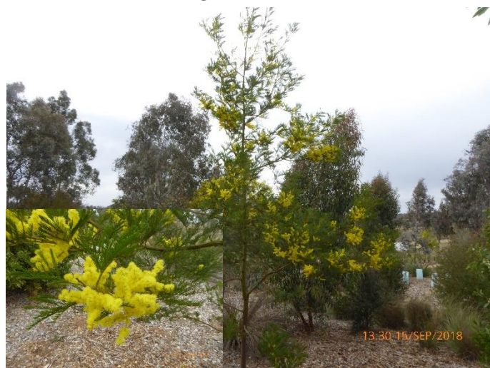
Acacia decurrens , Black Wattle. A tree of dry sclerophyll forests and woodlands. Has distinctive bark