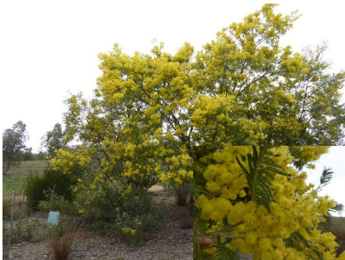
Acacia dealbata , Silver Wattle. A reasonable fast-growing tree that flowers profusely.