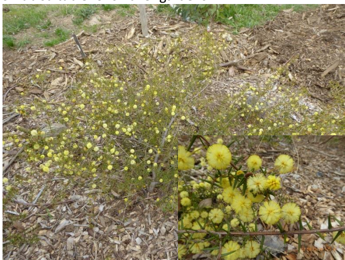
Acacia ulicifolia , Juniper Wattle. A spiny low shrub that may be relatively pale flowered.