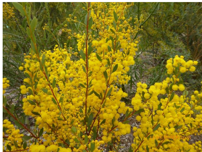
Acacia buxifolia , Box-leafed Wattle. A large shrub with bright golden blossom.