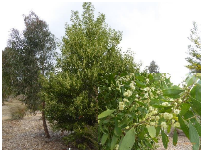
Acacia melanoxylon , Blackwood Wattle or simply Blackwood. A tree of higher rainfall areas Qld to SA