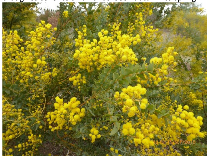
Acacia cultriformis , Knife-leaf Wattle. An erect and quite dense cascading shrub with triangular phyllodes.

Working bees are held every Thursday morning from 8am, please feel free to join our friendly group at whatever time you can. We break for morning tea at 10 am at the table near our shed. An excellent BO morning tea is guaranteed. Park on lower section of overflow carpark where you see a group of vehicles.