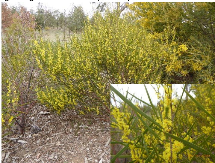
Acacia dawsonii , Poverty Wattle. A low to medium shrub suitable for smaller gardens.