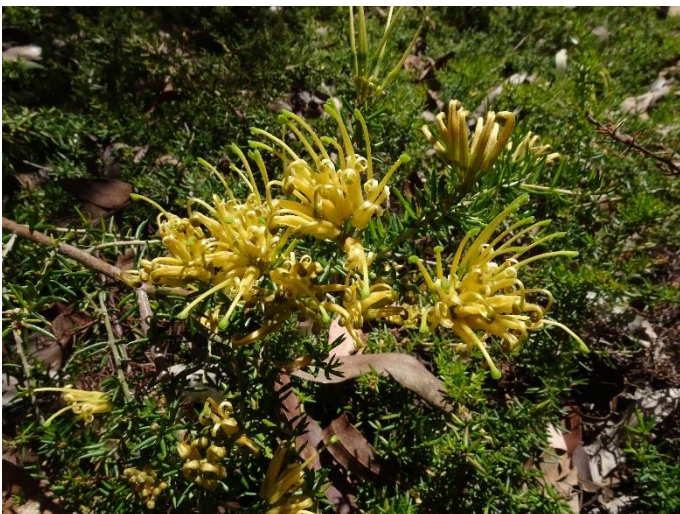
Grevillea juniperina , Juniper-leaf Grevillea. A prostrate form of this species. Flower colour varies as does the growth habit.