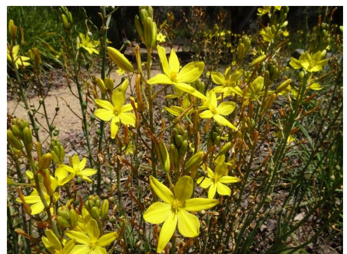
Bulbine bulbosa , Bulbine Lily. A densely tufted perennial herb of dry sclerophyll woodlands and grasslands found from Queensland to Tasmania and SA