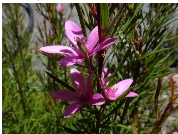
Crowea exalata Ginninderra Falls, Small Crowea. An attractive long flowering local species.

Our working bees are now allowed to expand to twenty-five volunteers . Check in CBR is still required at our shed. A BYO morning tea is held at the tables near the shed. We have sufficient chairs to be able to space out.