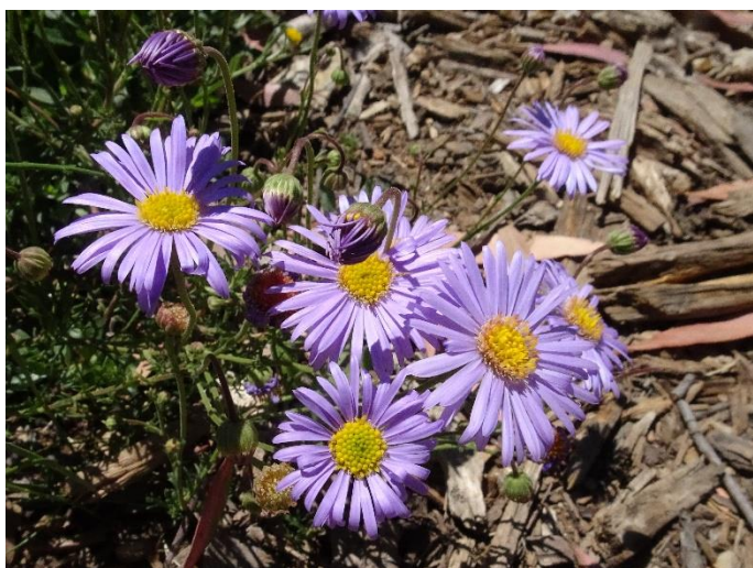
Brachyscome rigidula , Cut-leaf Daisy. A sprawling wiry perennial daisy with hairy stems.