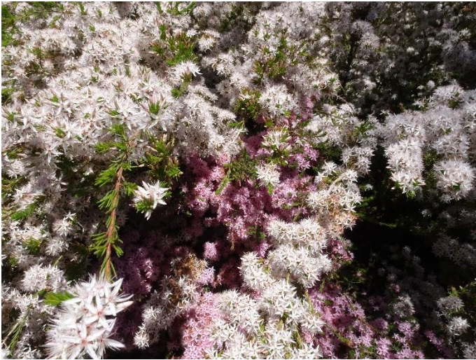
Calytrix tetragona , Common Fringe Myrtle. A hardy medium sized shrub with massed white and pink flowers.