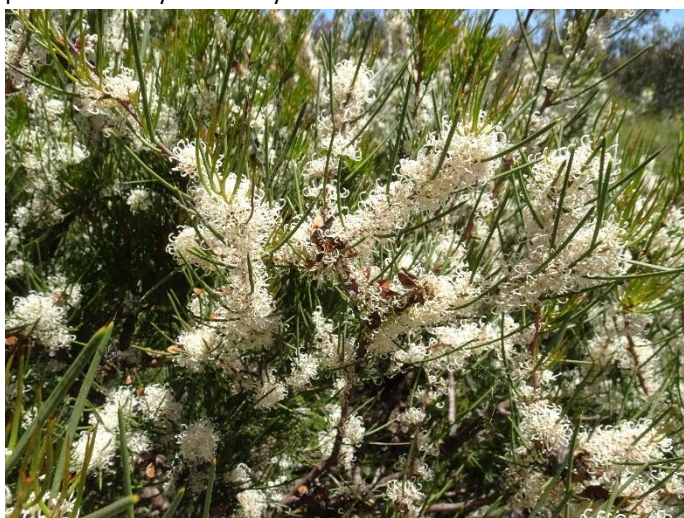
Hakea microcarpa , Small-fruited Hakea. A woody shrub with spikey leaves. An east coast shrub of the coast, ranges, and tablelands.