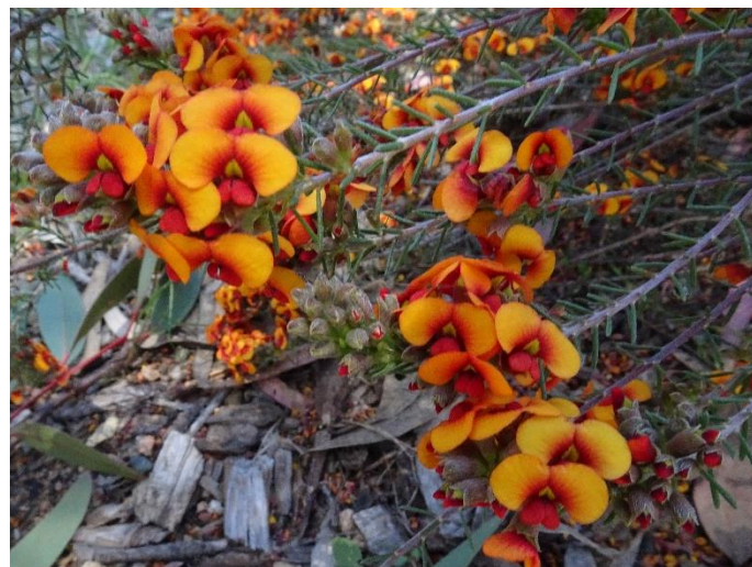
Dillwynia sericea , Showy Parrot-pea. This pea is found across widespread eastern NSW.