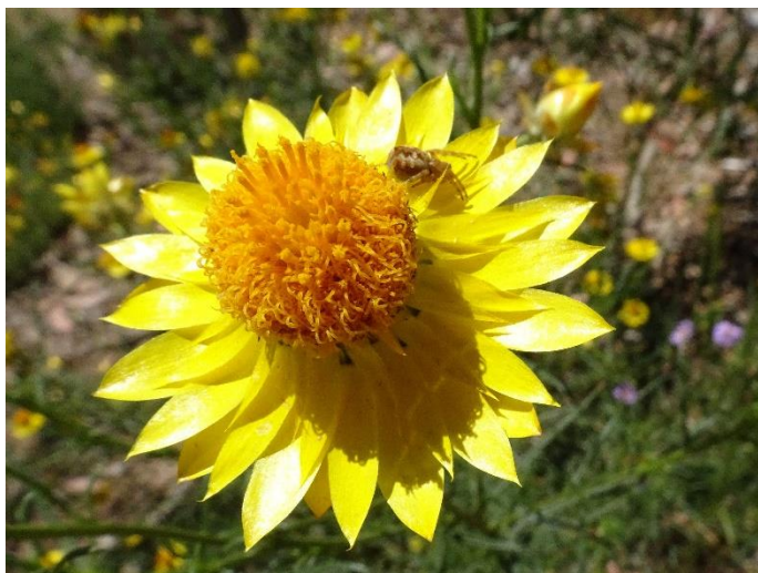
Xerochrysum viscosum , Stick Everlasting with an Orb weaver Spider Araneidae family.