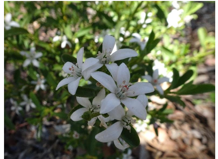
Philotheca myoporoides Long-leaf Waxflower. A hardy large shrub of the eastern states.