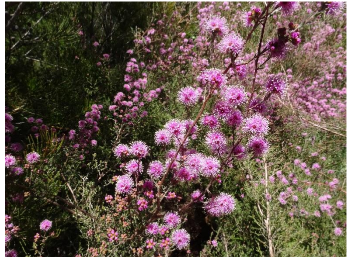
Kunzea parvifolia , Violet Kunzea. An upright form of this species which has been in cultivation for many years.