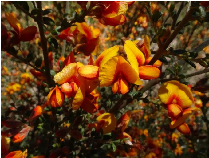
Mirbelia oxylobioides Mountain Mirbelia. An attractive medium sized pea that is about one metre high.