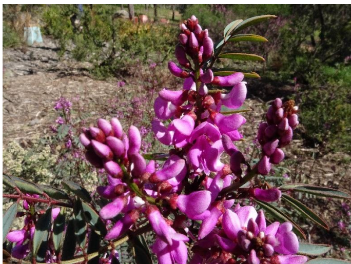
Indigofera australis , Austral Indigo. An open woody shrub that responds well to pruning after flowering.