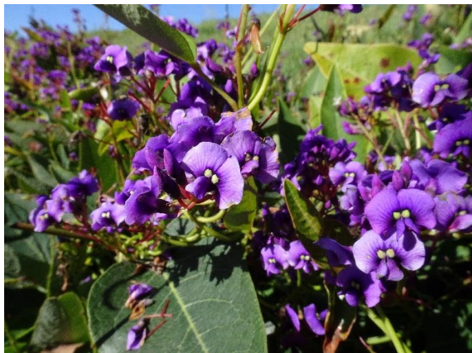
Hardenbergia violacea , False Sarsaparilla. Flowering in several locations at Forest 20.

Of Interest at Forest 20, October 2020 Number 66