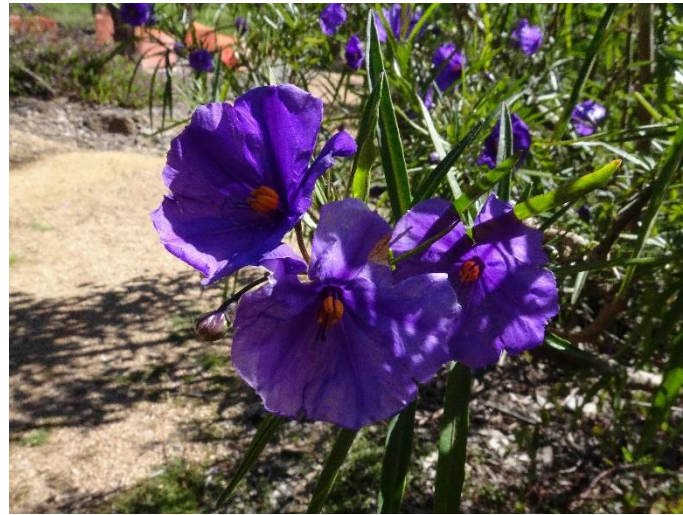
Solanum linearifolium , Mountain Kangaroo Apple. A long-flowering erect shrub.