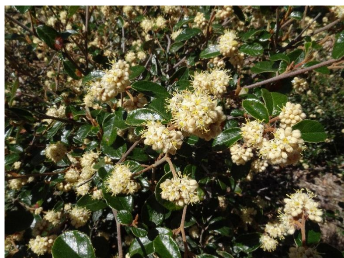
Pomaderris betulina ssp. actensis , Birch Pomaderris. A dense shrub restricted to rocky valleys of the ACT & nearby NSW.

While we respect the Coronavirus threat, the STEP working bees are still being held each Thursday from 8am. Car parking is now in the new parking area. Park where you see a group of cars. Morning tea is byo and held in the usual place with personal distancing.