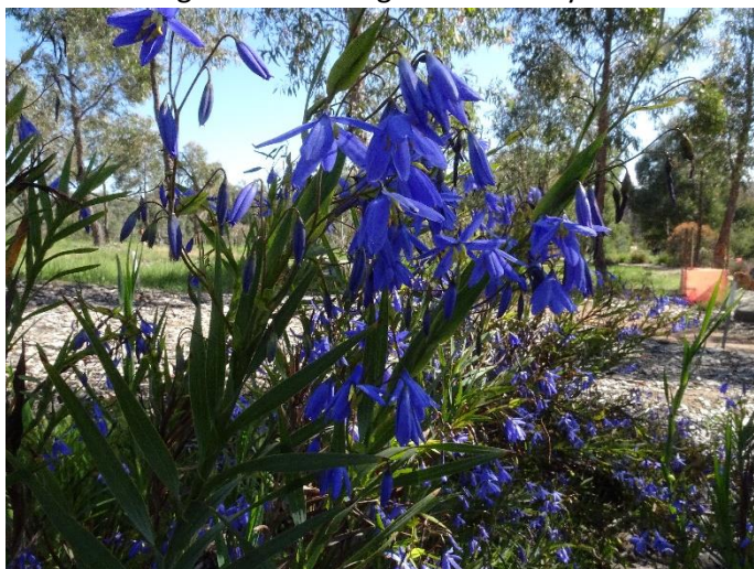
Stypandra glauca , Nodding Blue-lily. A long-lived plant that tolerates frost and dry conditions.