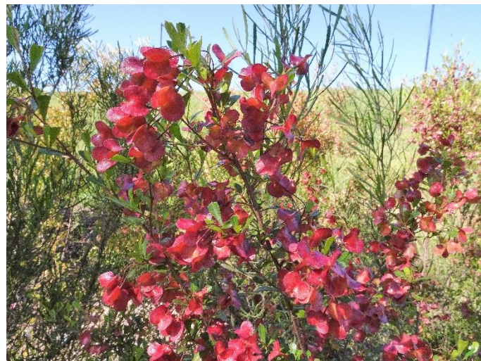
Dodonaea viscosa ssp. angustissima , Narrow-leaved Hop Bush. A tall shrub widespread in mainland states.