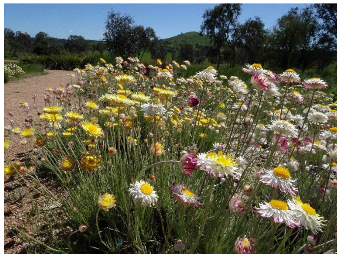
Leucochrysum albicans , Hoary Sunray. A long-flowering local daisy oft show in our photo sheets.