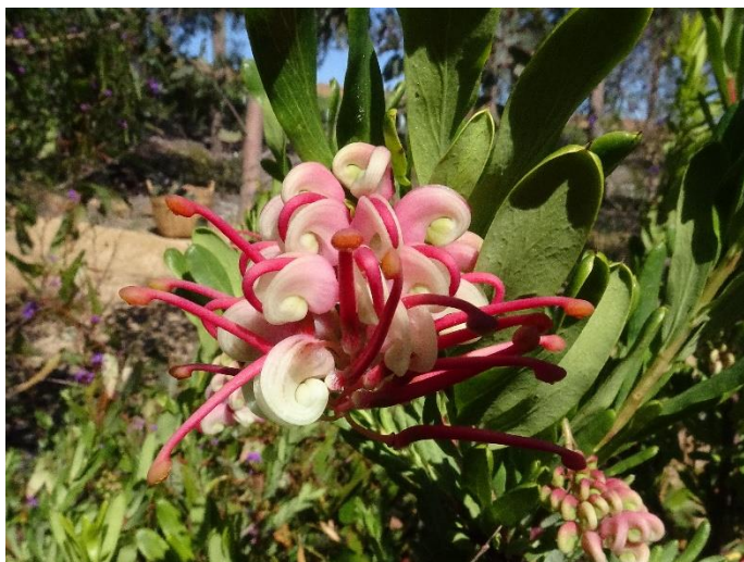
Grevillea iaspicula , Wee Jasper Grevillea. A tall shrub that is endangered where it grows naturally.