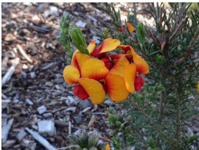
Dillwynia sericea , Showy Parrot-pea. A small shrub found across south eastern Australia.