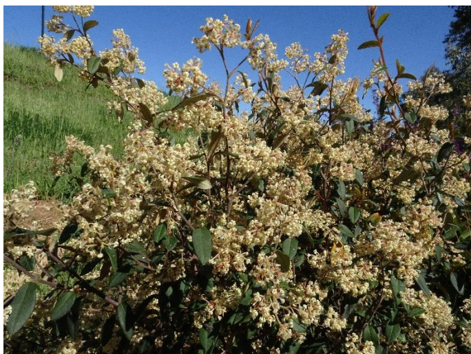
Pomaderris intermedia , Lemon Dogwood. A shrub that may grow to three metres.