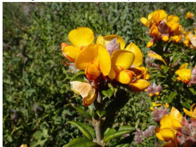
Oxylobium ellipticum , Common Shaggy-pea. A dense shrub, up to 2 metres tall, of forest locations.