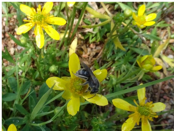
Ranunculus papulentus Large River Buttercup with Lassioglossum lanarium a Halictid Native Bee.