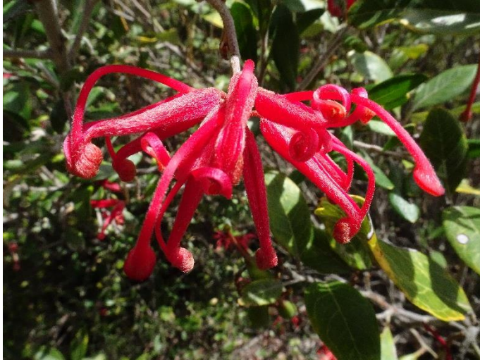
Grevillea victoriae subsp. nirvalis Mountain or Kosciusko Grevillea. The only grevillea found there.