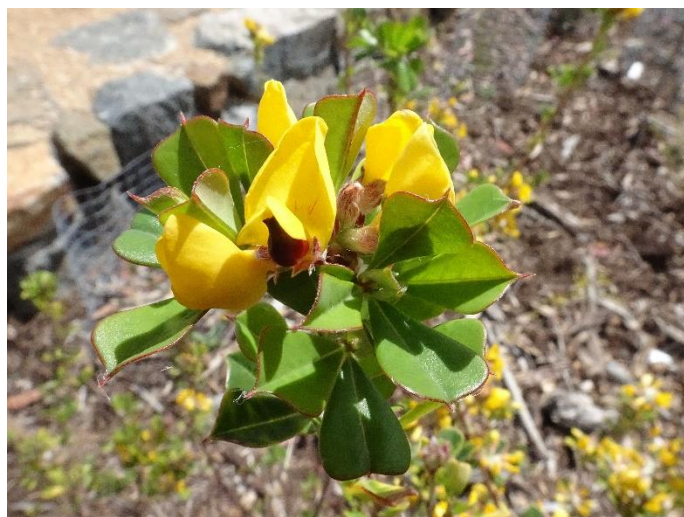
Pultenaea daphnoides Large-leaved bush-pea. One of our newer pea species found in our Parade of Peas.

Our working bees are held each Thursday morning from 8am. Morning tea (byo) is at 10am at the tables near the shed. Tools are supplied. New volunteers are welcome, just turn up and make yourself known.