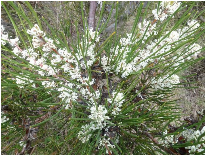
Hakea microcarpa Small-fruited Hakea. A dense woody shrub with spiky leaves. Flowers attract insects