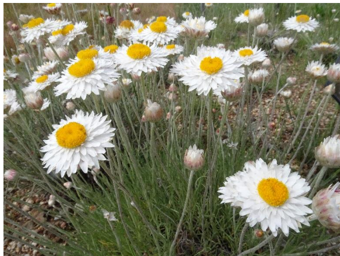
Leucochrysum albicans Hoary Sunray. An attractive perennial daisy with white or yellow ray florets.