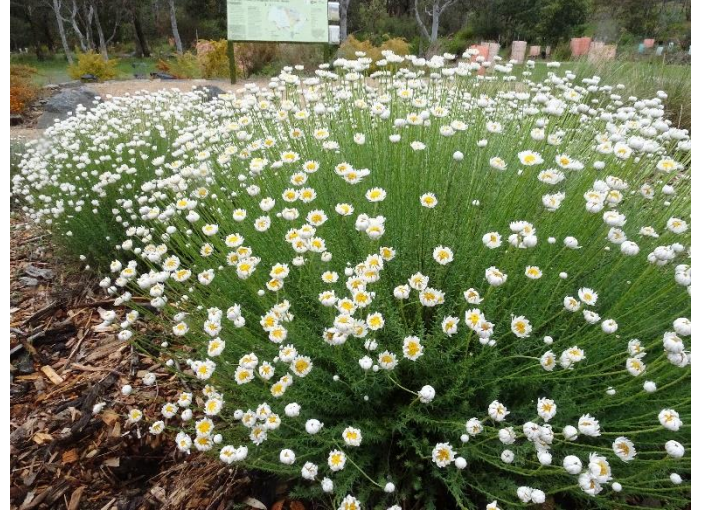
Rhodanthe anthemoides Camomile Daisy. A particularly attractive perennial daisy.