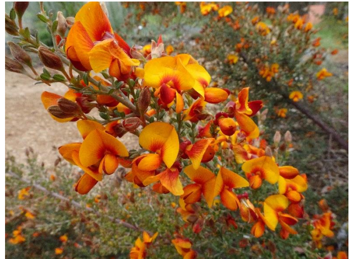
Mirbelia oxylobioides Mountain Mirbelia. A shrub of up to 1.5m generally found at higher altitudes.