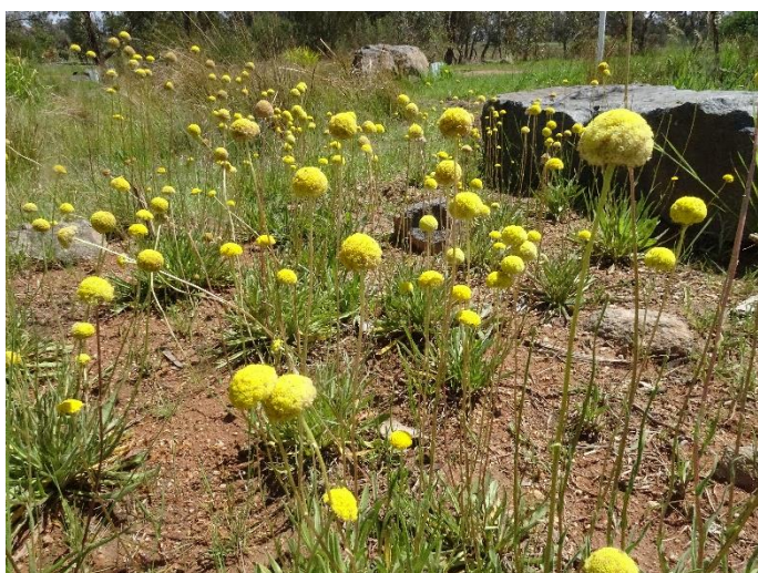
Craspedia variabilis Billy Button. A widespread annual or perennial species that tolerates damp conditions.