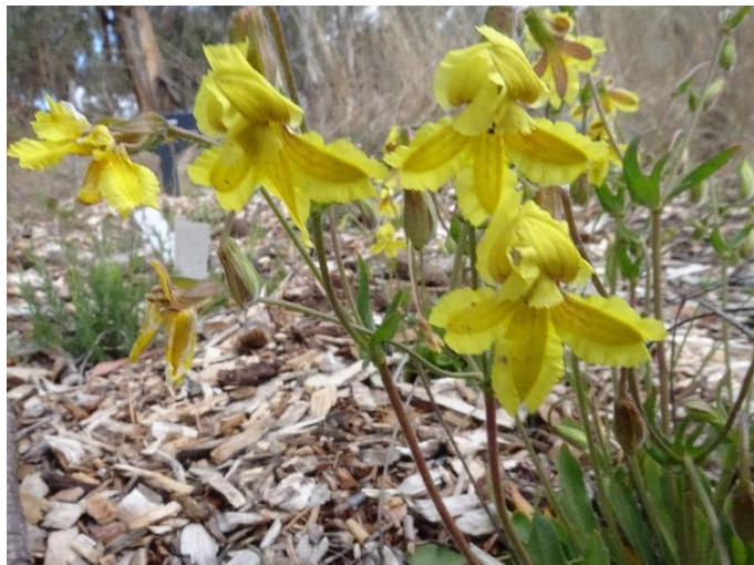
Velleia paradoxa Spurred Velleia. A perennial herb of the Goodeniaceae family found across the southeast.