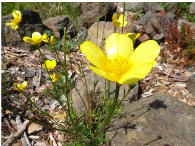
Ranunculus lappaceus Common Buttercup. A perennial herb that is found across eastern Australia.