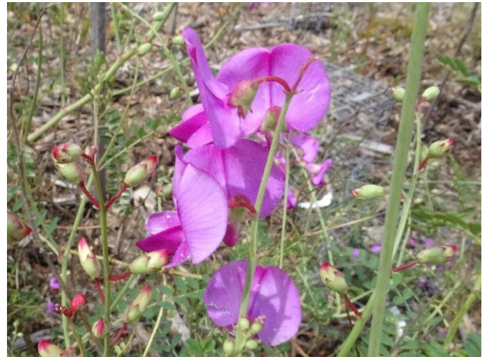
Swainsona galegifolia Smooth Darling Pea. A long flowering attractive pea