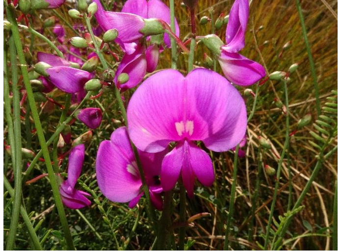
Swainsona galegifolia Smooth Darling Pea. A very long flowering tall attractive pea.