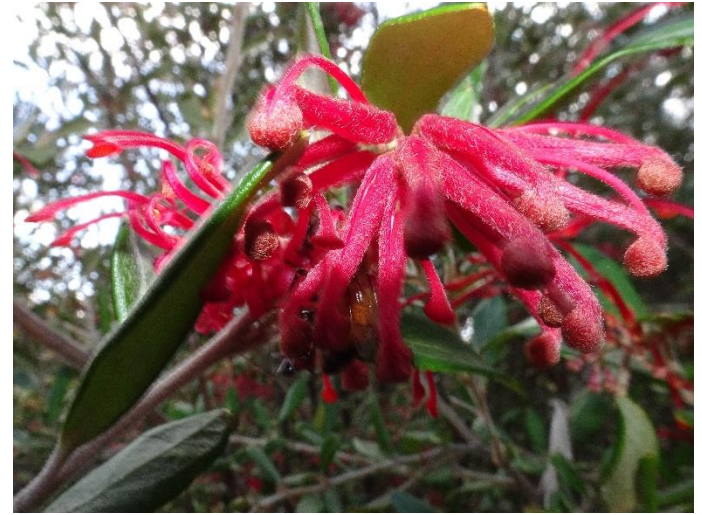
Grevillea victoriae subsp. nivalis Mountain Grevillea. A particularly long flowering shrub. Found south of the ACT.

Our working bees are held every Thursday from 8-30am. Morning tea (byo) is at 10am at the tables near the shed. Tools are supplied. New volunteers are welcome, park near the Forest 20 entrance, just turn up and make yourself known.