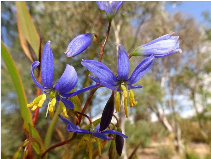
Stypandra glauca Nodding Blue Lily. A drought and frost tolerant species.