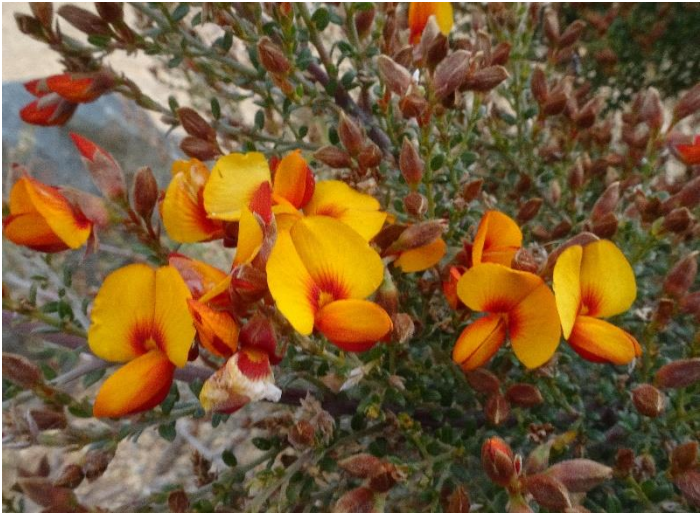
Mirbelia oxylobioides Mountain Mirbelia. A bushy shrub to 1.5 metres with attractive flowers.