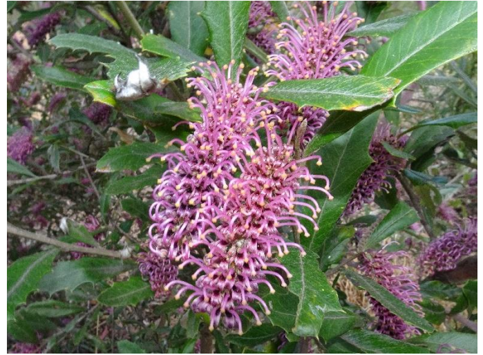
Grevillea Wilkinsonii Tumut Grevillea. A rare species of the Southern Tablelands