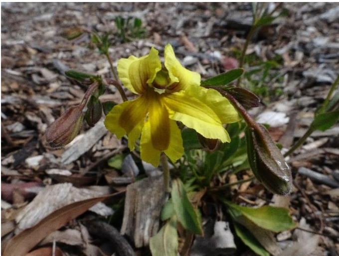
Velleia paradoxa Spurr Velleia. A short lived perennial herb. Widespread across NSW.