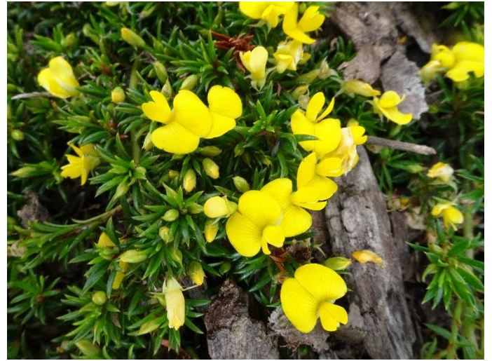
Pultenaea pedunculata Matted Bush-pea. A rare and endangered species. May cover several metres.