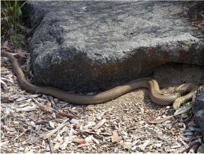
Pseudonaja textilis Eastern Brown. Beware of this fellow seen near our entrance.