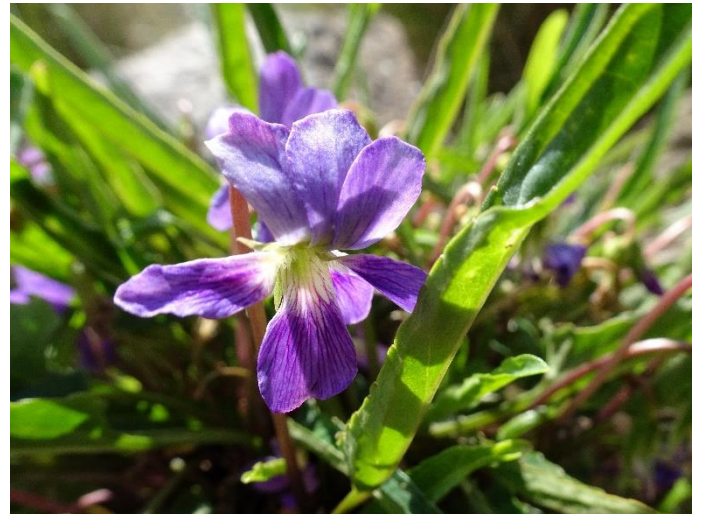
Viola betonicifolia Mountain Violet. May set seed without obvious flowering.