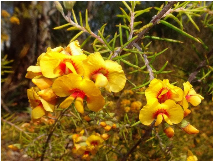
Dillwynia sieberi Prickly Parrot-pea. Not a common species in cultivation but worth having.