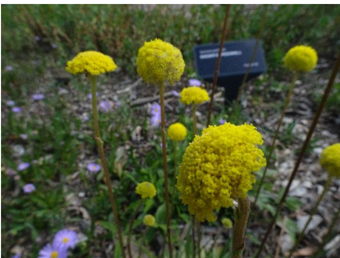
Craspedia variabilis Billy Buttons. A species that is widespread across eastern and southern Australia

Our working bees are held every Thursday from 8-30am. Morning tea (byo) is at 10am at the tables near the shed. Tools are supplied. New volunteers are welcome, park near the Forest 20 entrance, just turn up and make yourself known.