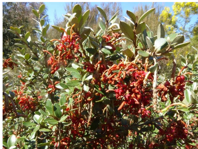
Grevillea diminuta , Brindabella Grevillea. A small shrub that tends to hide its flowers.