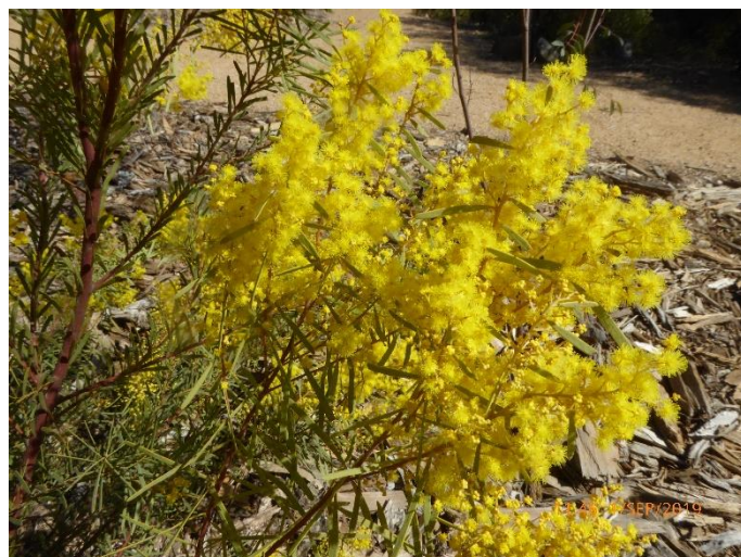
Acacia boormanii , Snowy River Wattle. This is a suckering shrub that tolerates a variety of soils.