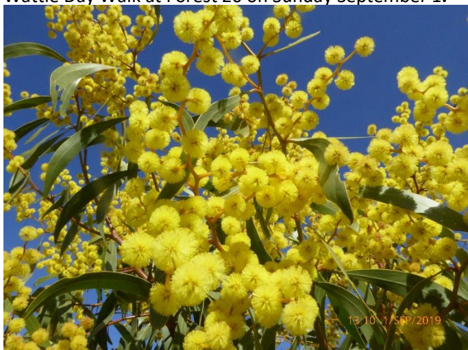
Acacia pycnantha , Golden Wattle. This acacia is the National Floral Emblem.