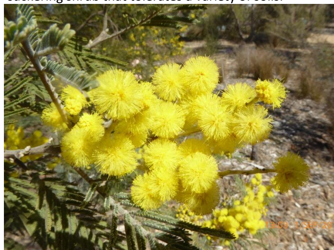
Acacia dealbata , Silver Wattle. A reasonably fast-growing tree that flowers profusely.