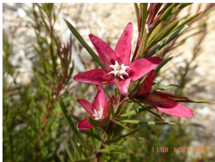
Crowea exalata "Ginninderra Falls", Small Crowea. A long flowering local plant. Colour is darker than usual.