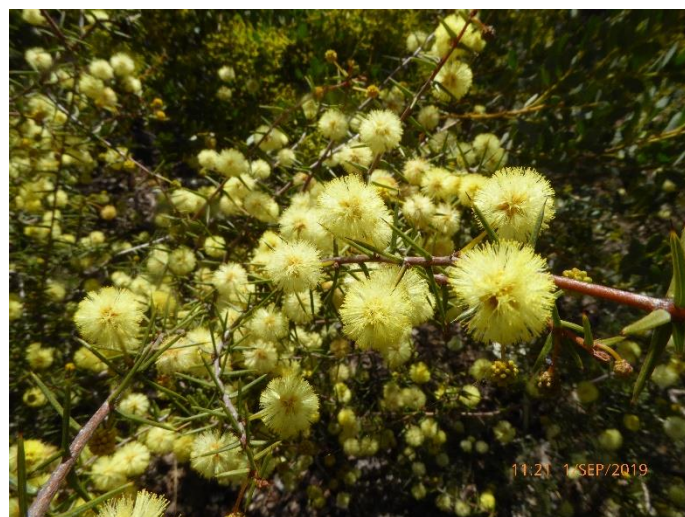
Acacia ulicifolia , Juniper Wattle. A spiny low growing local wattle. Provides cover for small birds.

Working bees are held every Thursday morning from 8am, feel free to join our friendly group at whatever time you are able. We break for morning tea at 10 am at the table near our shed. An excellent BYO morning tea is guaranteed. Park on grassy overflow section.