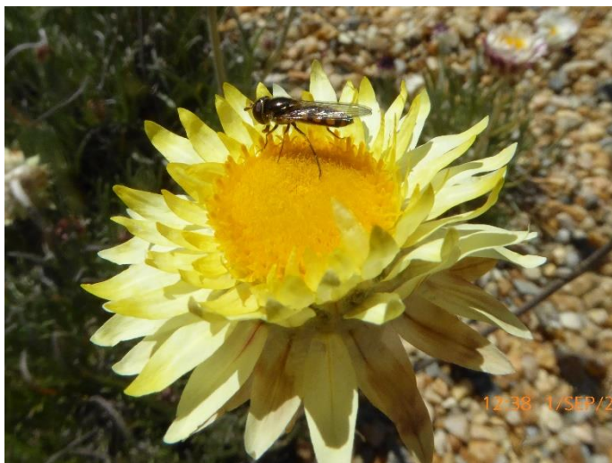
Leucochrysum albicans , Hoary Sunray with Melangyna viridiceps , the Common Hoverfly.