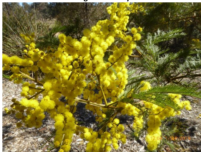
Acacia decurrens , Black Wattle. A medium sized tree with bipinnate leaves. It is fast growing species.