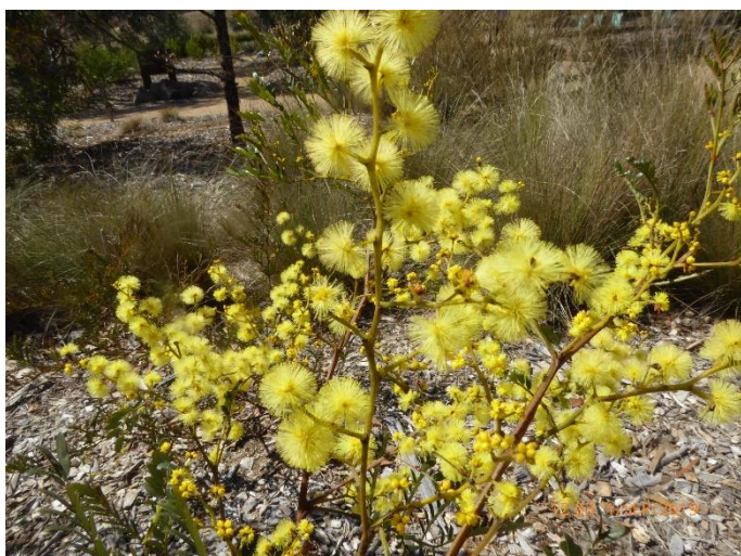
Acacia terminalis , Sunshine Wattle. A dense shrub up to 3m in height. This is a young plant.