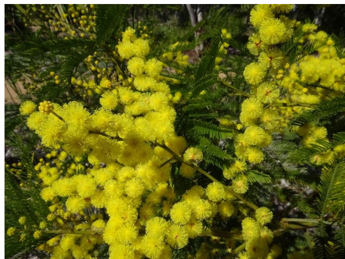
Acacia decurrens , Black Wattle. A medium sized tree with dark green bipinnate leaves.