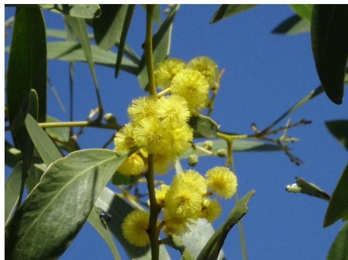
Acacia pycnantha , Golden Wattle. The floral emblem of Australia. Just starting to bloom.