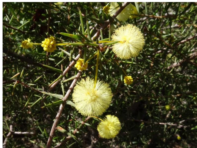
Acacia ulicifolia , Juniper Wattle. A spiny low shrub that may be pale flowered. pale flowered.