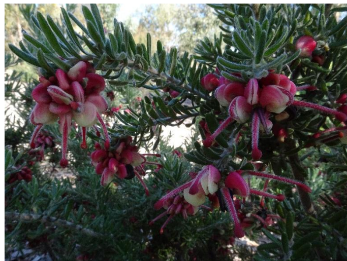
Grevillea lanigera , Woolly Grevillea. Named for its hairy branchlets and leaves. A woodland species.