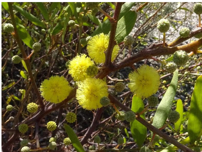
Acacia verniciflua , Varnish Wattle. A wattle that is lesser known. The phyllodes are sticky and lustrous.

Of Interest at Forest 20, September 2020 Number 65