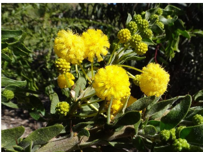
Acacia paradoxa , Kangaroo Thorn. A spiny woodland species. Widely distributed ACT, NSW Qld Victoria SA