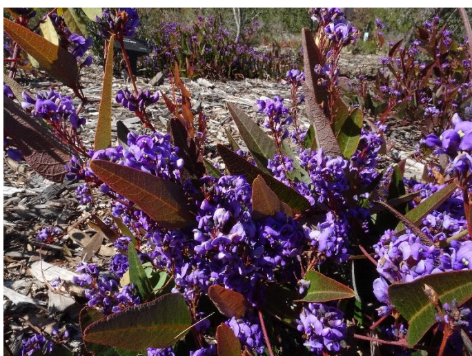
Hardenbergia violacea , False Sarsaparilla. A well-known woodland species often seen locally.