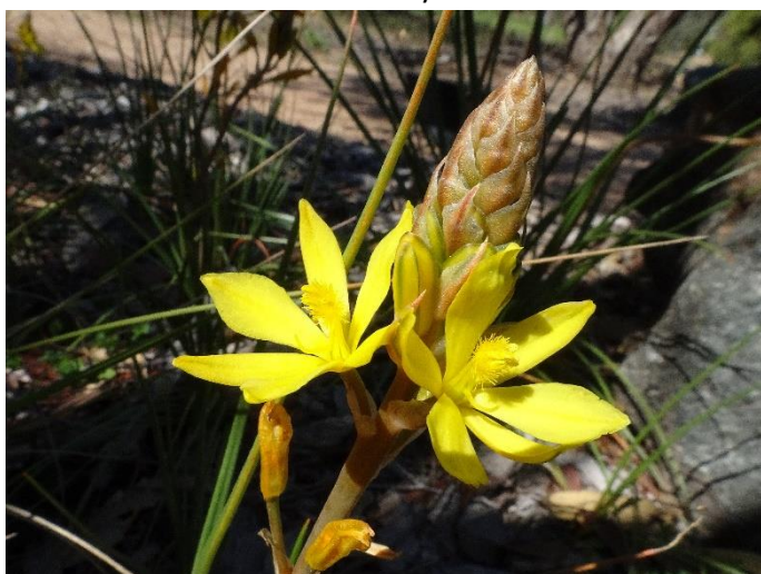
Bulbine bulbosa , Bulbine Lily. Quite a widespread species of the eastern states. Prefers moist conditions.