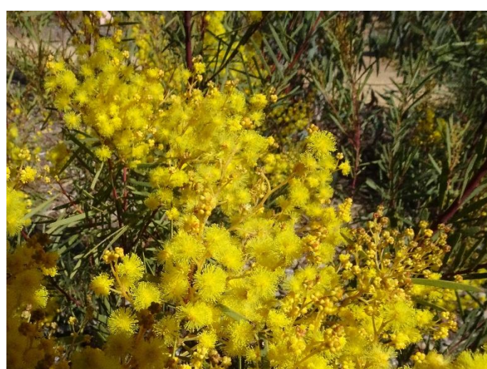
Acacia boormanii , Snowy River Wattle. A medium sized shrub that may sucker. An attractive species.

While we respect the Coronavirus threat, the STEP working bees are still being held each Thursday from 8am. Car parking will be in the main car park till the new parking area is opened. Parking permits are available for our volunteers. Morning tea is byo and held in the usual place with personal distancing.