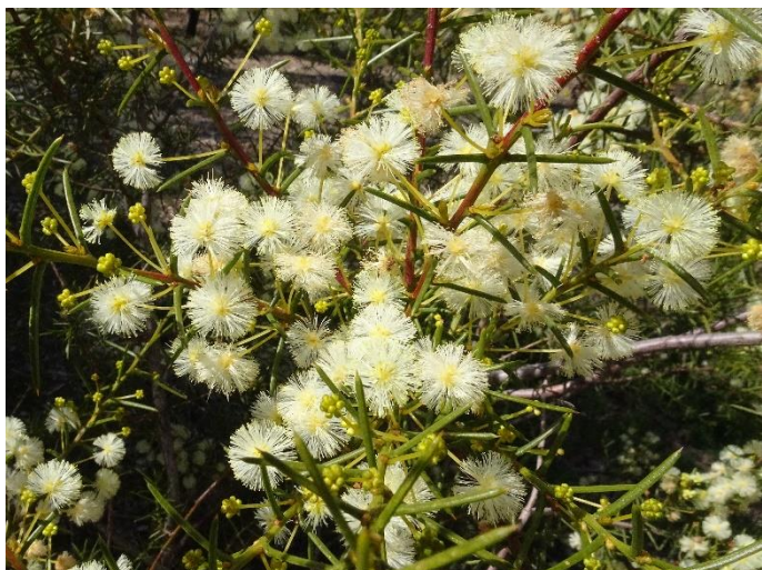
Acacia genistifolia , Early Wattle. Provides cover for small birds. Flowers from autumn to spring.