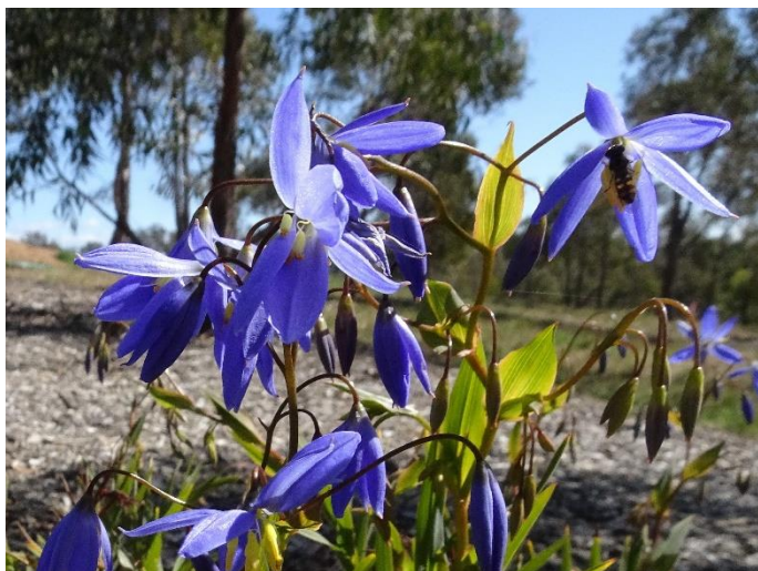
Stypandra glauca , Nodding Blue-lily. A long-lived plant that tolerates both frost and dry conditions.