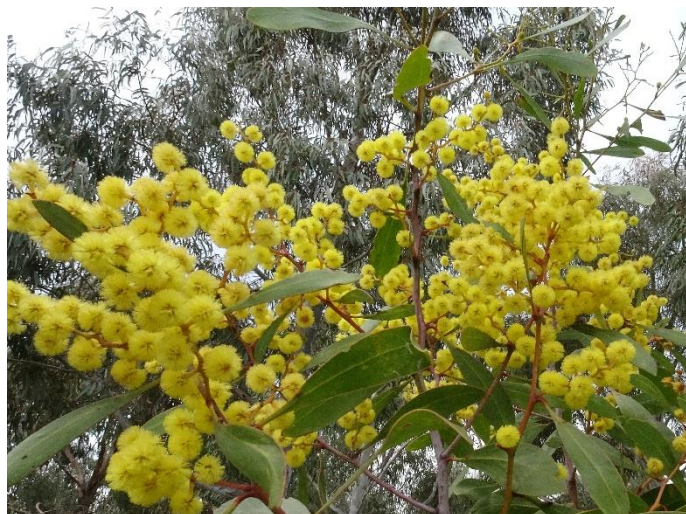
Acacia pycnantha , Golden Wattle. The floral emblem of Australia. A tall shrub or small tree.