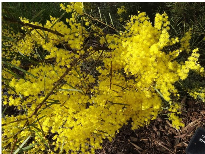
Acacia boormanii Snowy River Wattle. A medium sized shrub that is known to sucker.