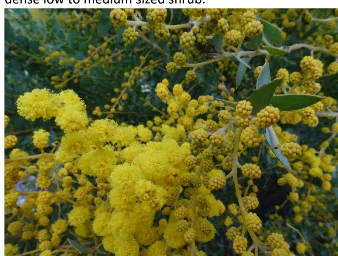
Acacia cultriformis , Knife-leaf Wattle. A widely cultivated large shrub.

Our working bees are much curtailed due to the current Covid 19 lockdown. The Canberra lockdown has recently been extended for another two weeks. Check in CBR remains at our shed.