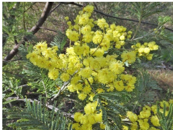
Acacia dealbata , Silver Wattle. One of the most common local wattles in our local bushland.