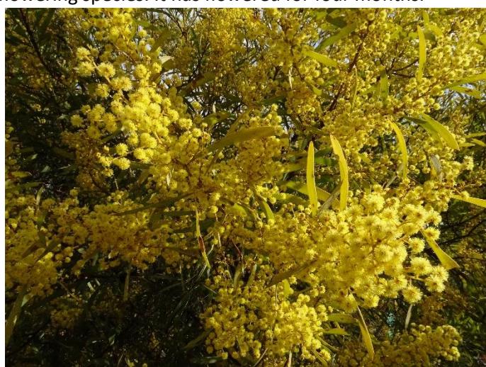
Acacia rubida , Red-stemmed Wattle. An upright large shrub or small tree with variable phyllodes.