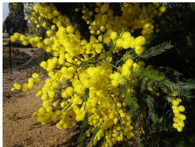
Acacia decurrens , Early Black Wattle. A tall tree in the Bush Tucker Garden looking pretty at its best.