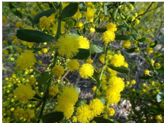
Acacia acinacea , Gold Dust Wattle. This is an attractive fast growing small to medium shrub.