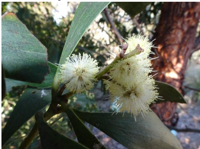
Acacia melanoxylon , Blackwood. This species has broad veined phyllodes and is just starting to flower.