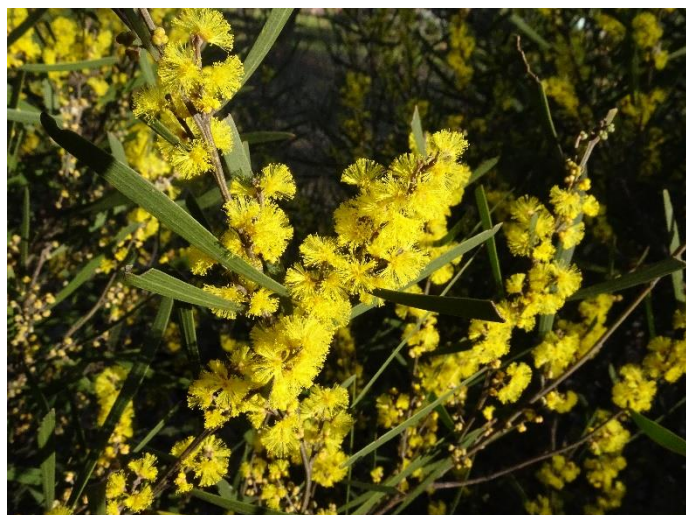
Acacia dawsonii , Poverty Wattle. A small erect shrub with dense foliage.