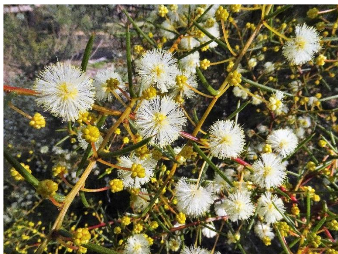
Acacia genistifolia , Early Wattle. This is our longest flowering species. It has flowered for four months.