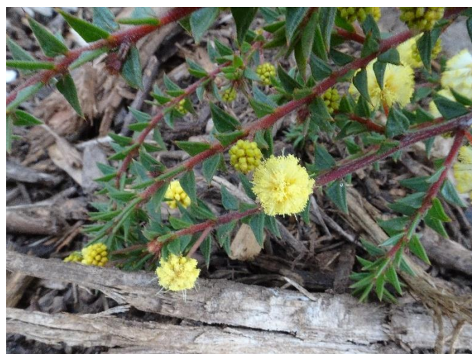
Acacia gunnii , Ploughshare Wattle. A low growing wattle with short sharp phyllodes.