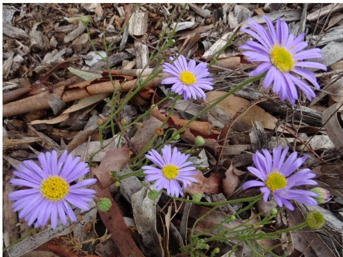
Brachyscome rigidula Cut-leaf Daisy. A sprawling wiry perennial daisy with blue to mauve ray florets.