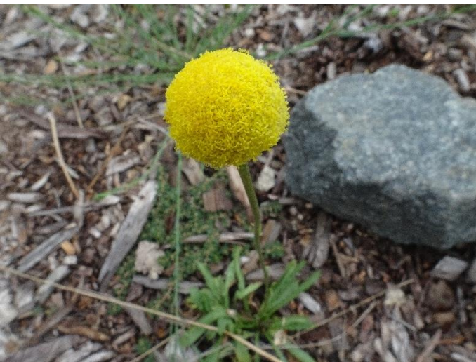
Craspedia variabilis Billy Buttons. Unusually late to see this flowering. May be annual or perennial.