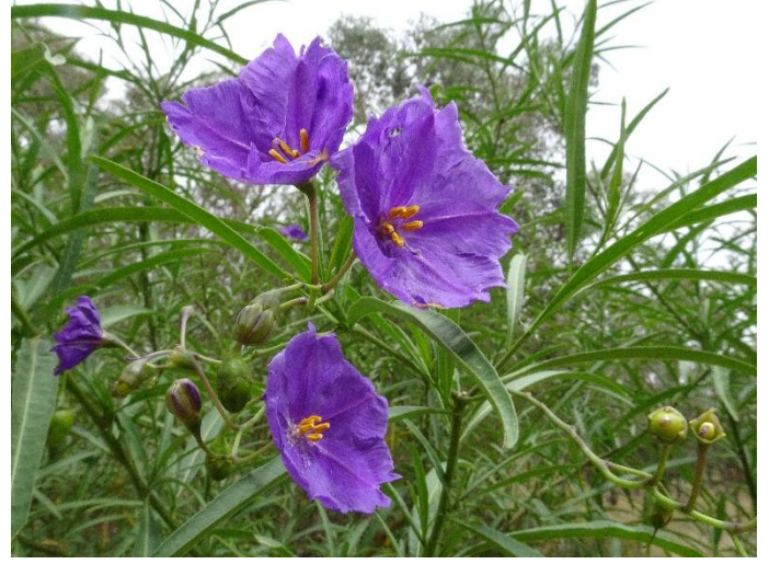
Solanum linearifolium Mountain Kangaroo Apple. A tall woody species that reseeds readily.

Our working bees are held every Thursday from 8-30am. Morning tea (byo) is at 10am at the tables near the shed. Tools are supplied. New volunteers are welcome, park near the Forest 20 entrance, just turn up and make yourself known.