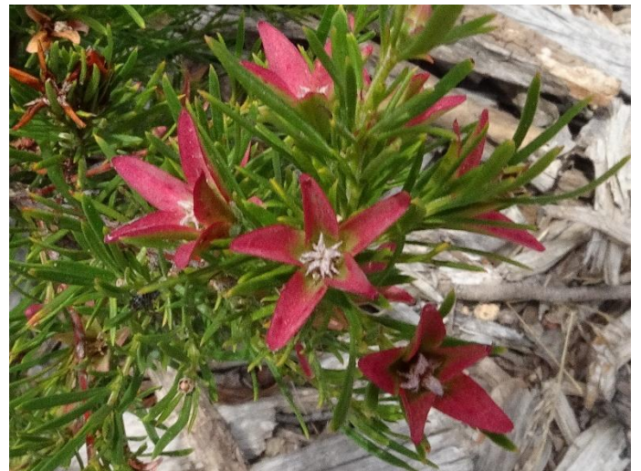
Crowea exalata Ginninderra Falls. A most attractive long flowering species that has a compact form.