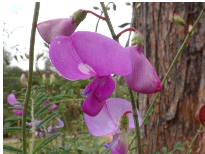
Swainsona galegifolia Smooth Darling-pea. A particularly long flowering tall perennial pea.