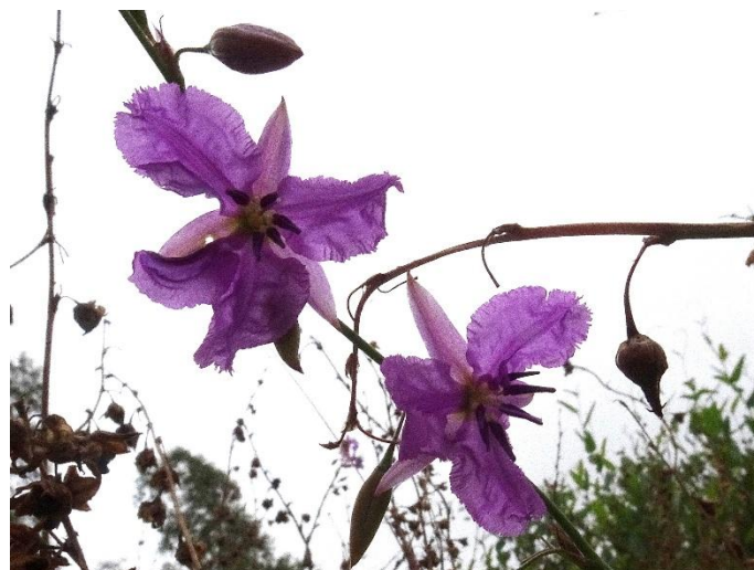
Dichopogon fimbriatus Chocolate Lily. Known for the chocolate fragrance of the flowers.