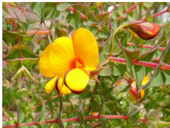
Pultenaea spinosa Spiny Pea-bush. Generally, an erect pea that is notable for its whorled leaves.