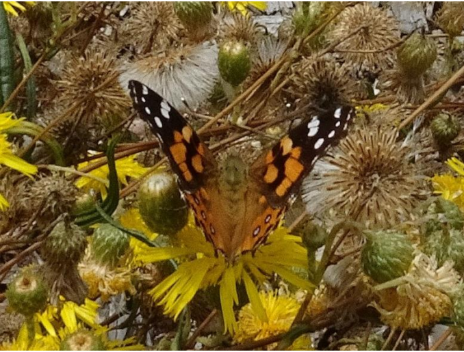
Vanessa kershawi Australian Painted Lady on Podolepis jaceoides Showy Copper-wire Daisy.