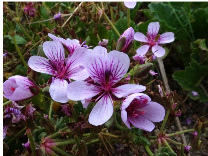
Pelargonium sp. Striatellum Omeo Storksbill. A yet to be formally named endangered species.