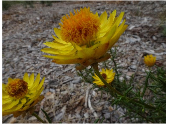
Xerochrysum viscosum Sticky Everlasting. A perennial local daisy can be seen on roadsides.