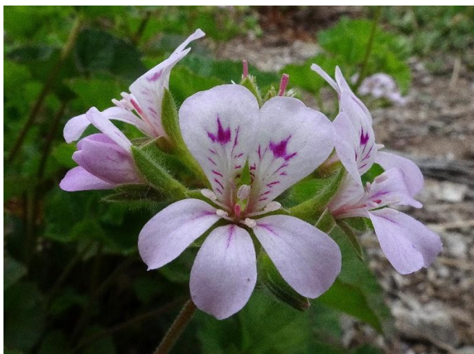
Pelargonium australe Austral Storksbill. A hardy species to 0.5m and that will self-seed.