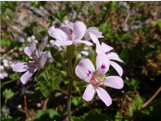
Pelargonium australe Austral Storksbill. This group of plants are favoured by the Blue Banded Bee.