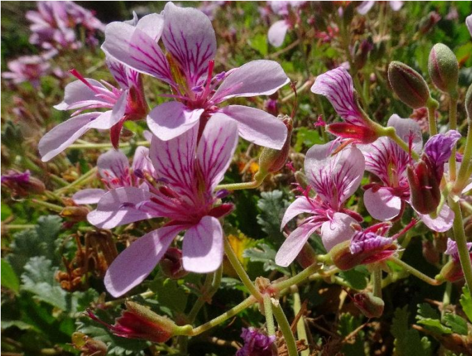
Pelargonium sp. Striatellum Omeo Storksbill. A yet to be formally named endangered species.