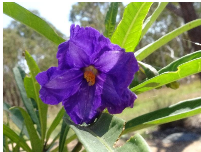
Solanum linearifolium Mountain Kangaroo Apple. A tall woody species that reseeds readily.