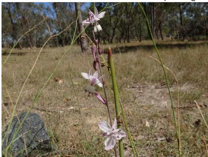
Arthropodium milleflorum Vanilla Lily. A tuberous perennial herb with slightly scented flowers.