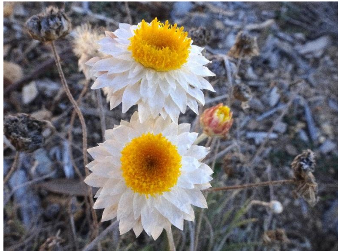
Leucochrysum albicans Hoary Sunray. An attractive daisy with white or yellow ray florets. Grows well on gravelly well drained surfaces.