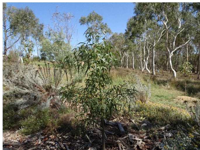
Brachychiton populneus Kurrajong with Eucalyptus mannifera Brittle Gum in the background.