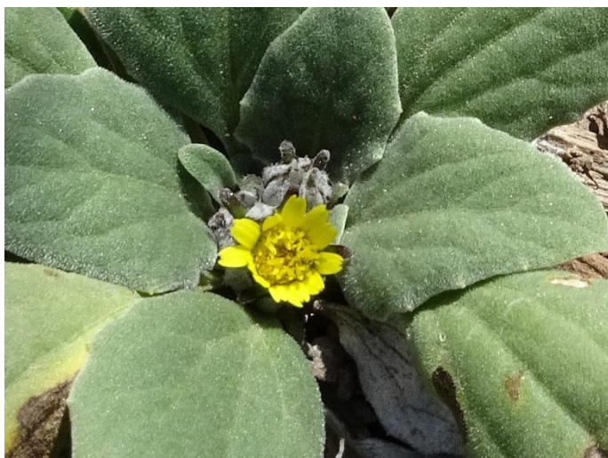
Cymbonotus lawsonianus Bears Ears. This plant has self-seeded in our wetland from its first planting.