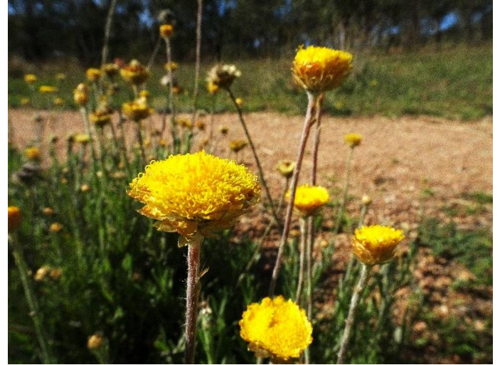
Coronidium gunnianum Pale Everlasting. Another of our long flowering perennial daisies.