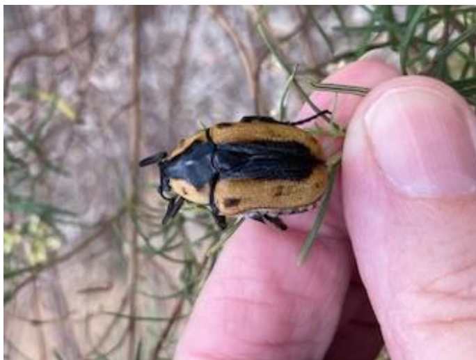
Chondropyga dorsalis Cowboy Beetle was on Cassinia quinquefara