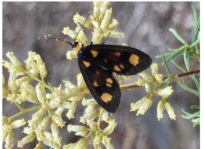
Asura sp. A Tiger moth on Cassinia quinquefara Sifton Bush.