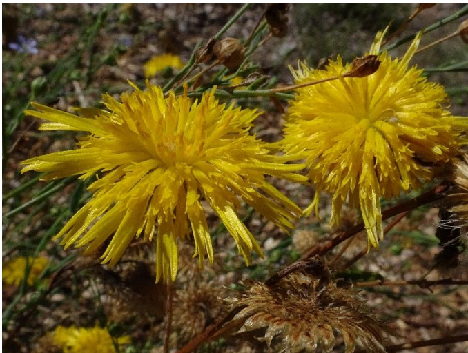
Podolepis jaceoides Showy Copper-wire Daisy. A long flowering perennial daisy. Native bees often seen on this species.